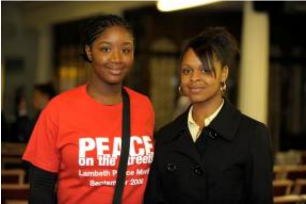
Lambeth Peace Service