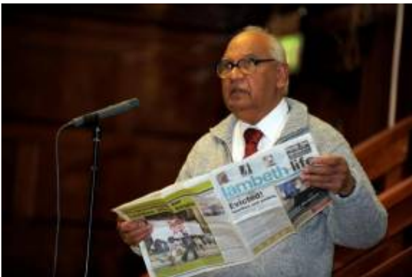
Faith in the Community event