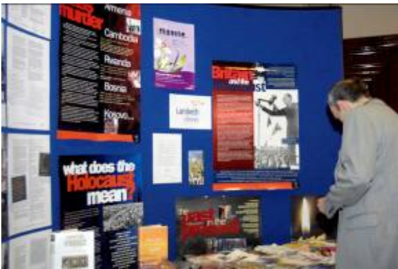
Holocaust Memorial Day 2008