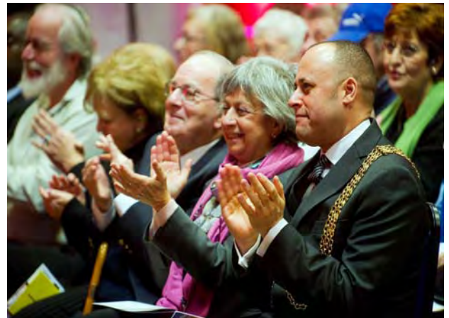
Holocaust Memorial Day Event (see page 2)

The sentiments and opinions expressed in this newsletter are those of the authors from a variety of organisations and may not necessarily represent those of Lambeth Council.