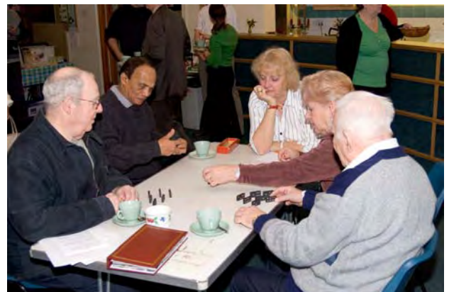
The members of Lewin Friendly Club (See page 4)