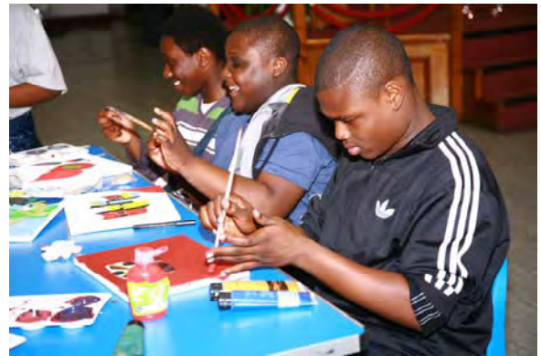
Young people from the Lighthouse Education Services (See Page 1.)

The sentiments and opinions expressed in this newsletter are those of the authors from a variety of organisations and may not necessarily represent those of Lambeth Council.