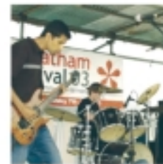
Images from streatham Festival 03