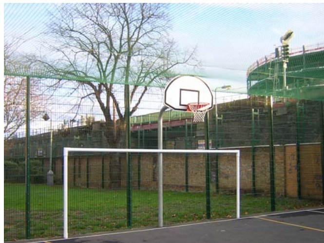
Play area at Canterbury Gardens

March 29 th 2006 at 7.30 p.m. – Brixton Area Committee meeting, St Matthew's Tenants Hall, St Matthew's Road, SW2