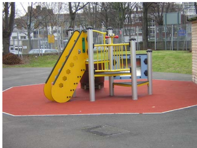
Play equipment installed in St John's Victory Nursery

*the Brixton Town Centre area is defined as being made up of the five wards of Brixton Hill, Tulse Hill, Coldharbour, Ferndale and Herne Hill