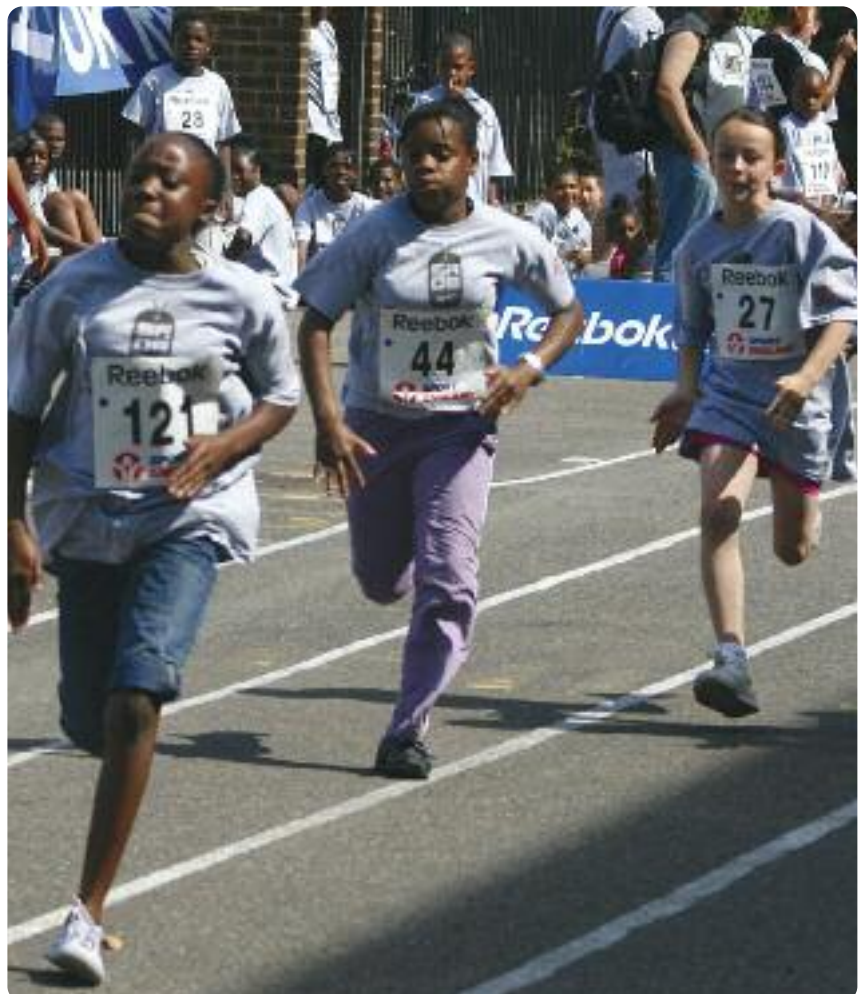
2008 Lambeth Street Athletics finals at the Lilian Baylis Old School

Kate Hoey MP and Co-Chair of Sport Action Zone