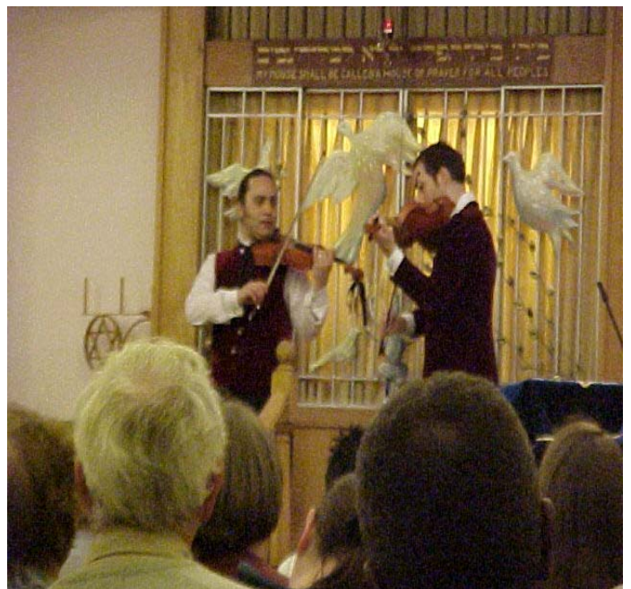
Jewish Klezmer musicians (two of three)

The evening came to a rousing conclusion with an impressive selection of Eastern European Jewish "klezmer" folk melodies and dances.