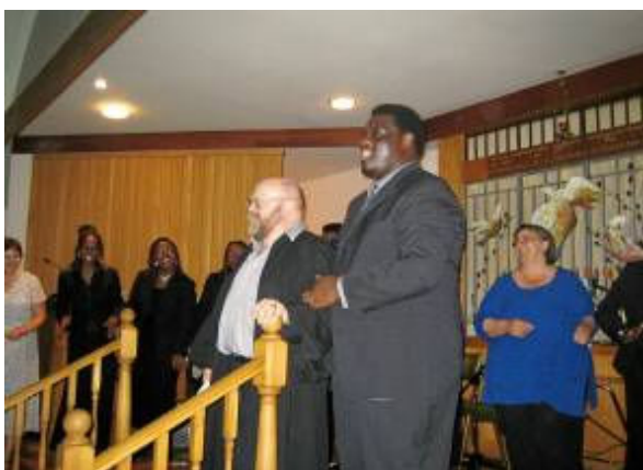
Ruach Choir with one of our own. Can you spot the familiar face?

This was followed by Rivers of Babylon, an ensemble of singers and instrumentalists who specialise in the Jewish musical traditions of India.