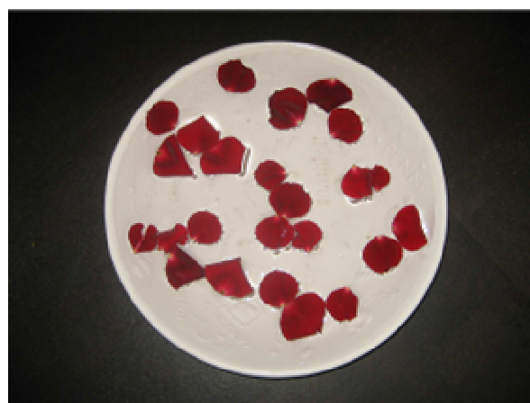
Rose petals in a bowl of water

As part of the Peace Week activities, the evening of Sunday 17 th September saw Lambeth's commemoration of victims of violent crime at St. Andrew's Church, Landor Road. This non-denominational, multi-faith event was a wonderful opportunity for the friends and families of victims to come together and voice a shared commitment to peace and reconciliation, and to remember those lost. Representatives of eight different faith communities stood together and spoke words of peace and unity from their respective traditions and holy books.