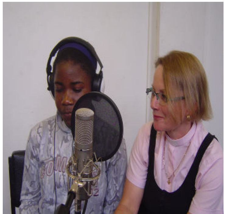
Young people of faith and no faith took over the air waves of Southside 101.4 FM broadcasting six days a week from church.co.uk. A radio station created for young people by a partnership of local youth initiatives. The project was funded by the Lottery's Big Boost scheme and Lambeth Council. Continued on page 9.

It's that time of the year again. For most of us we are approaching the end of another year. Throughout the year, Faith Groups in Lambeth have been working tirelessly as always, providing a diverse range of services to members and local neighbourhoods. We appreciate the work you are doing to keep the community spirit alive. On behalf of the team, we would like to say a well deserved thanks to all Faith Groups in Lambeth.