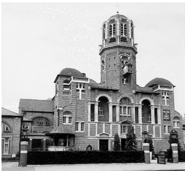
Christ Church, North Brixton

The large Byzantine style building, with domes and towers, houses a café and charity shop, runs a youth group and food assistance programme and the church is involved in various aspects of community development. The building is also used by four community churches and by a variety of local groups.