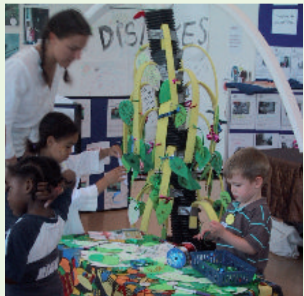
Children enjoying the activities at the exhibition.