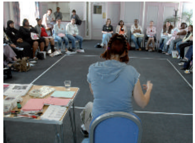
The storytelling workshop.

Listening to disabled children – a chance to explore ideas, principles, policy and practice in this area with an emphasis on taking an inclusive approach.