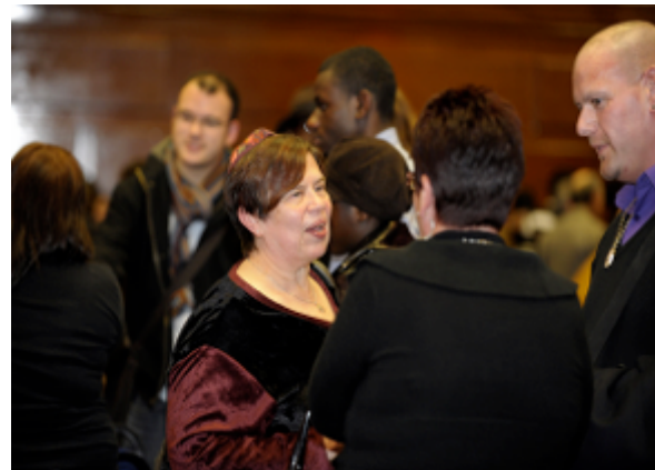
Representatives from different faith organisations at the Holocaust Memorial Day 2009