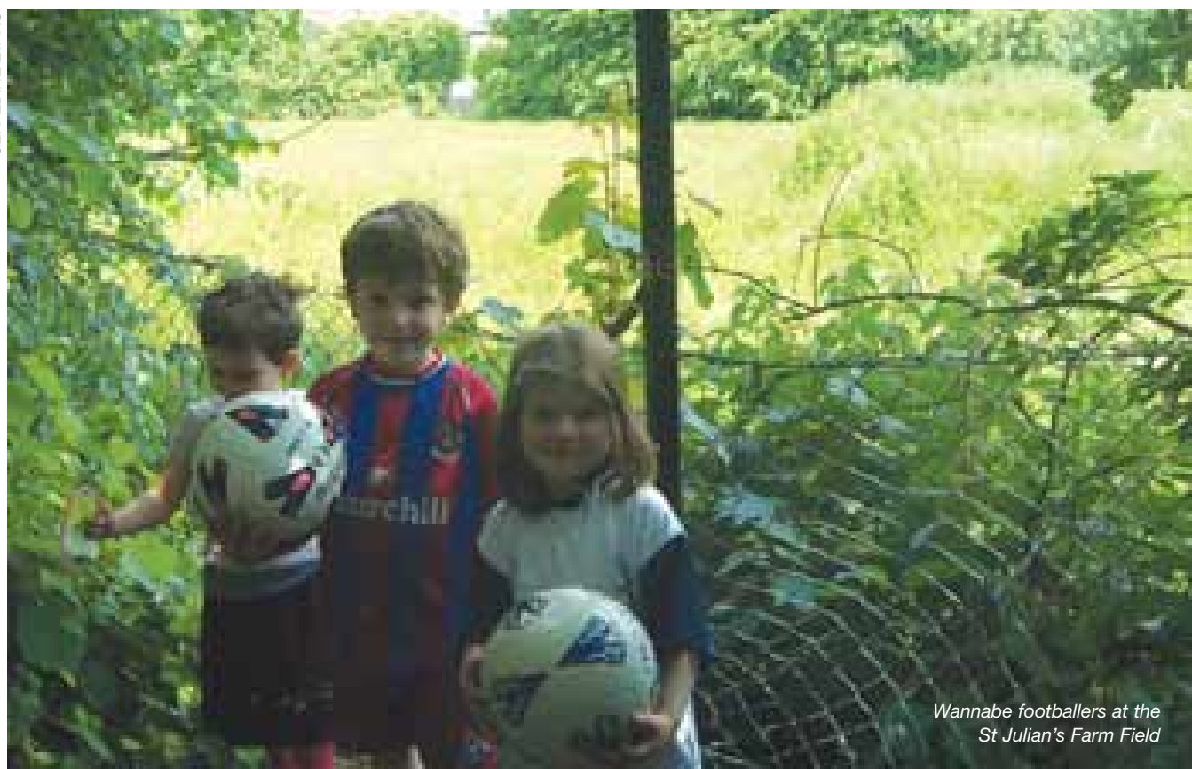
Wannabe footballers at the St Julian's Farm Field