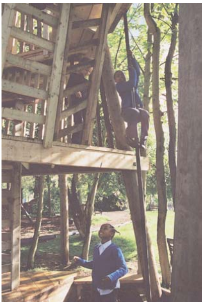
Learning new skills

Children wanting to use the adventure playground can just turn up - staff are on hand to help ensure their safety and prevent bullying.