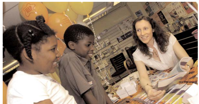
Information giving at the launch