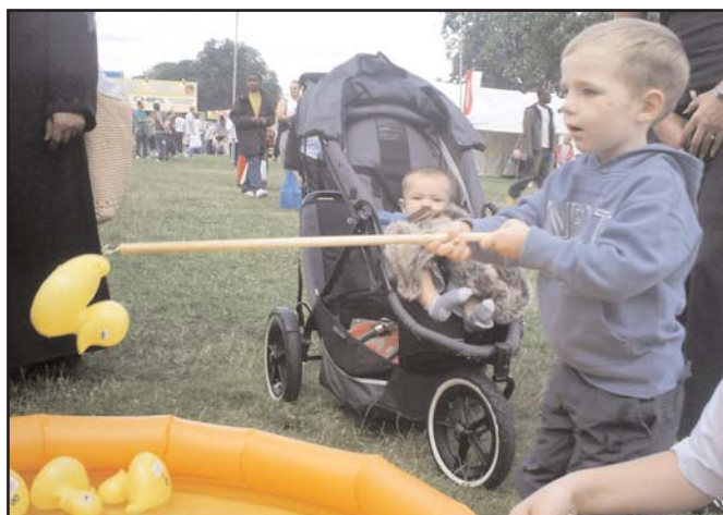
Children play Hook the Duck

For more information, contact the Communications Team on 020 7926 8613/8620