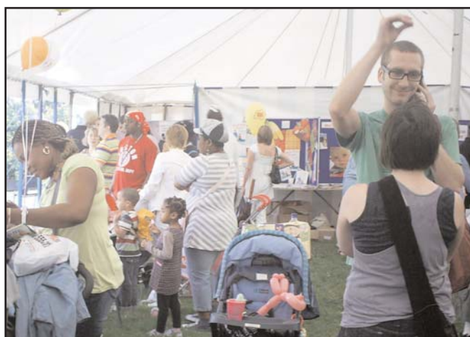
A busy tent at the Country Show