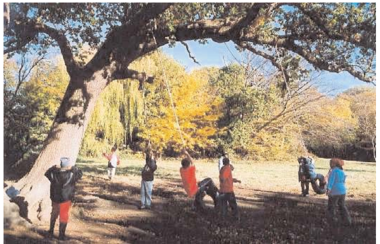
Enjoying outdoor play

Play is fundamental to how children develop their emotional, physical and intellectual potential. Play encourages children to explore, practice, build up skills, take risks, make mistakes and learn how to cooperate with other children.