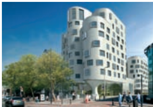
Artist's impression of the library building