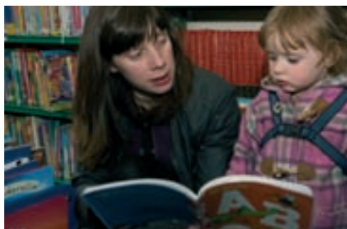
The new library will have a specially designed children's area

Mary Seacole House on Clapham High Street will be demolished and replaced by a breathtaking new multi-purpose civic building. Designed by architects Studio Egret West, the innovative and inclusive spiral building will provide the community with a library, customer centre, performance space and a healthcare centre. A new library on the high street will be easily accessible to the wider community, and will result in an estimated 150,000 extra visits a year.