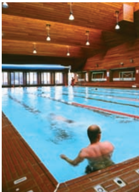
Swimming pool at Brixton Recreation Centre

In readiness for the closure of Clapham Leisure Centre, Lambeth Council is working closely with Greenwich Leisure Limited (GLL) to transfer as many classes and activity programmes as possible to alternative sites. This means many of the classes and activities you currently enjoy at Clapham Leisure Centre will be held at either Brixton Recreation Centre or Ferndale Sports Centre during the 17 month closure of facilities in Clapham. As soon as the details of the programme of alternative classes has been finalised it will be put on the website and displayed in the centre. To minimise disruption and to ensure activities are not interrupted halfway through the term time, schools swimming sessions and other group club activities have been moved to alternative facilities.