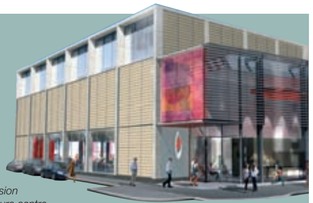
Artist's impression of the new leisure centre

“These plans represent an exciting opportunity to transform and redevelop Clapham, providing much needed state-of-the-art facilities and good quality housing. The delivery of these important 21st century public facilities is a priority and we have made sure that the changes made to this scheme do not have a negative impact on the public facilities.”