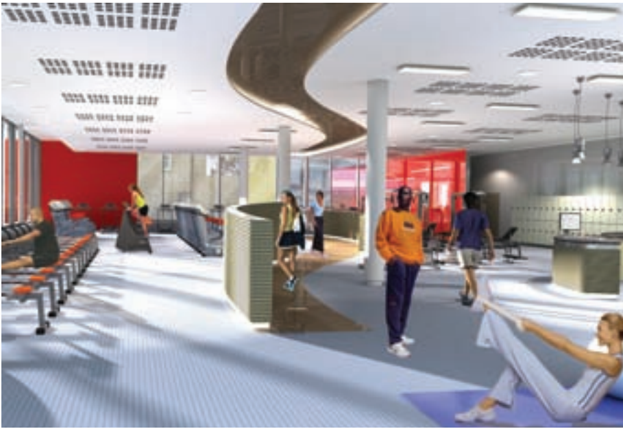
Artist's impression of the new gym