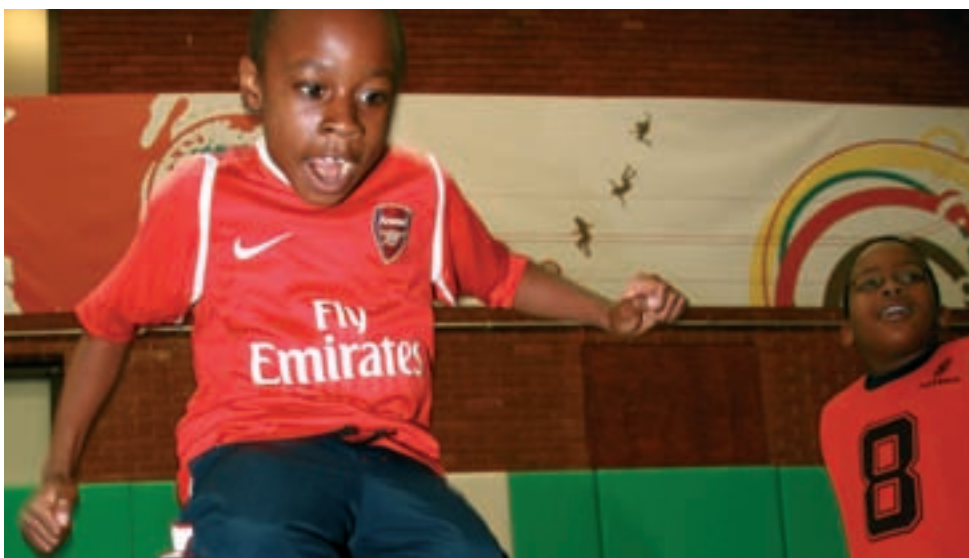
Energy zone at Brixton Recreation Centre with interactive games for children

For more information about Brixton Recreation Centre visit www.lambeth.gov.uk/brixtonrec