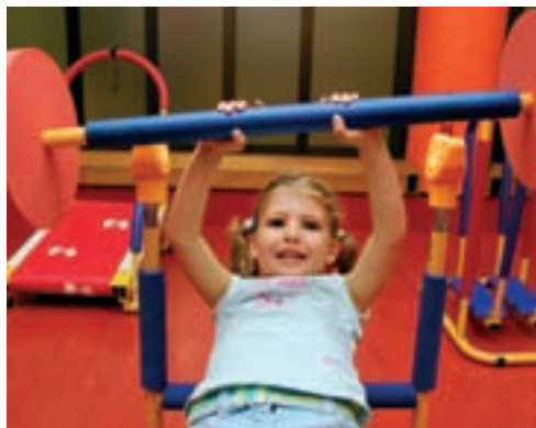
Free crèche in the Brixton Recreation Centre