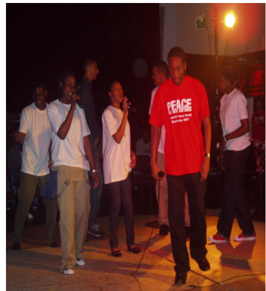
Young people from Pyramid Youth Theatre