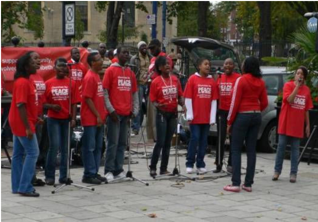
A group of young people sing to entertain the crowd