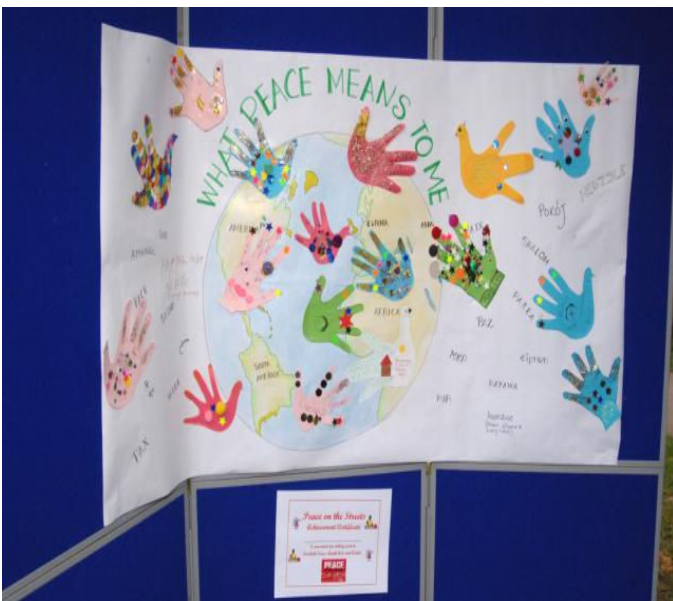
Out of the hands of babes in Lambeth! Children's art displayed at the Peace Month launch in Windrush Square