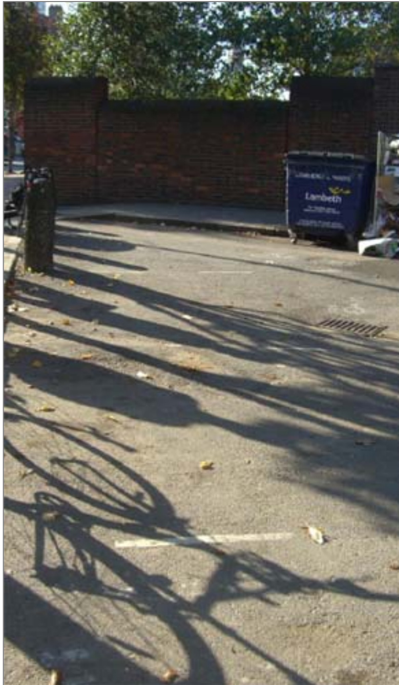
8. Lower Marsh Car Park