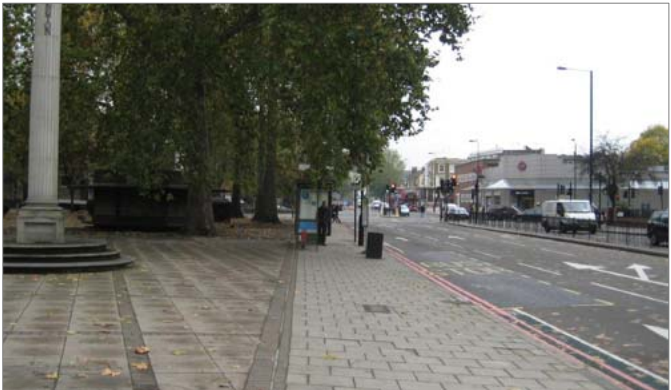
20. Kennington Park Road