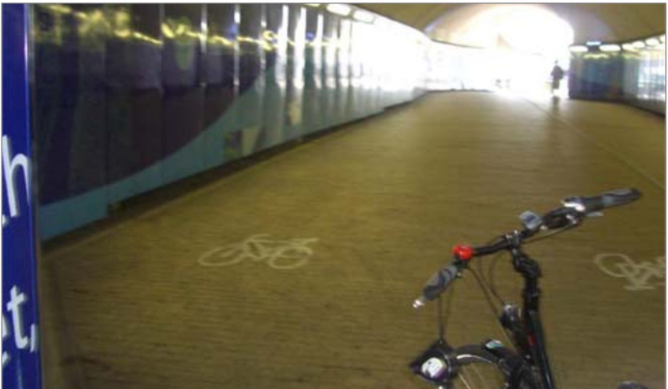
17. Kennington Lane (subway by Vauxhall Station)