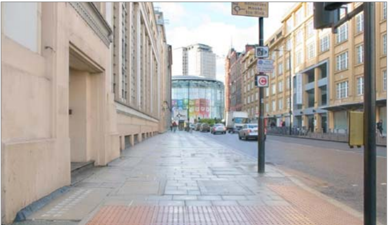
47. Stamford Street