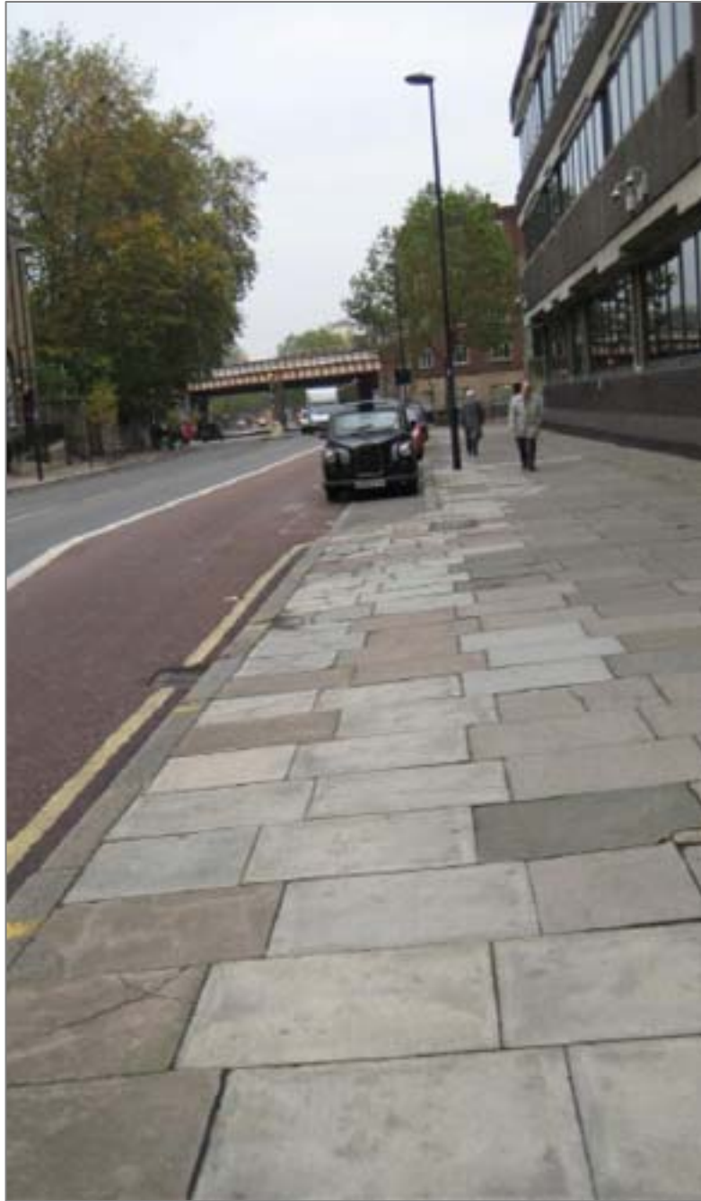
56. Lambeth Road Police HQ