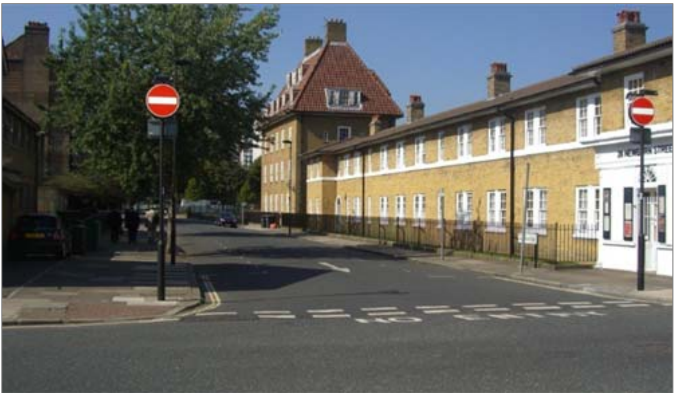
24. Sancroft Street at junction with Newburn Street