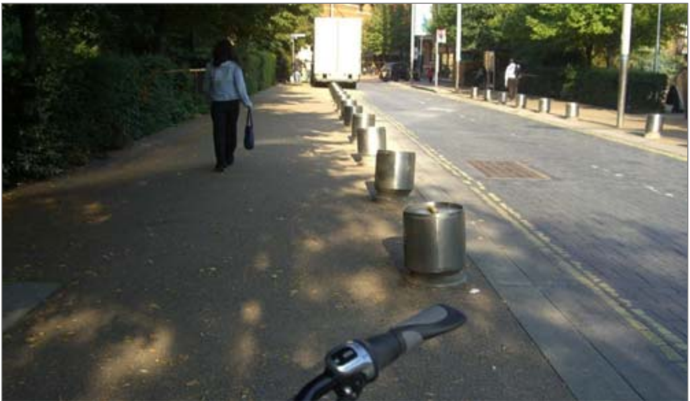
45. Gabriel's Wharf