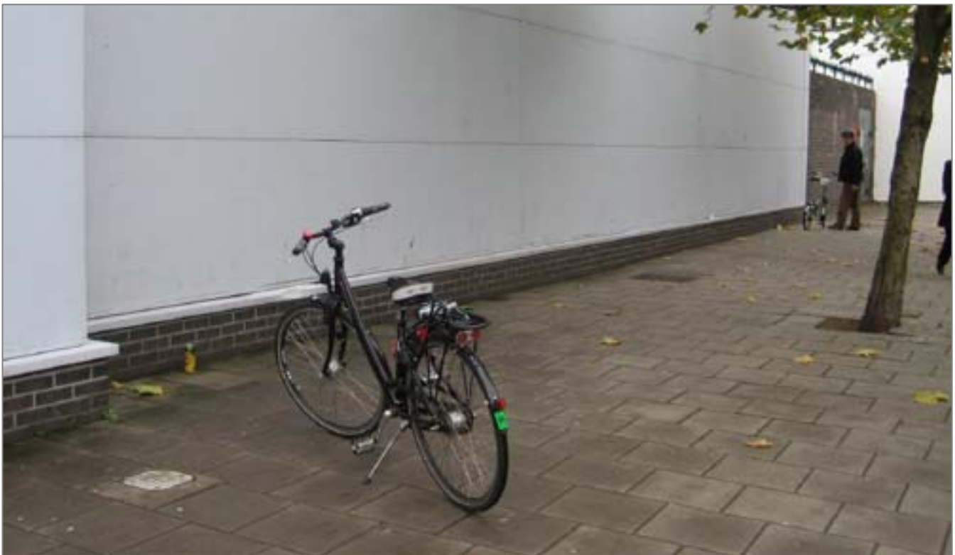
37. Kennington Lane Tesco