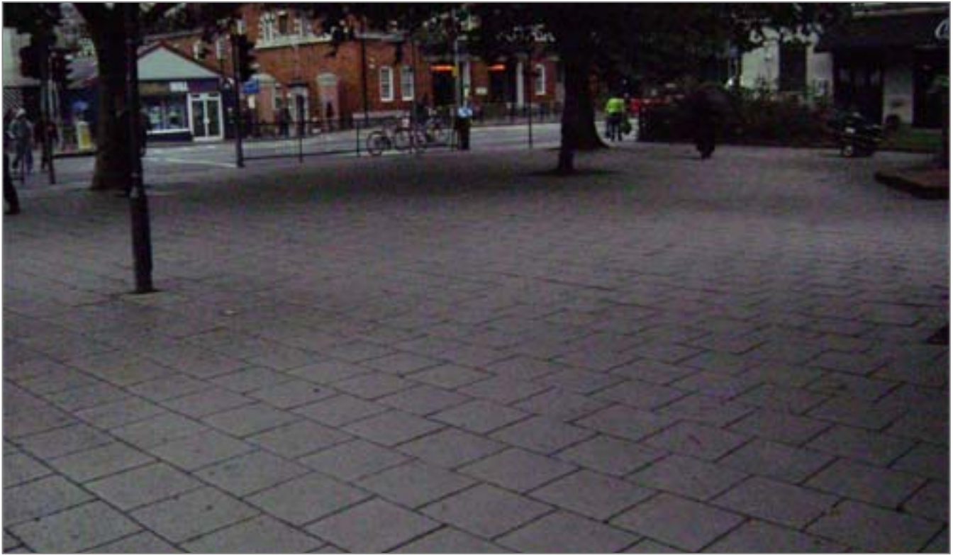
10. Emma Cons Square