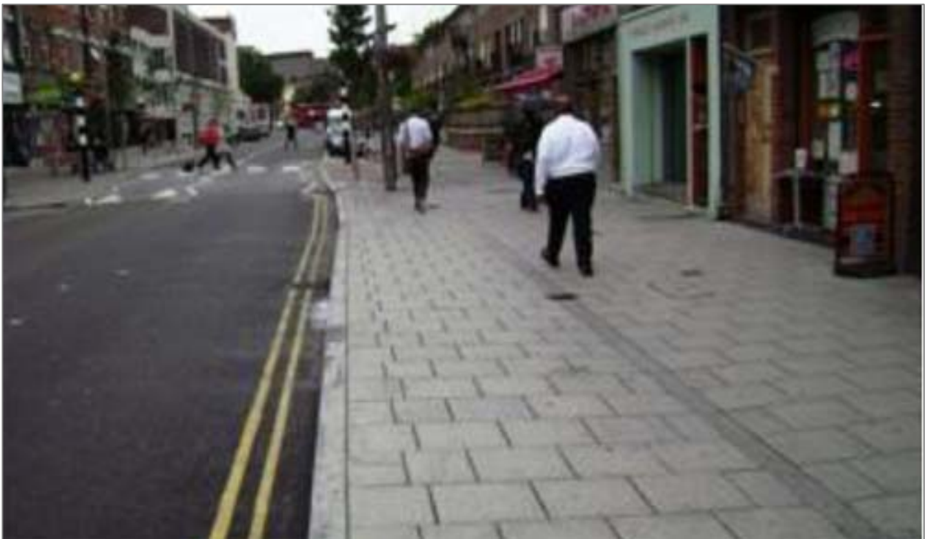
7. The Cut (Young Vic)