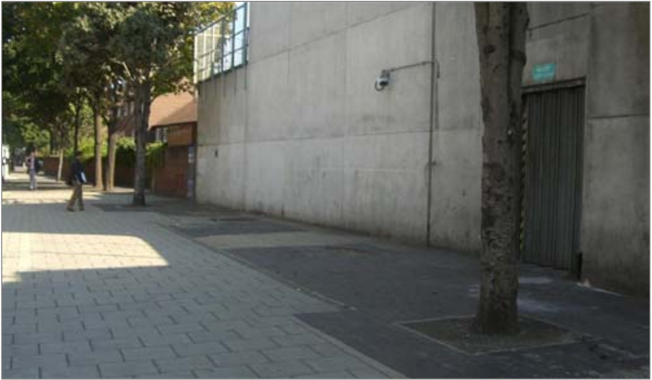
29. Lambeth North tube