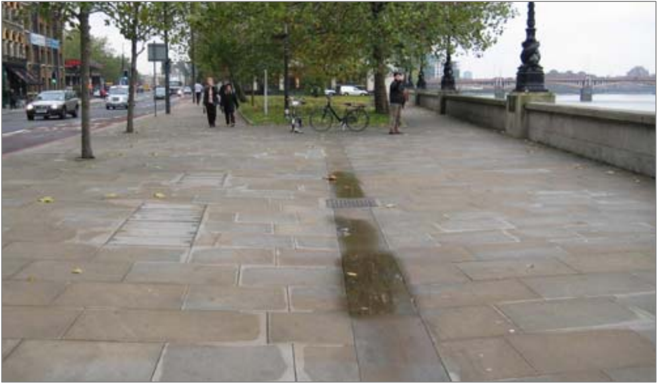
50. Albert Embankment