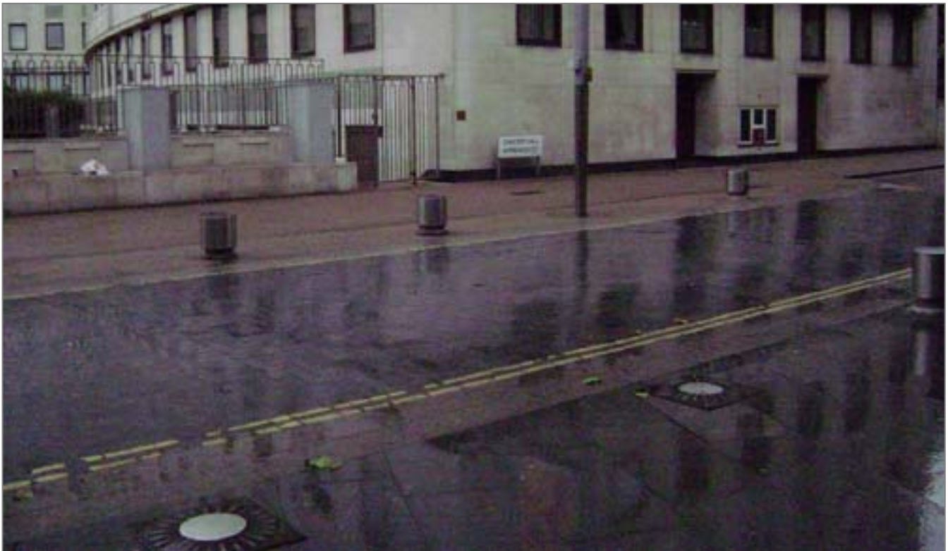
5. Concert Hall Approach