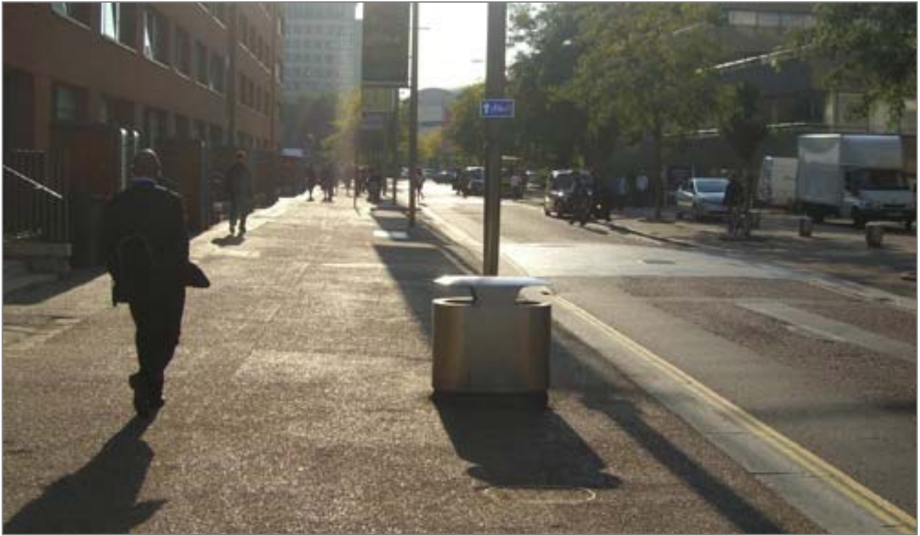
46. Upper Ground