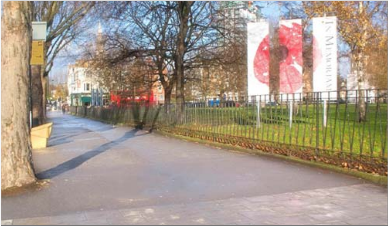
31. Kennington Road by Imperial War Musuem park