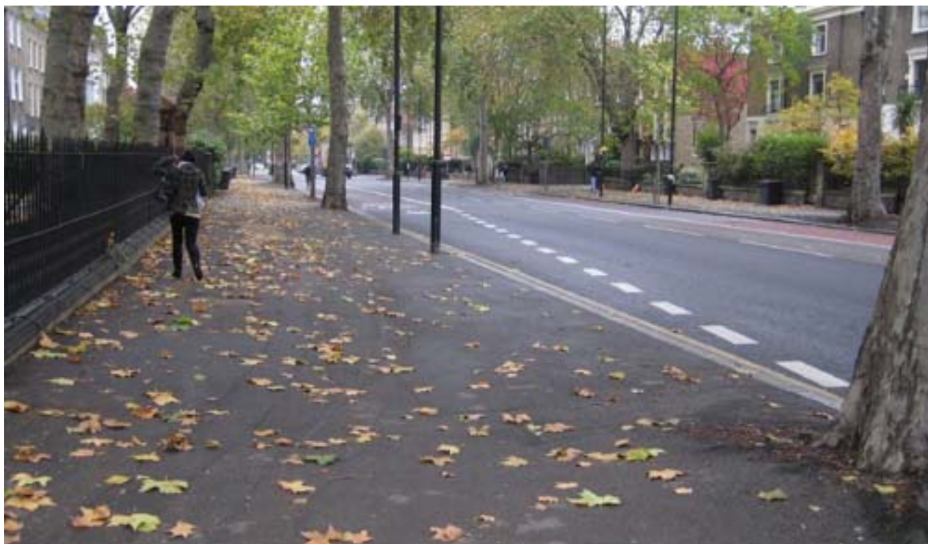
25. Kennington Road after junction with Walnut Tree Walk