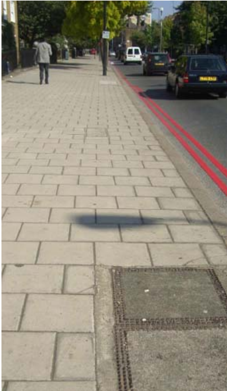
35. Kennington Lane opposite Durning Library