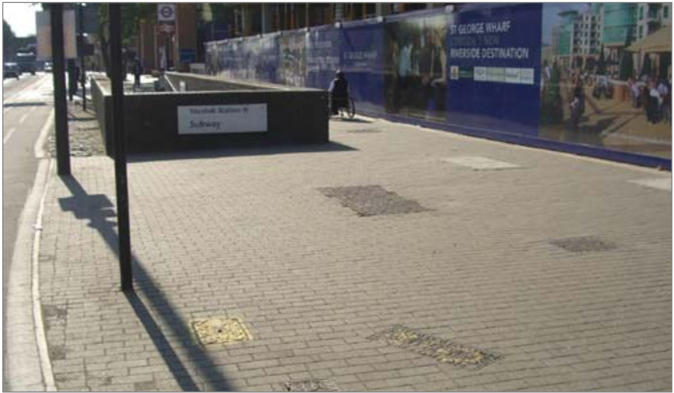
19. Wandsworth Road (by Vauxhall Station subway)