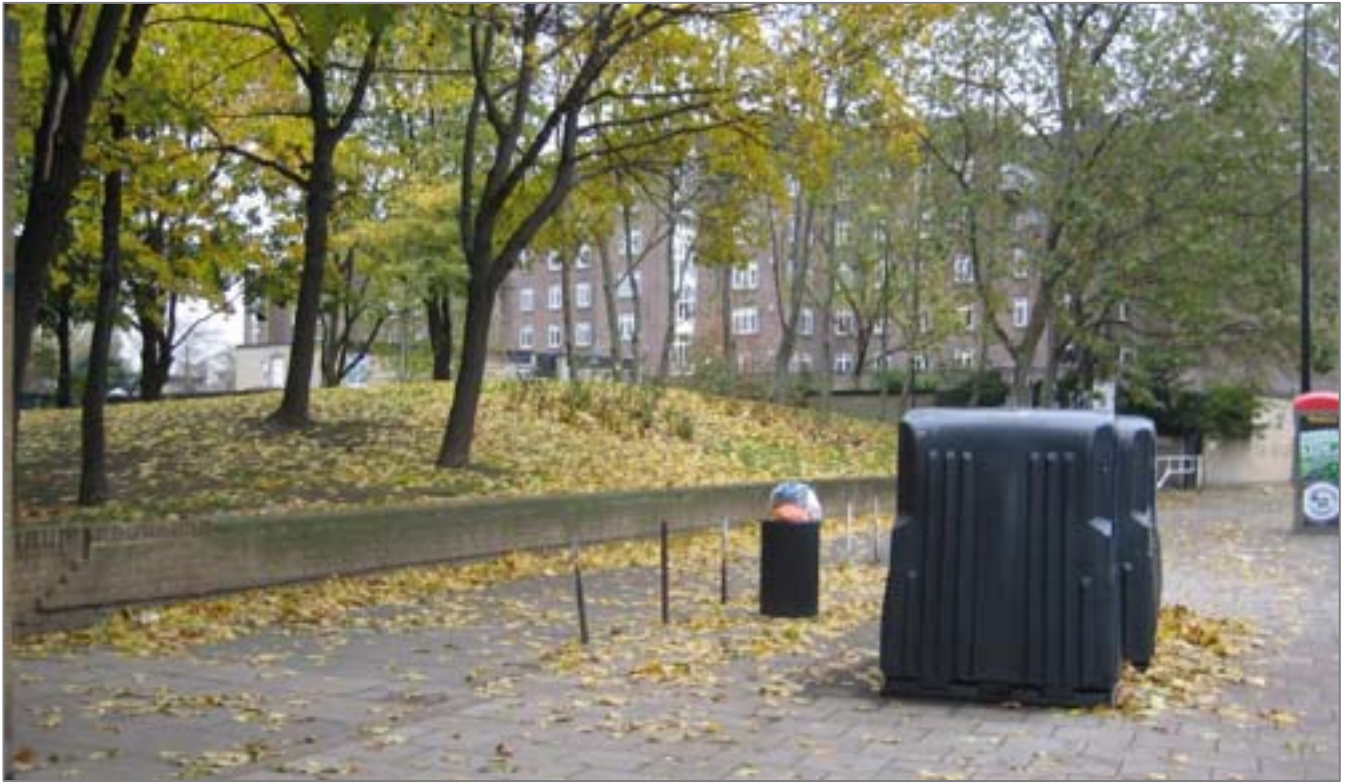
54. Kennington Lane Cotton Garden