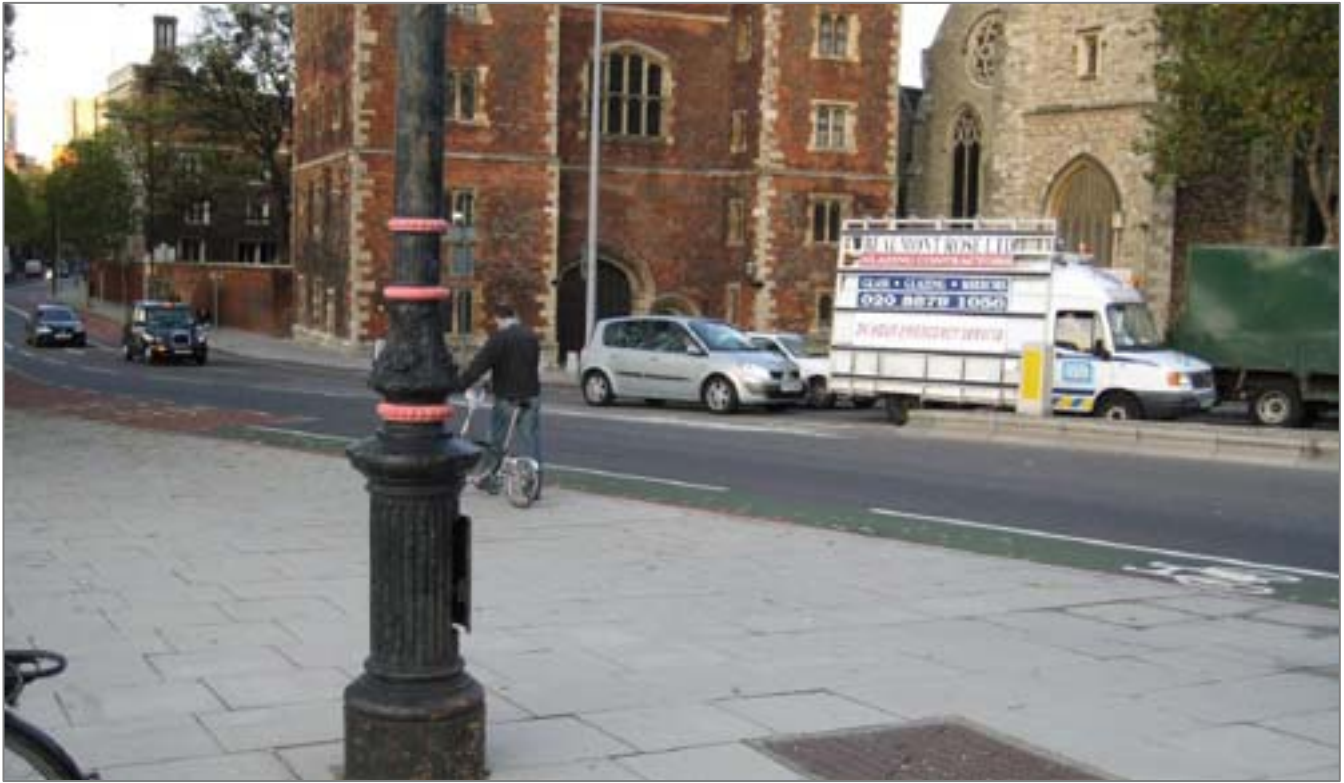
42. Lambeth Bridge