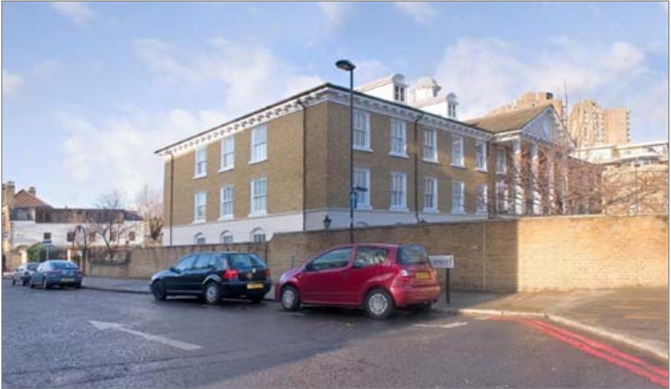
23. Sancroft Street at junction with Kennington Road