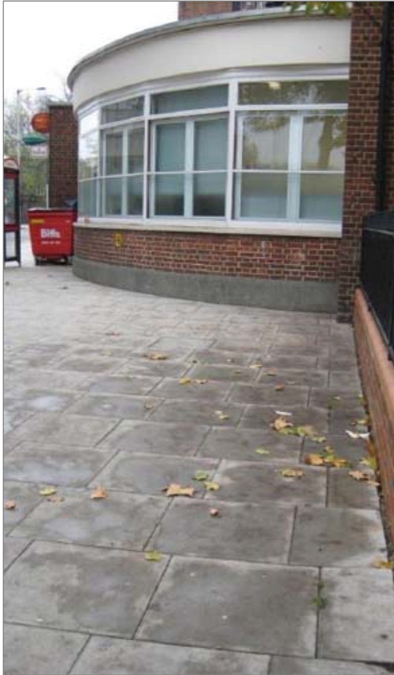
21. Kennington Road Post Office