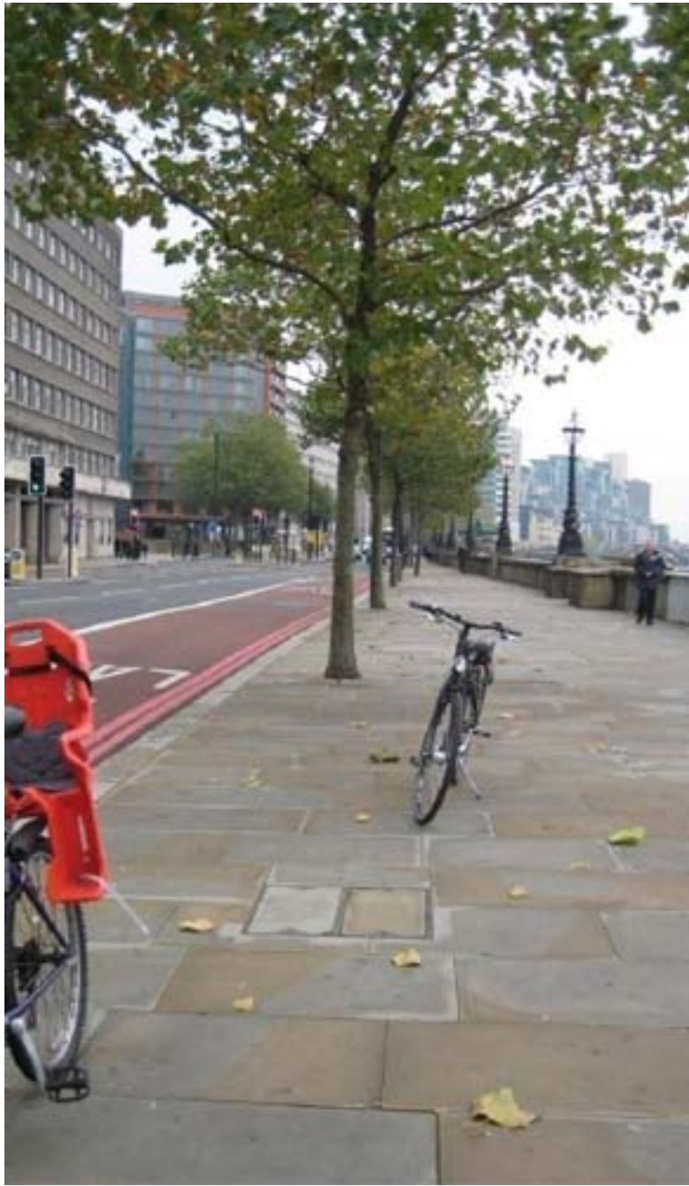
49. Fire Brigade Pier (Albert Embankment)