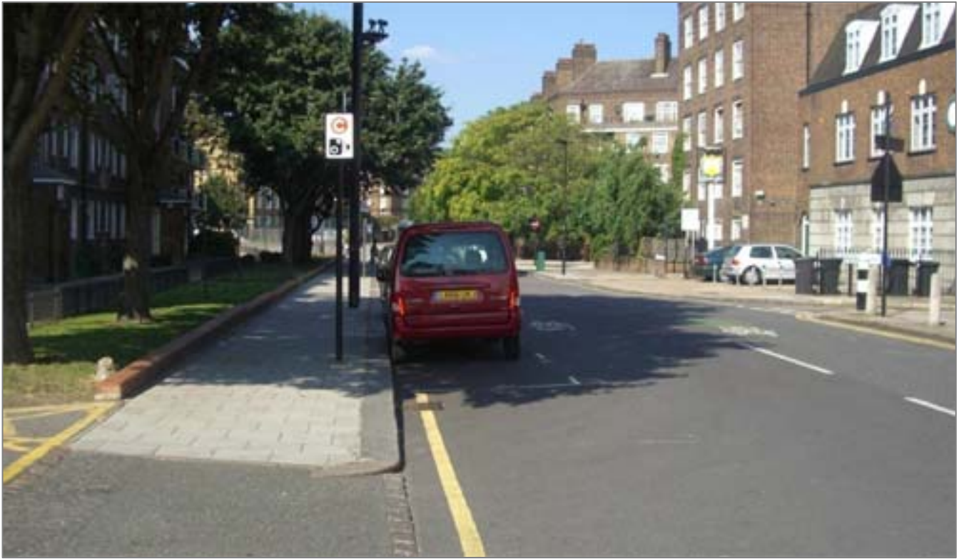
36. Vauxhall Street