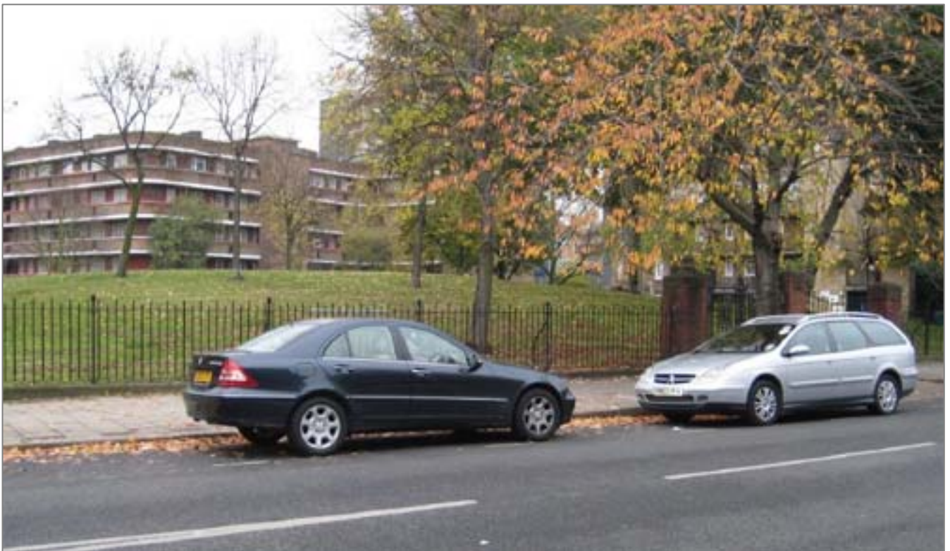
41. Black Prince Road