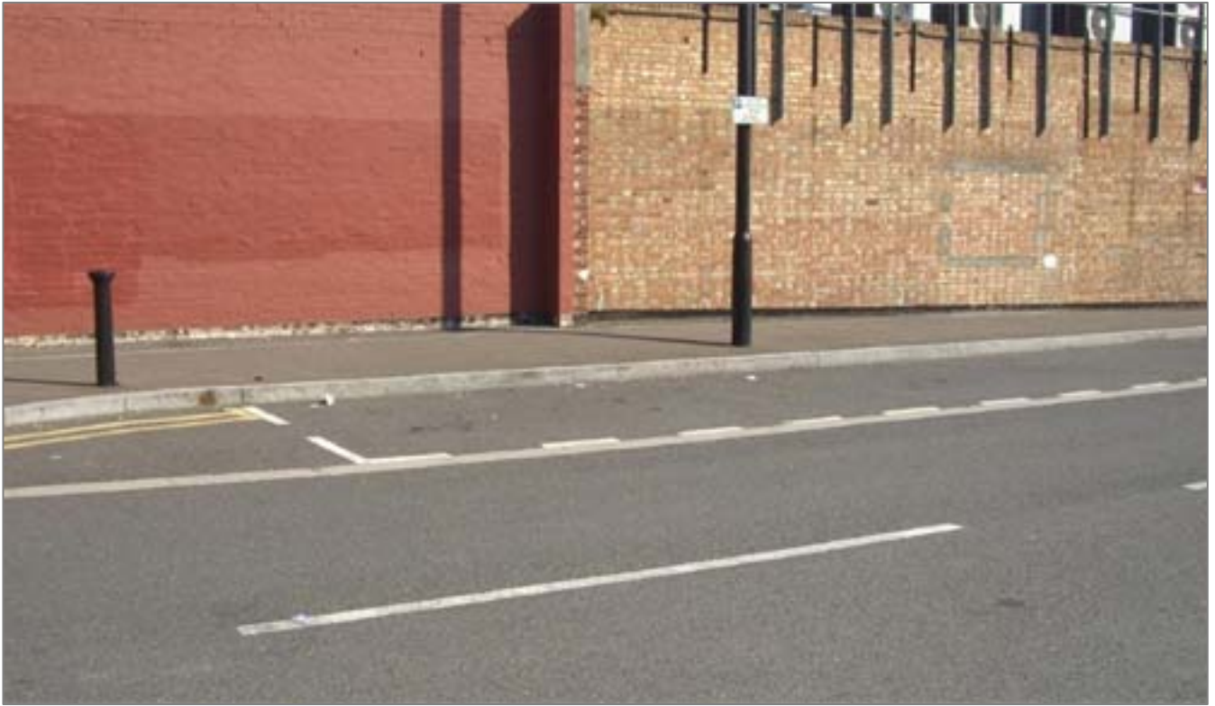
38. Oval Way