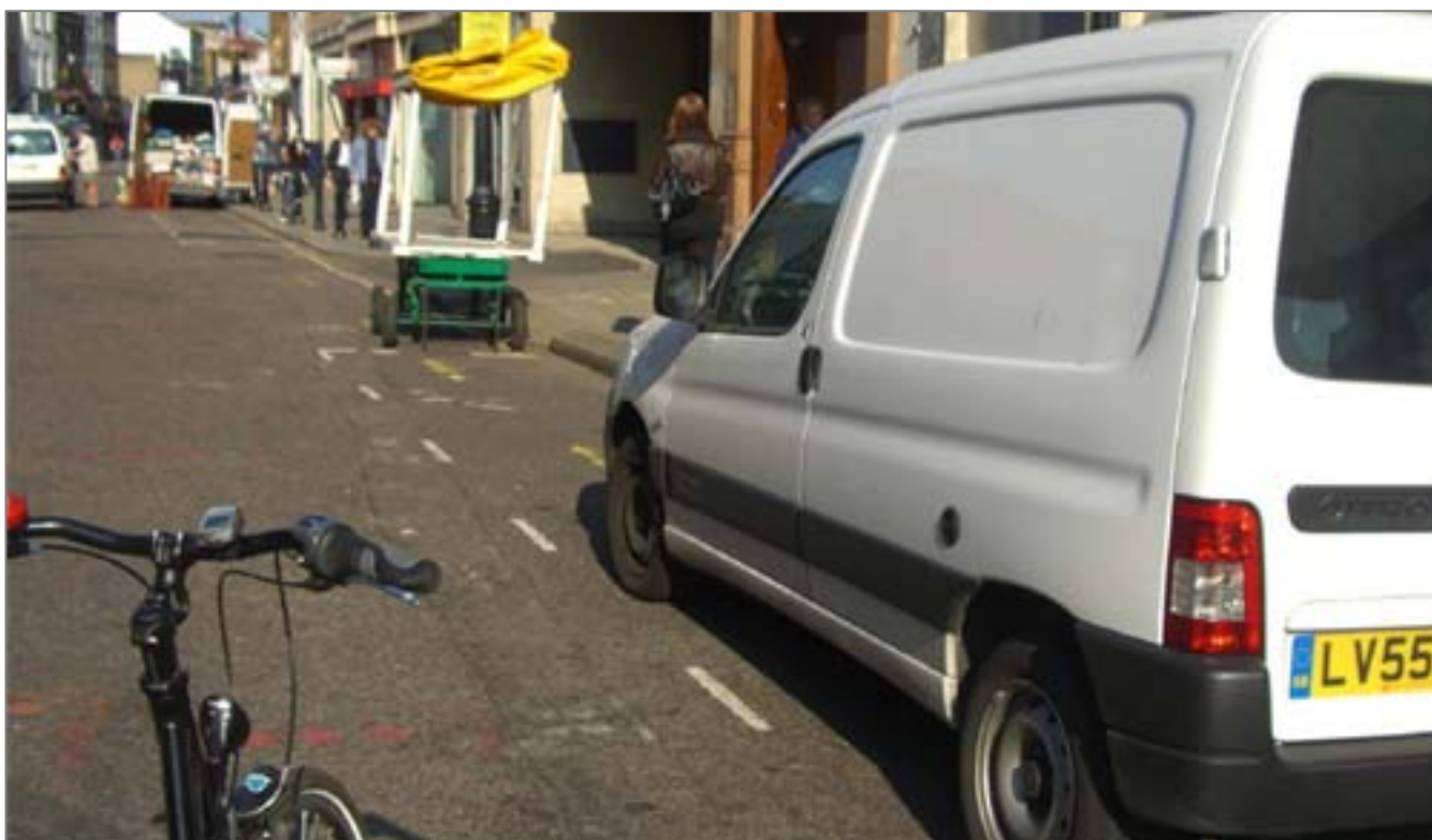
28. Lower Marsh Market