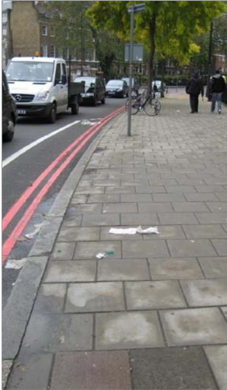
51. Kennington Lane at junction with Cardigan Street