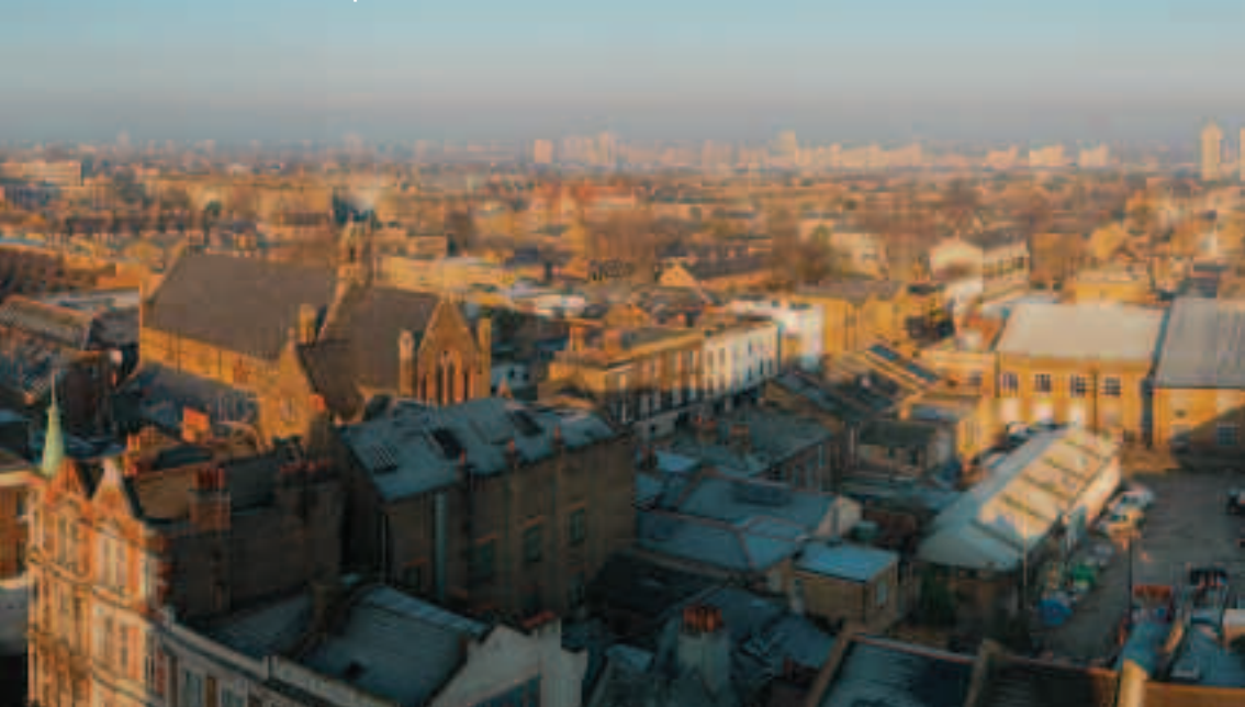
The view from Mary Seacole House, including Clapham Leisure Centre and depot

Better computing and internet facilities will further improve access to information and provide the opportunity for library users to access music and audio online.