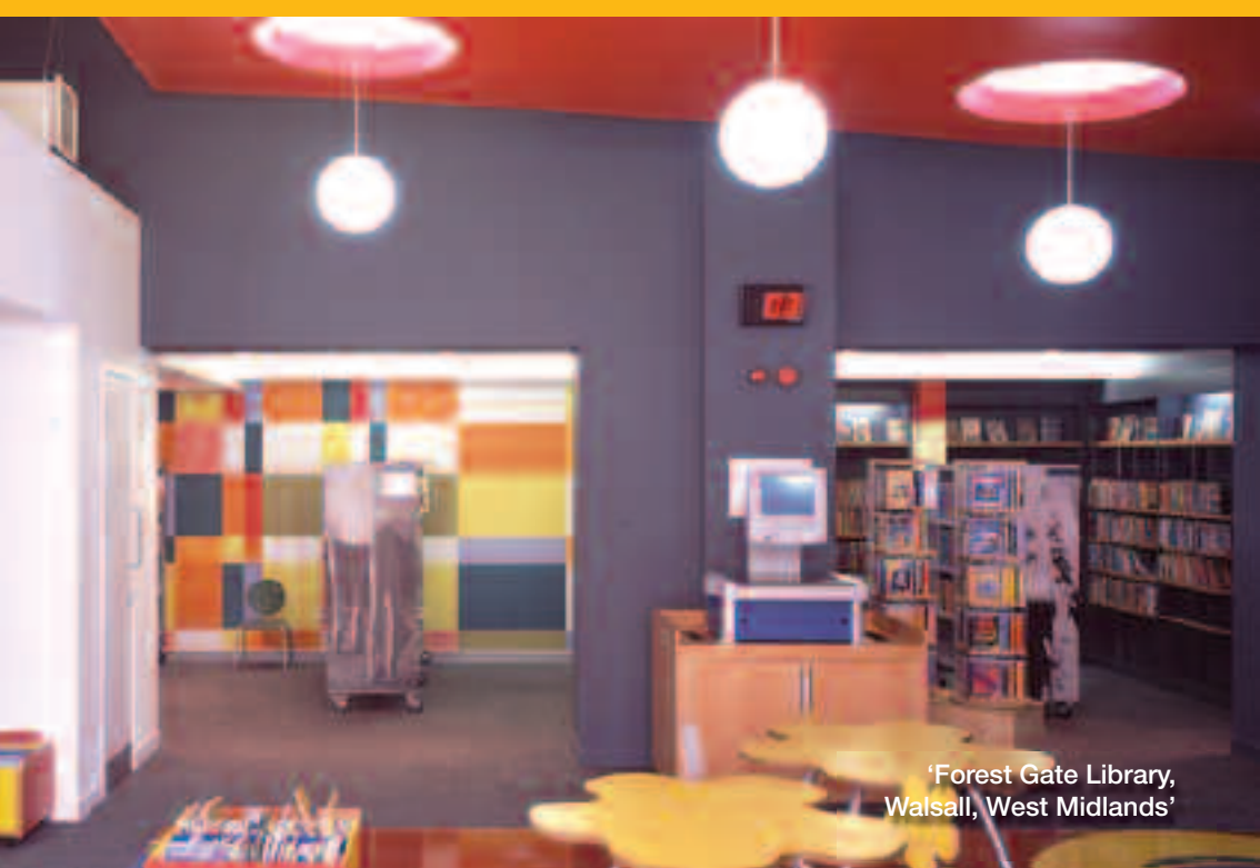
'Forest Gate Library, Walsall, West Midlands'