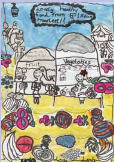
3rd place, winning 10 swimming vouchers Lenia, Age 7, Wyvil Primary School