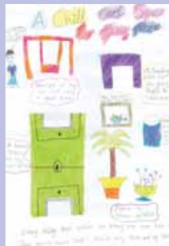
4th place, winning 10 swimming vouchers Zoe, Reay Primary School