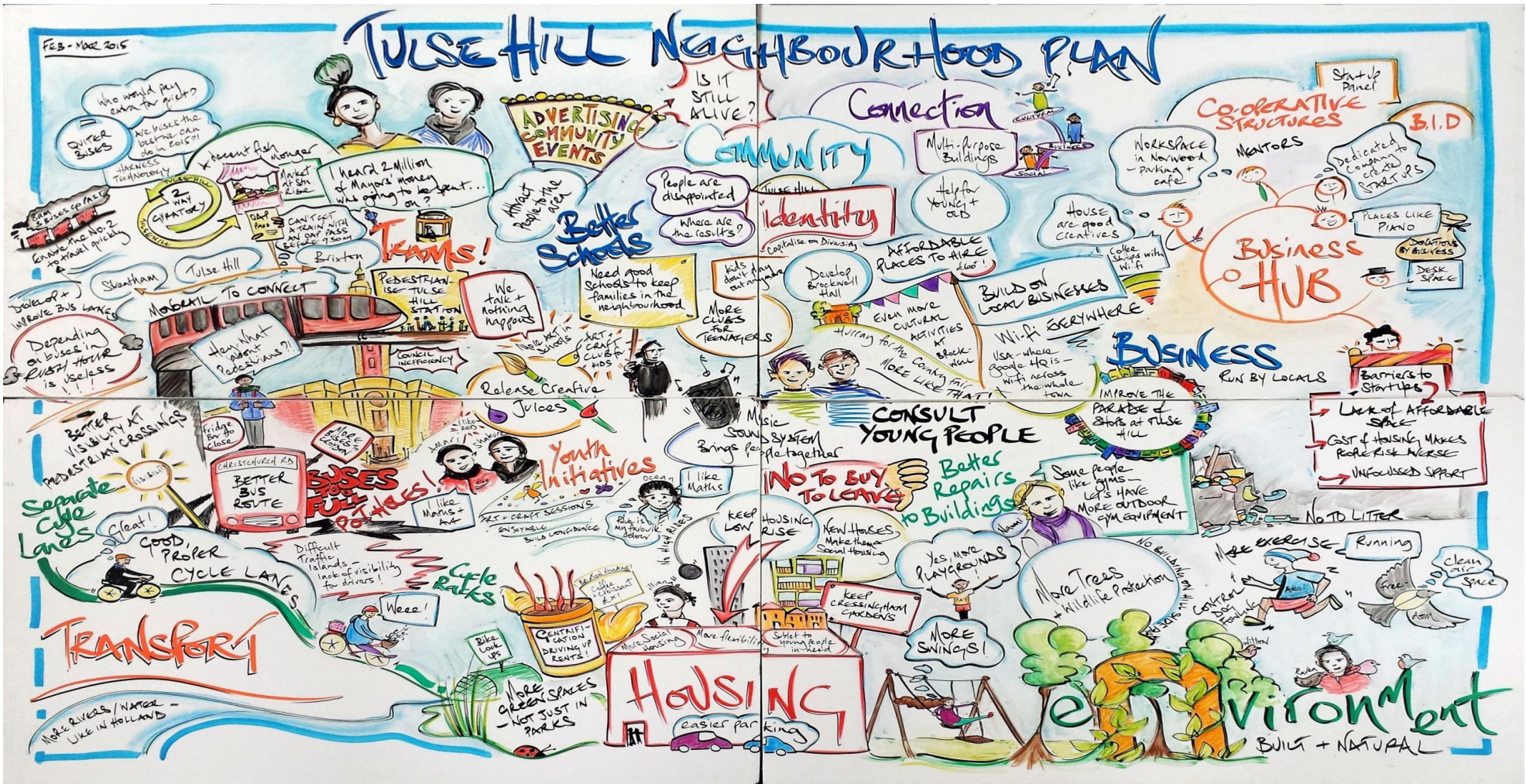
Tulse Hill Neighbourhood Area and Forum Applications October 2015