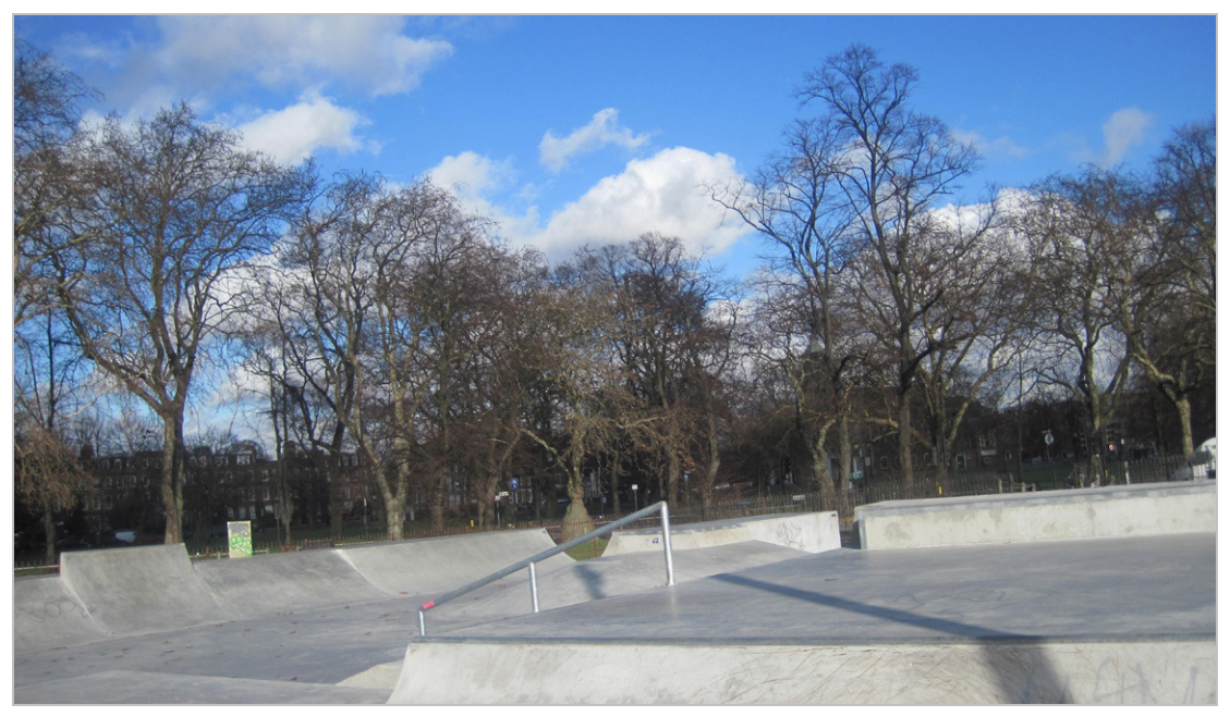
Clapham Common Skate Park. This scheme received £72k part funding from the Social Facility payment at Tesco Clapham Common in addition to £96k funding from other sources. Completed at the end of 2011/12, the skate park is now suitable for mixed abilities of all roller sports.