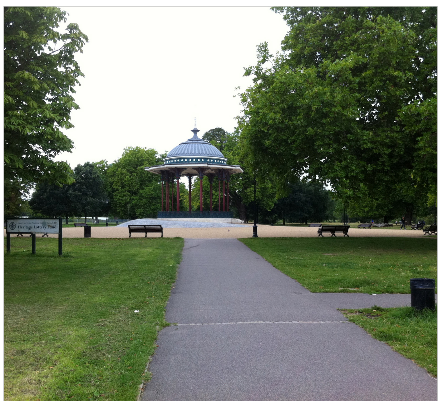
Clapham Common Bandstand. With £33k part-funding from the S106 agreement for Tesco Clapham, landscape restoration works at the bandstand in Clapham Common were completed in 2011/12. The bandstand is considered the oldest and largest surviving bandstand in the country. Works ensured the berm around the bandstand is now sufficiently robust to withstand frequent usage by the public, at the same time making it visually attractive and something that can be enjoyed throughout the year.