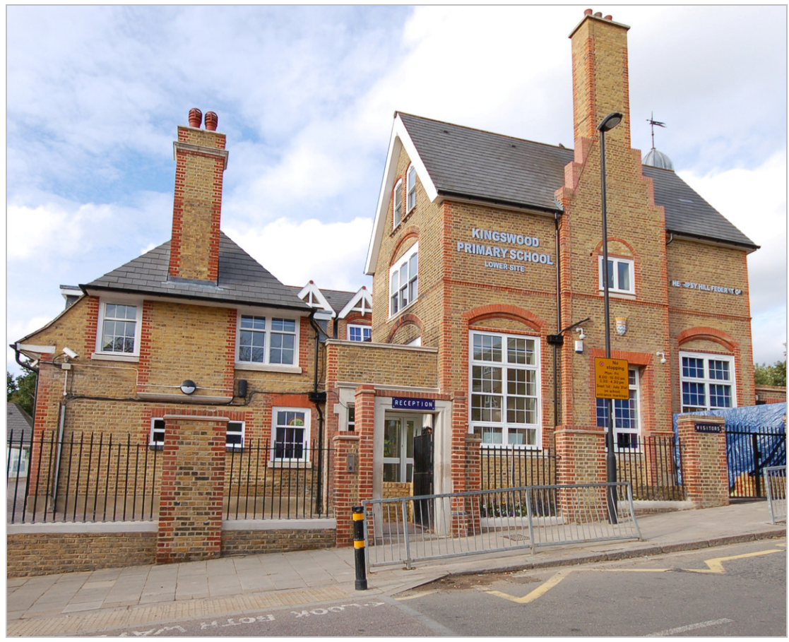
Kingswood Early Years. Over 40 per cent of S106 spend in 2011/12 was for the Council's school expansion programme. S106 agreements from two developments in the Norwood area contributed nearly £200k in part funding to refurbish Kingswood Primary School and enable expansion from two forms of entry to four forms of entry. The scheme cost £4m in total.