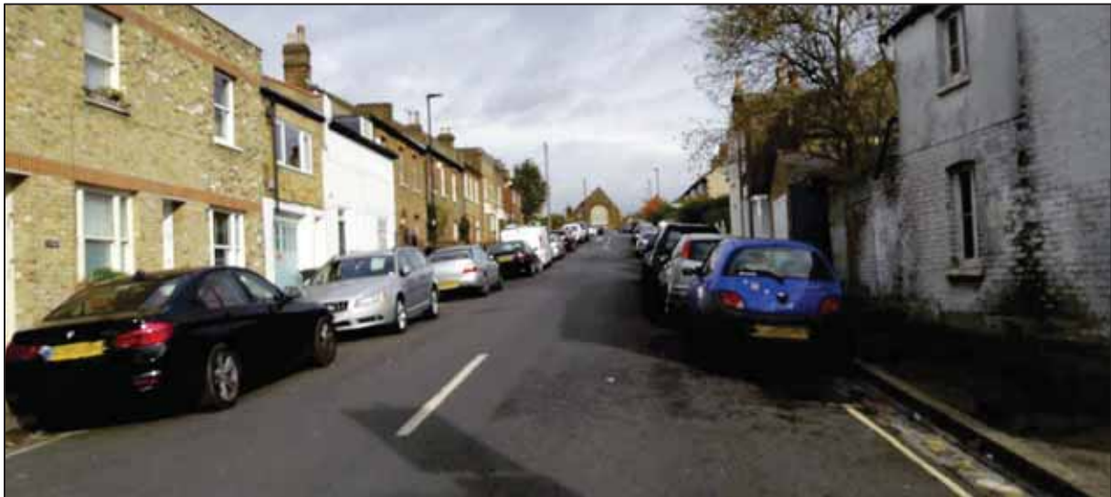
Figure 15. Farm Avenue

Farm Avenue is a two way through road approximately 175 metres in length. The road is a residential road consisting of a mixture of semi-detached and terraced housing, however it must be noted that at the northern end of the road there is a church and near the southern end of the road is the Leigham Arms pub.