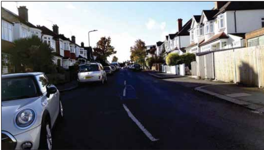
Figure 53. Rosedene Avenue

Rosedene Avenue is a two way through road, approximately 310 metres in length. Land use nearby is mainly residential consisting of semi-detached housing, however Dunraven School is at the south western end of Rosedene Avenue.