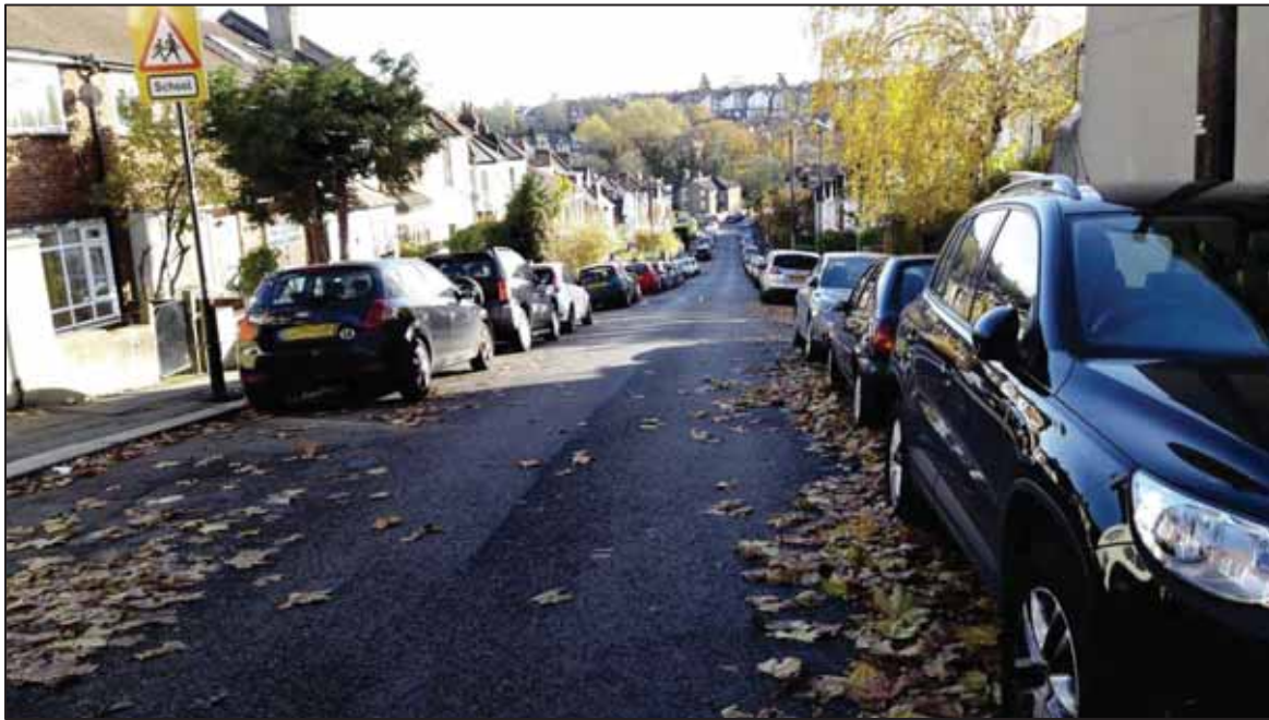
Figure 24. Hitherfield Road

Hitherfield Road is a two way through road approximately 240 metres in length. The road is a residential road consisting of a mixture of residential units; Hitherfield Road has terraced housing on the western side and semi-detached housing on the eastern side. Pedestrian access to Hitherfield Primary School is available in a central section of Hitherfield Road, next to Hitherfield Road Baptist Church.