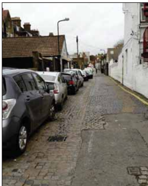
Figure 18. Gleneldon Mews

Gleneldon Mews is a two way through road, it is approximately 205 metres in length. The road is a narrow road in an area of mixed land use, examples of land use in the area include residential units and car garages. Staff access to some of the retail units on Streatham High Road is available via Gleneldon Mews.