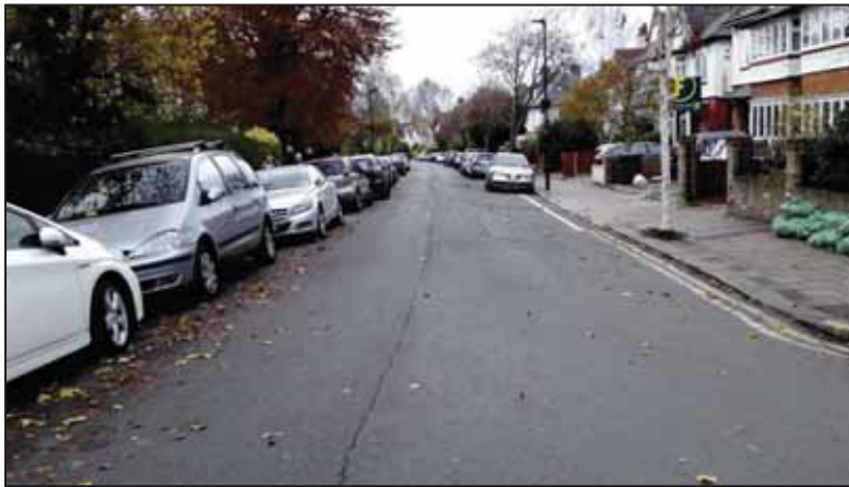
Figure 51. Prentis Road

Prentis Road is approximately 380 metres in length. It is a two way road from the junction with Garrad's Road to the junction with Ockley Road, however from here it becomes a one way eastbound road towards Streatham High Road. Land use nearby is mainly residential, however retail units, a Royal Mail Delivery Office, a Medical Centre and a Synagogue are present at the eastern end surrounding the junction with Streatham High Road. Tooting Bec Common is also at the western end of Prentis Road.