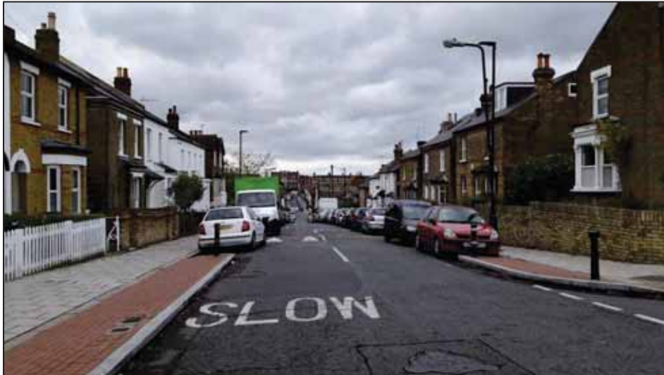
Figure 59. Sunnyhill Road

Sunnyhill Road is a two way through road approximately 710 metres in length. Land use nearby is predominantly residential, however lots of retail units services are present at the western end of Sunnyhill Road surrounding the junction with Streatham High Road.