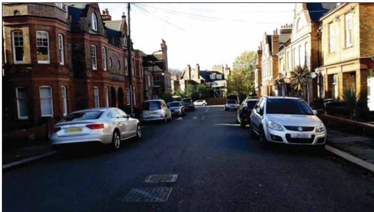
Figure 36. Lyndhurst Avenue

Lyndhurst Avenue is a two way through road. The section of Lyndhurst Avenue in the survey area is approximately 125 metres in length. The road is a residential road consisting of mainly terraced housing.