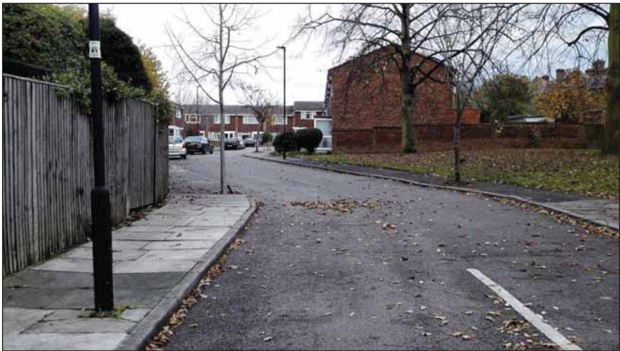
Figure 60. Tarrington Close

Tarrington Close is a two way road leading to a cul-de-sac, approximately 90 metres in length. Land use in the area is predominantly residential, consisting of terraced housing.