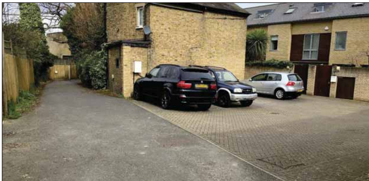
Figure 13. Drewstead Lane

Drewstead Lane is a two way dead end road approximately 49 metres in length. The road is a residential road consisting of terraced housing with parking on both sides of the street.