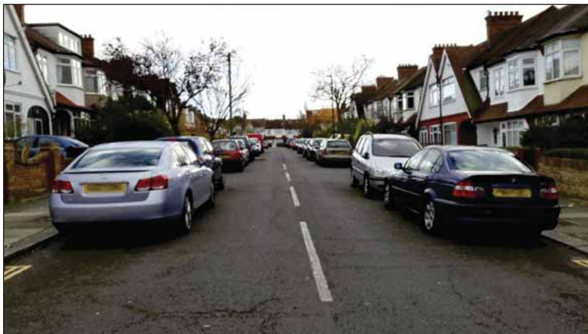
Figure 27. Ivyday Grove

Iveday Grove is a two way through road approximately 134 metres in length. The road is a predominantly residential road with parking on both sides of the street.