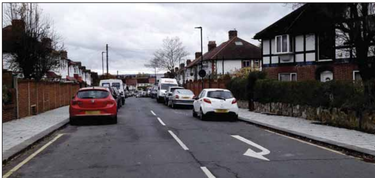
Figure 10. Conifer Gardens

Conifer Gardens is a two way through road approximately 255 metres in length. The road is a residential road consisting of semi-detached housing.