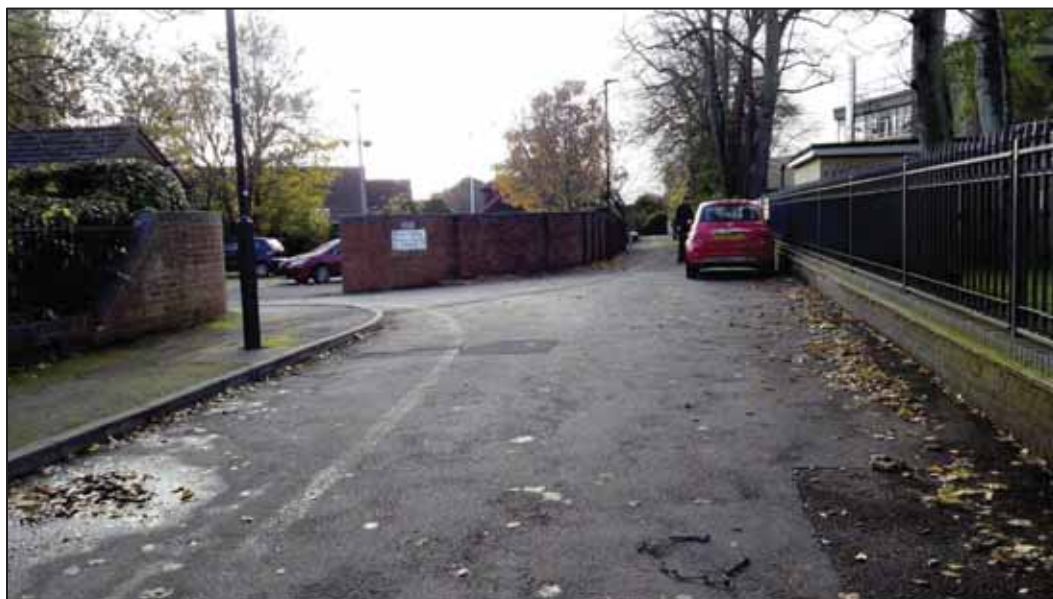
Figure 35. Leithcote Path

Leithcote Path is a narrow two way road leading to a dead end for vehicles, it is approximately 90 metres in length. Pedestrian access is available from Leithcote Path through to Leithcote Gardens. Land use on Leithcote Path is residential to the east and Dunraven School is to the west.