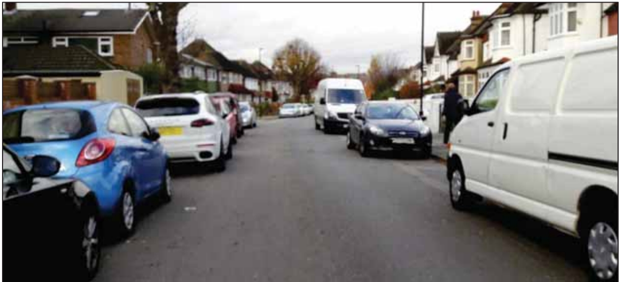
Figure 12. De Montfort Road

De Montfort Road is a two way through road approximately 280 metres in length, however the survey area includes the side road leading to a cul-de-sac which is approximately an extra 70 metres of road being surveyed. The road is a residential road consisting of mainly semi-detached houses