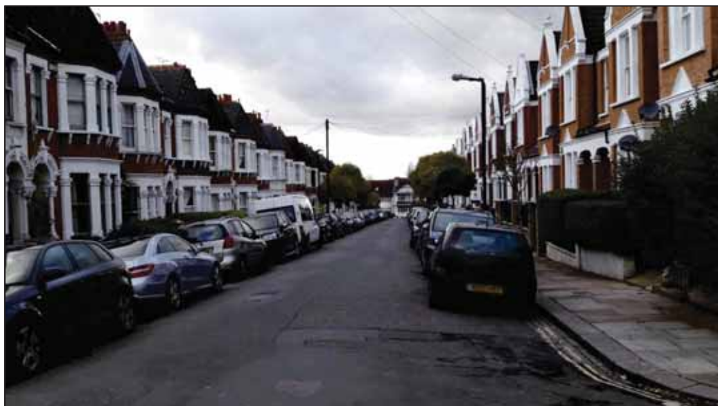
Figure 45. Norfolk House Road

Norfolk House Road is a two way through road approximately 340 metres in length. Land use nearby is predominantly residential properties in the form of terraced housing, however retail units are present at the eastern end of Norfolk House Road surrounding the junction with Streatham High Road.