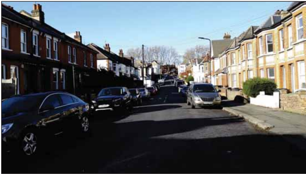
Figure 58. Stockfield Road

Stockfield Road is a two way through road approximately 225 metres in length. The road is a residential road consisting of mainly semi-detached housing.