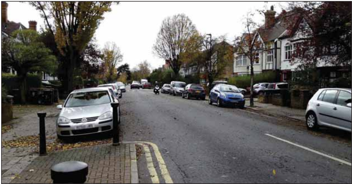
Figure 5. Becmead Avenue

Becmead Avenue is a two way through road approximately 440 metres in length. Land use nearby is mainly residential, however retail units are at the eastern end surrounding the junction with Streatham High Road and Tooting Bec Common is at the western end of the road.