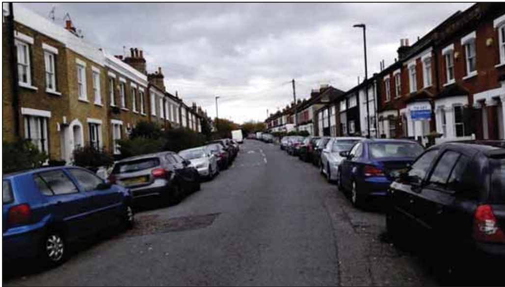
Figure 63. Wellfield Road

Wellfield Road is a two way through road approximately 605 metres in length. Land use nearby is predominantly residential consisting of mainly terraced and semi-detached housing, however a church and a pub are near the junction with Sunnyhill Road. In addition Streatham Central Church is also on a central section of Wellfield Road.