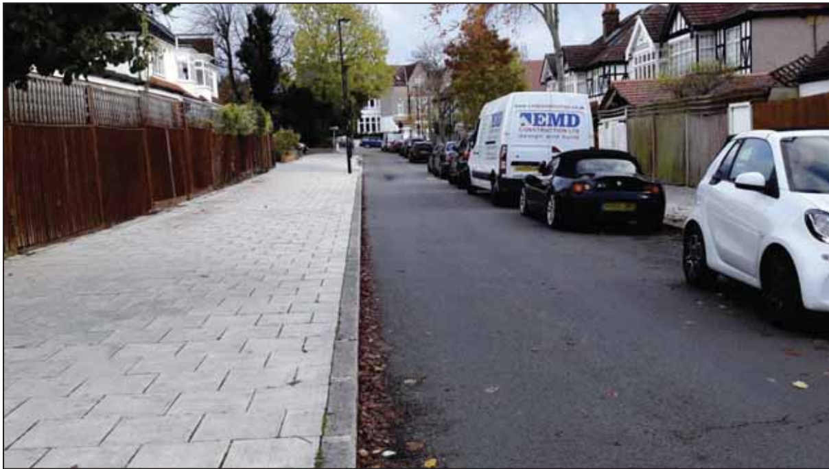
Figure 66. Woodfield Grove

Woodfield Grove is a one way eastbound road, approximately 105 metres in length. Land use in the area is predominantly residential, consisting of semi-detached housing.