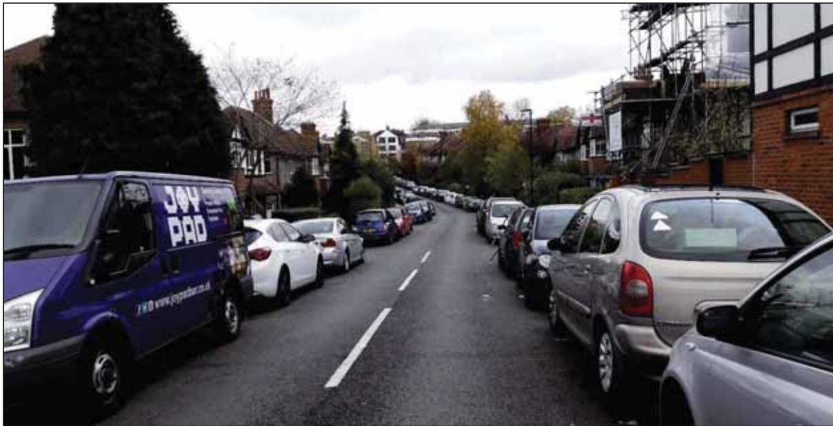
Figure 67. Woodleigh Gardens

Woodleigh Gardens is a two way through road approximately 230 metres in length. The road is a residential road consisting of semi-detached housing.