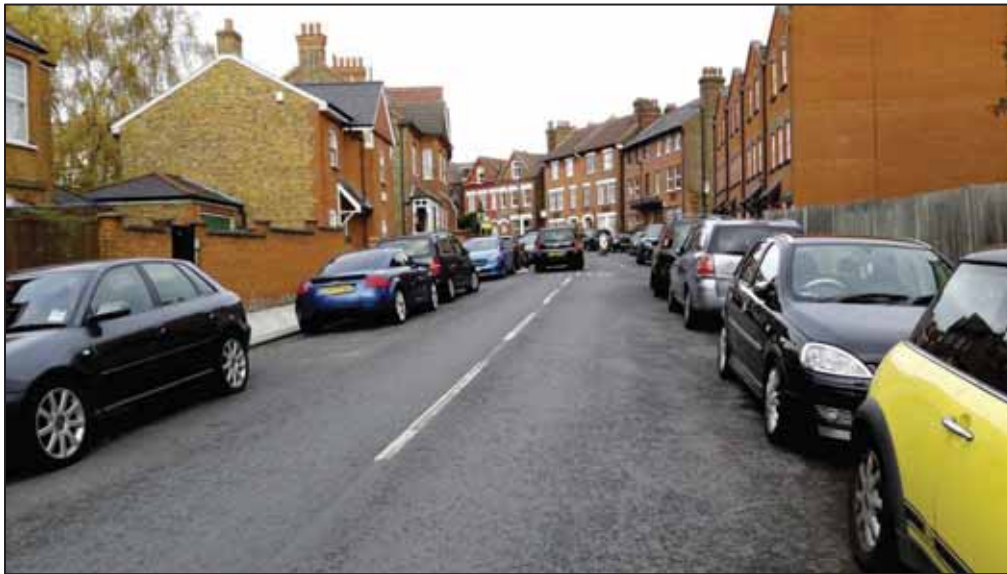
Figure 55. Shrubbery Road

Shrubbery Road is a two way through road approximately 220 metres in length. Land use nearby is mainly residential, however retail units are at the western end surrounding the junction with Streatham High Road.