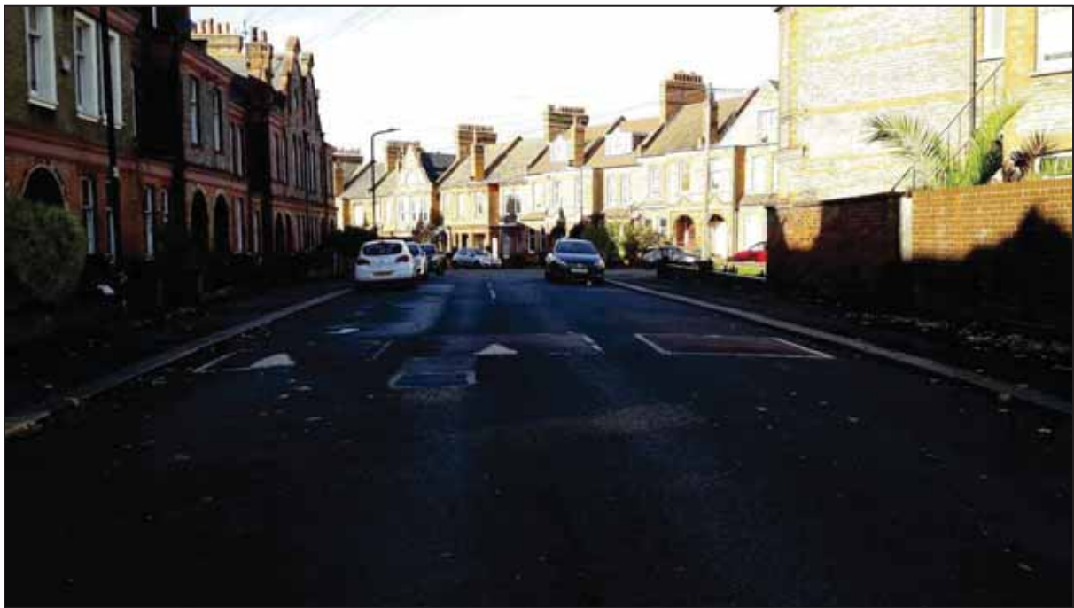
Figure 28. Keymer Road

Keymer Road is a two way through road approximately 105 metres in length. The road is a residential road consisting of a mixture of residential units.