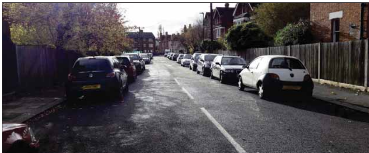
Figure 21. Grasmere Road

Grasmere Road is a two way through road approximately 140 metres in length. The road is a residential road consisting of a mixture of residential units.