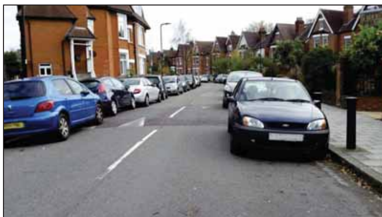
Figure 50. Polworth Road

Polworth Road is approximately 465 metres in length, it is mostly a two way road apart from the one way westbound section between the junction with Rutford Road and the junction with Hopton Road. Land use nearby is mainly residential, consisting of semi-detached houses and blocks of flats such as the Albert Carr Gardens estate, however St. Andrew's Catholic Primary School is near the junction with Rutford Road and the Whittington Centre NHS Healthcare Centre is also on this junction.