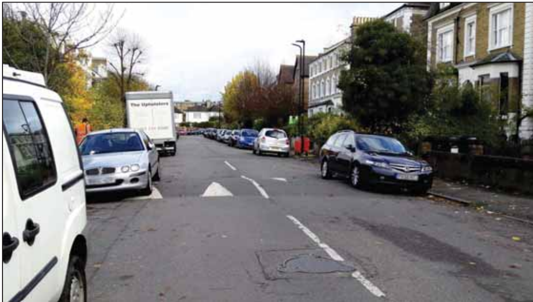
Figure 41. Mount Ephraim Road

Mount Ephraim Road is a two way through road approximately 415 metres in length. Land use nearby is mixed, with mainly residential properties at the western end, and retail units at the eastern end surrounding the junction with Streatham High Road.