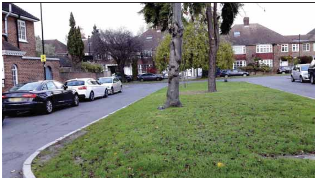
Figure 39. Mortimere Close

Mortimere Close is a two way road leading into a cul-de-sac approximately 120 metres in length. The road is a residential road consisting of terraced and semi-detached housing.