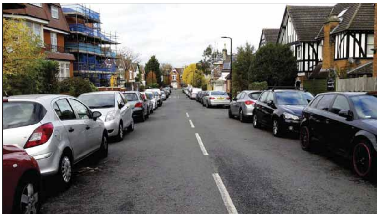
Figure 16. Farnan Road

Farnan Road is a two way through road approximately 135 metres in length. The road is a residential road consisting of a mixture of residential units.