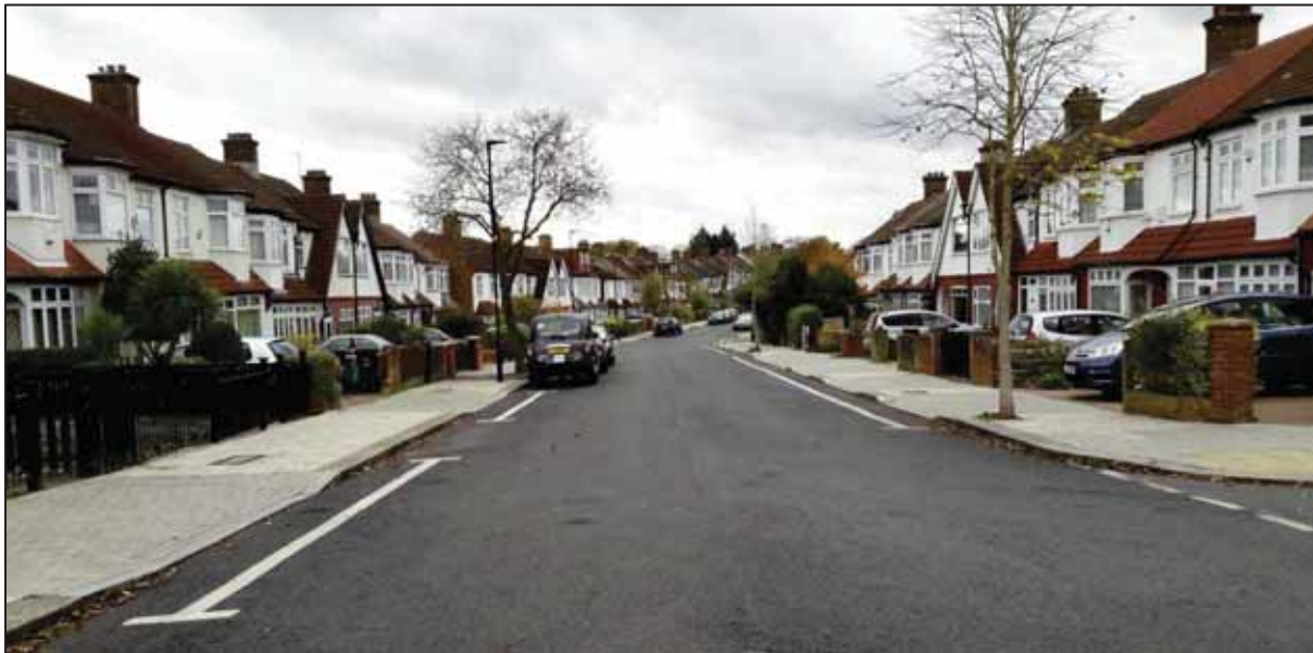
Figure 34. Leithcote Gardens

Leithcote Gardens is a two way road leading to a dead end for vehicles at the northern end of the road, it is approximately 320 metres in length. Pedestrian access is available from Leithcote Gardens through to Leithcote Path. Land use on Leithcote Path is predominantly residential however there is also a school at the northern end of the road.