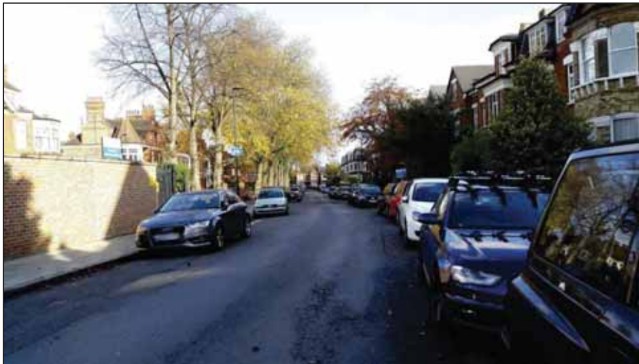
Figure 42. Mount Nod Road

Mount Nod Road is approximately 420 metres in length. Mount Nod Road has a one way section in a southbound direction starting from the junction with Mountearl Gardens. Land use nearby is mainly residential, there is Streatham Ambulance Station present midway along the road and Dunraven School at the southwestern end.