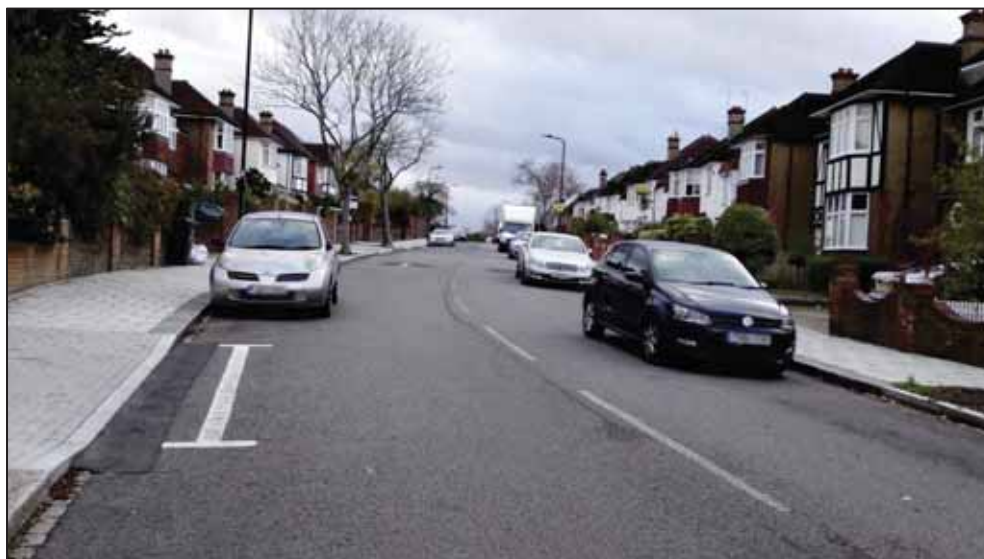
Figure 25. Hoadly Road

Hoadly Road is a two way through road approximately 360 metres in length. The road is a predominantly residential road however Streatham and Clapham High School is to the south west of the junction of Hoadly Road and Abbotswood Road.