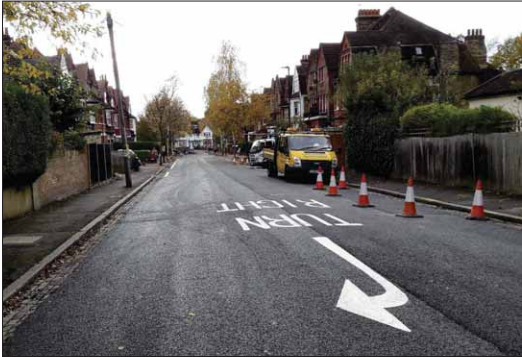
Figure 4. Ashlake Road

Ashlake Road is a two way through road approximately 155 metres in length. The road is a predominantly residential road consisting of terraced, however there is also a hotel at the southern end of the road