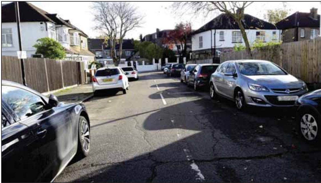
Figure 52. Romeyn Road

Romeyn Road is a two way through road, approximately 205 metres in length. Land use nearby is mainly residential consisting of a mixture of residential units, however Dunraven School is at the south western end of Romeyn Road.