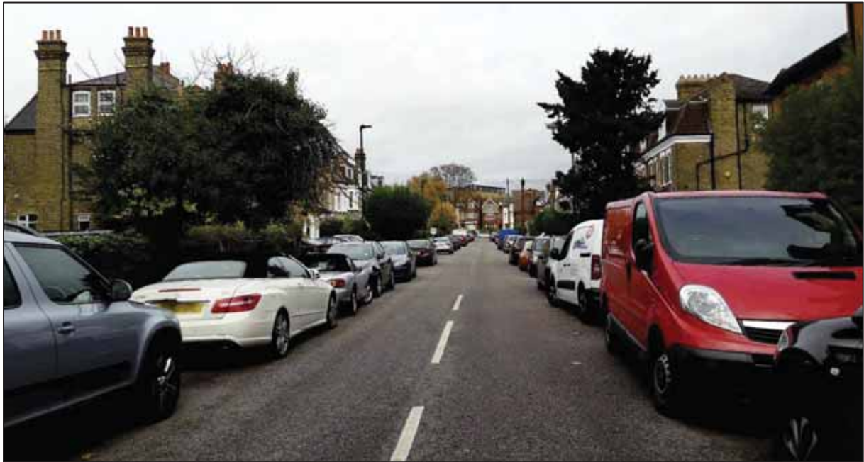
Figure 7. Bournevale Road

Bournevale Road is a two way through road approximately 195 metres in length. The road is a residential road consisting of a mixture of residential units.