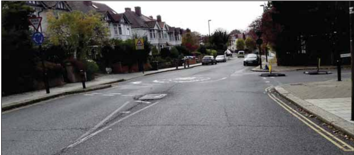
Figure 62. Valley Road

Valley Road is a two way through road approximately 1160 metres in length. Land use nearby is predominantly residential however there are other land uses in the area such as Sunnyhill Primary School. Valley Road runs from Streatham Common in the south to the junction with Leigham Court Road and Knollys Road in the north.