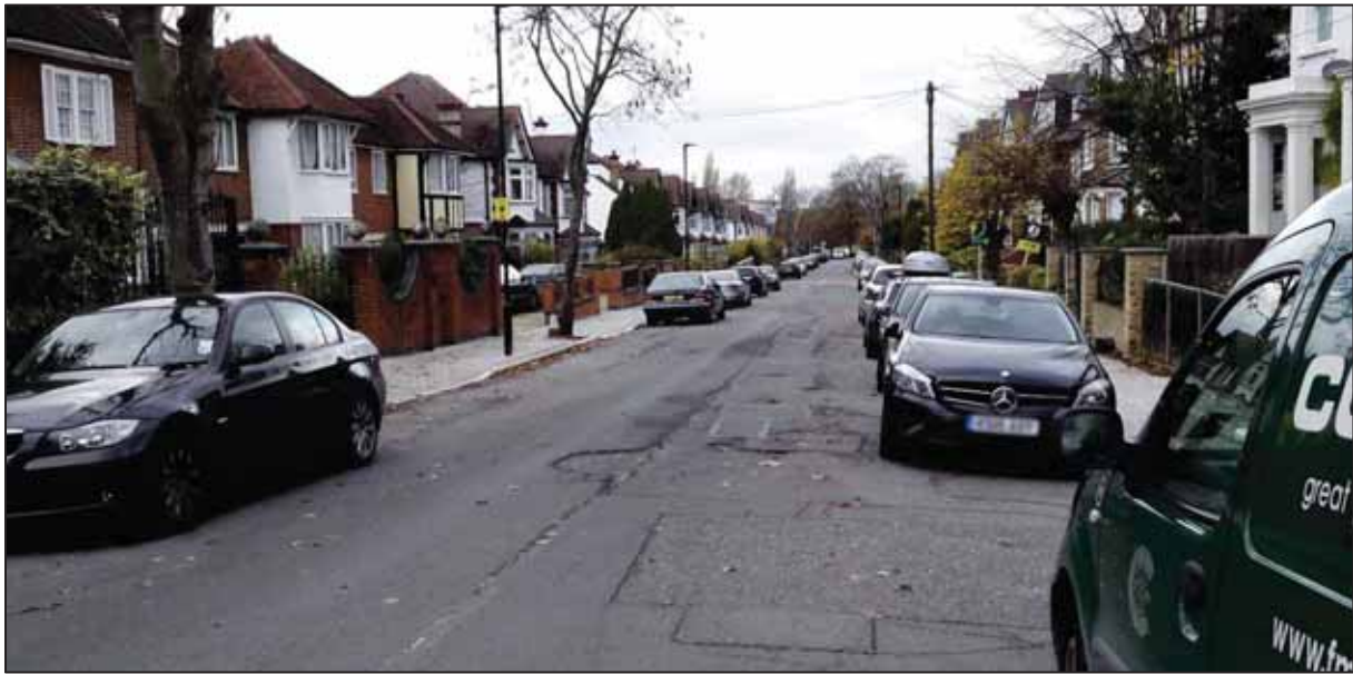
Figure 14. Drewstead Road

Drewstead Road is a two way road leading to a dead end at the western end of the road by Woodfield Recreation Ground / Tooting Bec Common, it is approximately 755 metres in length. The road is a predominantly residential road however there are retail units at the eastern end and also Streatham Hill Rail Station.