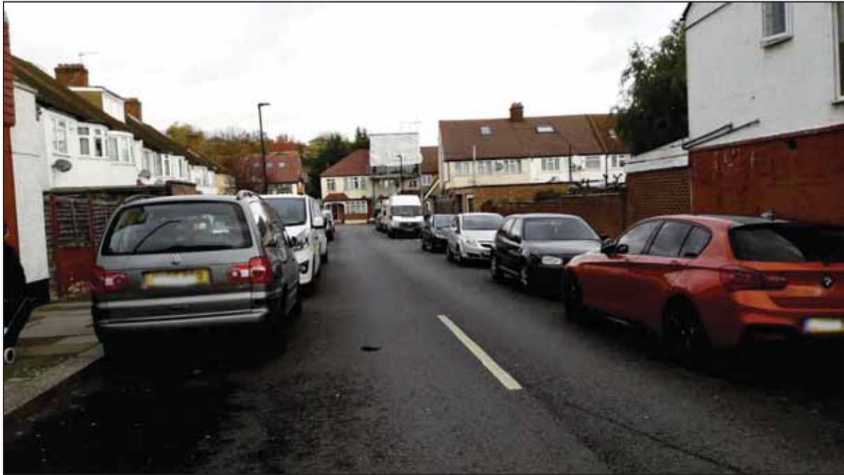
Figure 44. Newcome Gardens

Newcome Gardens is a two way through road approximately 80 metres in length. The road is a residential road consisting of predominantly terraced housing.