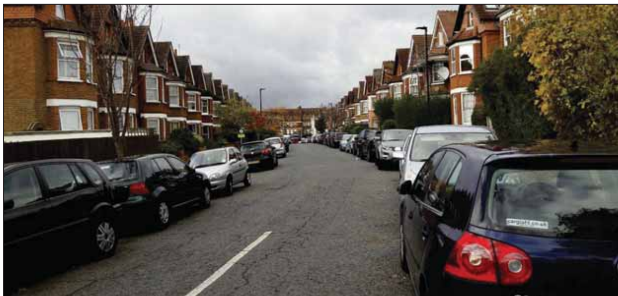
Figure 49. Pinfold Road

Pinfold Road is a two way through road approximately 210 metres in length. Land use nearby is predominantly residential, consisting of semi-detached housing, however retail units and a library are present at the western end of Pinfold Road surrounding the junction with Streatham High Road.