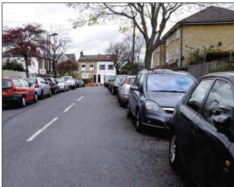
Figure 3. Angles Road

Angles Road is a two way through road approximately 275 metres in length. Angles Road is a residential road consisting of mainly semi-detached housing.