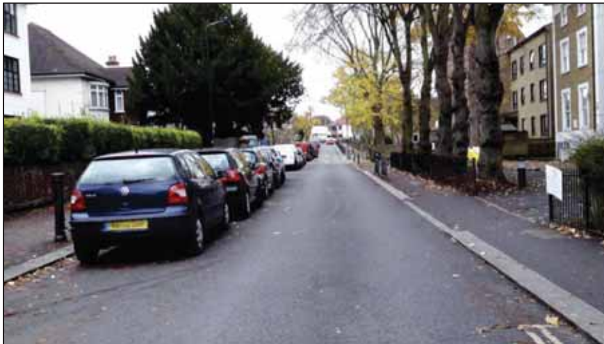
Figure 31. Leigham Avenue

Leigham Avenue is a one way eastbound through road approximately 405 metres in length. Land use nearby is predominantly residential properties, however retail units and a school are present at the western end of Leigham Avenue surrounding the junction with Streatham High Road.