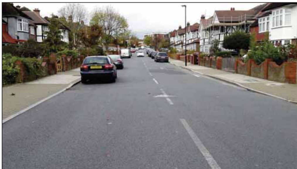
Figure 65. Woodfield Avenue

Woodfield Avenue is a two way through road approximately 500 metres in length. The road is a residential road consisting of a mixture of residential units.