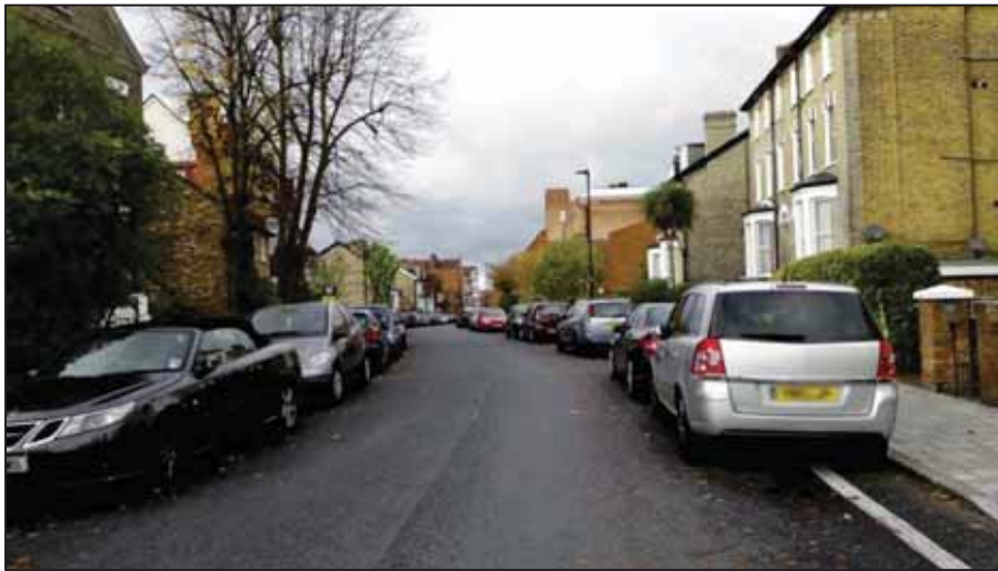
Figure 48. Pendennis Road

Pendennis Road is a two way through road approximately 495 metres in length. Land use nearby is predominantly residential, however retail and leisure units such as an Odeon cinema are present at the western end of Pendennis Road surrounding the junction with Streatham High Road.