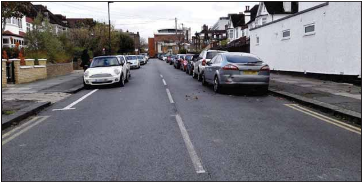
Figure 9. Broadlands Avenue

Broadlands Avenue is a two way through road approximately 190 metres in length. Land use nearby is mixed, with mainly residential properties at the western end, and retail and leisure facilities such as Tesco Express and Belmont Bowling Club at the eastern end.