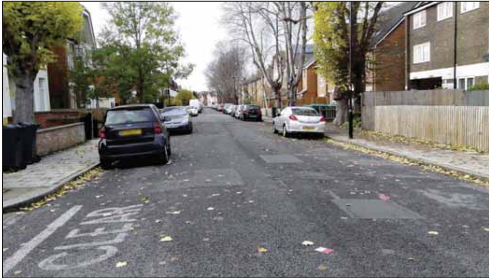
Figure 46. Oakdale Road

Oakdale Road is a two way road approximately 330 metres in length. Land use on Oakdale Road is entirely residential, consisting of mostly semi-detached houses on the southern side and blocks of flats on the northern side.