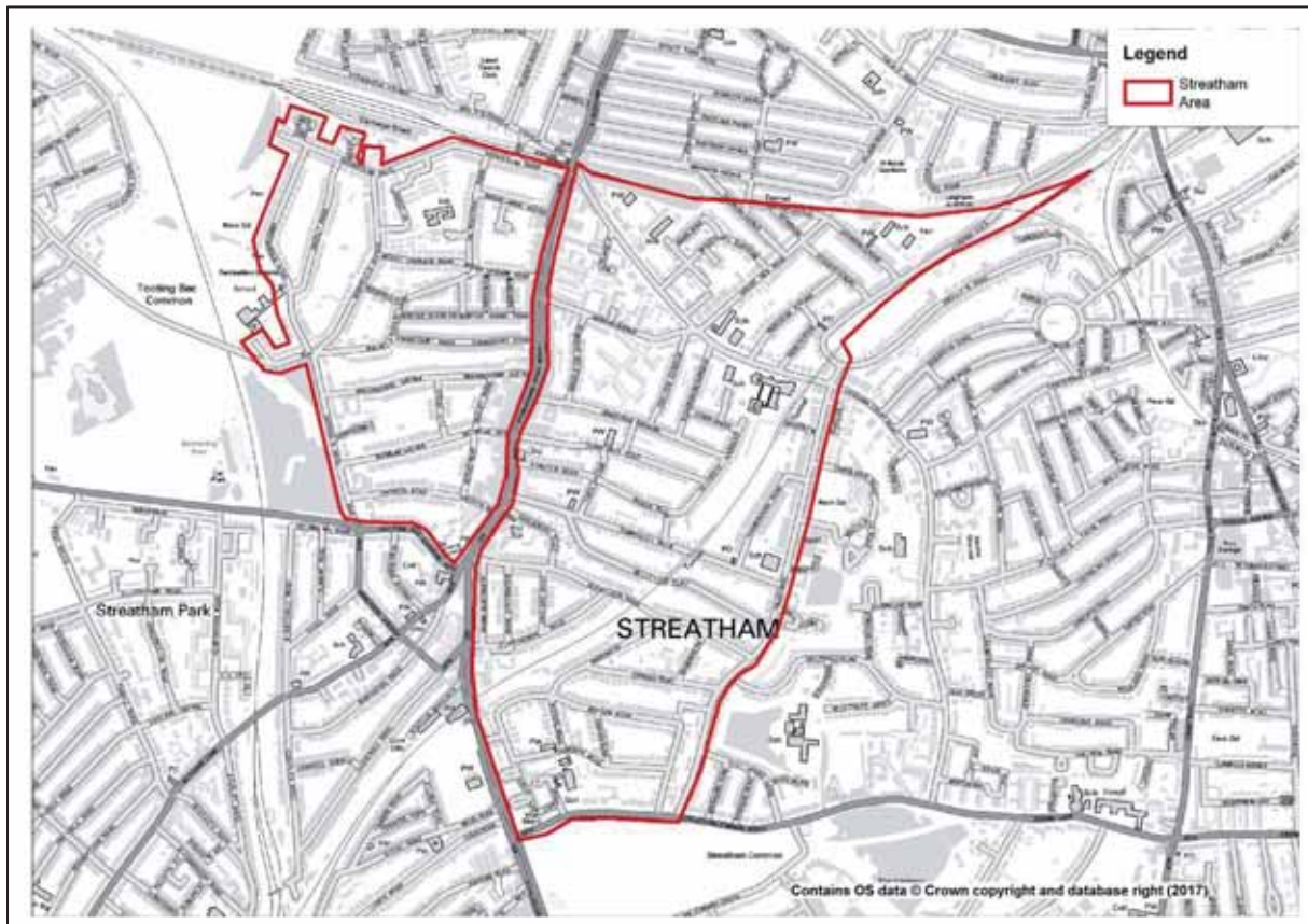
Figure 1. Location Plan of the Streatham Area