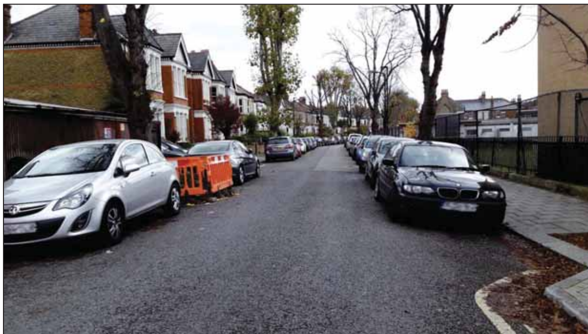
Figure 23. Harbrough Road

Harbrough Road is a two way through road approximately 310 metres in length. The road is a predominantly residential road consisting of mostly terraced housing, however Sunnyhill School and Children's Centre is at the southern end of the road, at the junction with Sunnyhill Road.