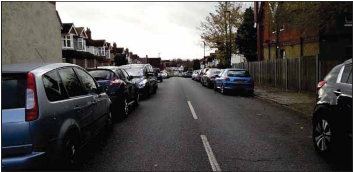
Figure 11. Culverhouse Gardens

Culverhouse Gardens is a two way through road approximately 250 metres in length. The road is a residential road consisting of semi-detached housing, however it must be noted that Dunraven Sixth Form is at the junction with Leigham Court Road at the northern end of Culverhouse Gardens.