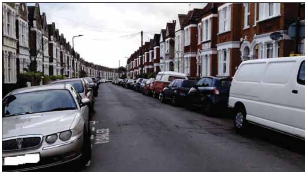
Figure 29. Kingscourt Road

Kingscourt Road is a two way through road approximately 355 metres in length. Land use nearby is predominantly residential properties in the form of terraced housing, however retail units are present at the eastern end of Kingscourt Road surrounding the junction with Streatham High Road.