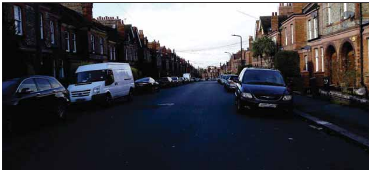
Figure 22. Hailsham Avenue

Hailsham Avenue is a two way through road, approximately 180 metres of the southeastern section of Hailsham Avenue is in the survey area. The road is a residential road consisting of terraced housing.