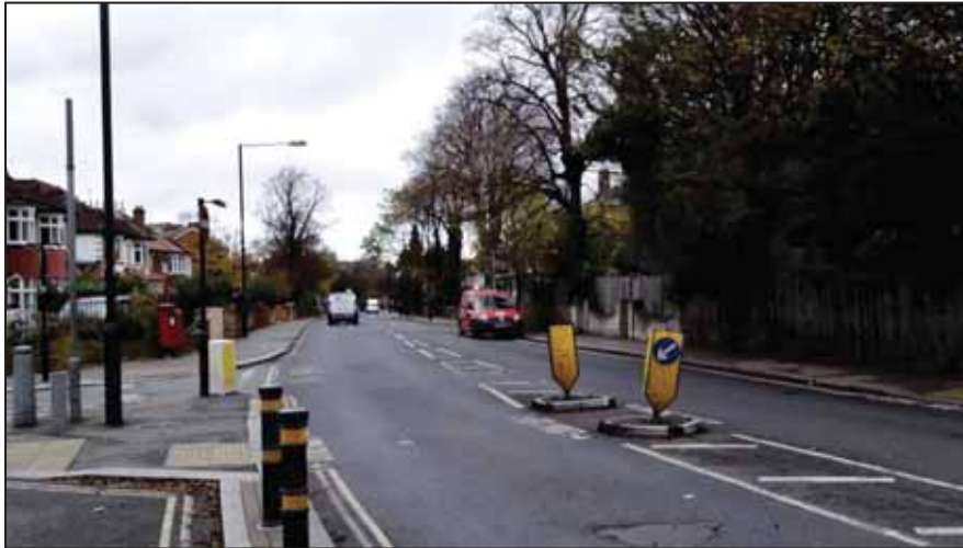
Figure 32. Leigham Court Road

Leigham Court Road is a two way through road approximately 880 metres in length. The section of Leigham Court Road in the survey area runs from Streatham Hill Rail Station in the west to the junction with Valley Road and Knollys Road in the east. Land use at the western end of the road near the station is heavily retail orientated, the rest of the road is predominantly residential, with some exceptions such as the Leigham Court Hotel and Dunraven Schools