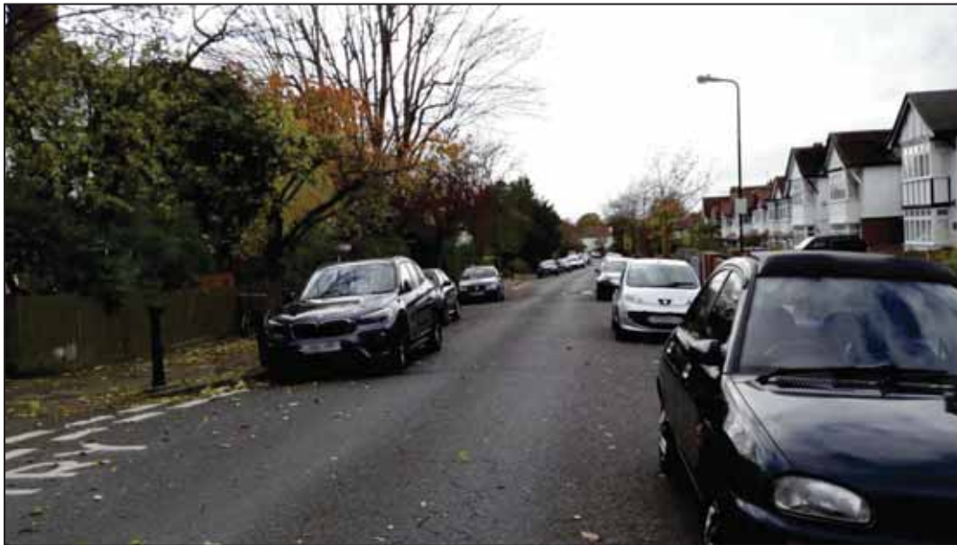
Figure 64. Woodbourne Avenue

Woodbourne Avenue is a one way eastbound through road approximately 530 metres in length. Land use nearby is mainly residential, however retail units are at the eastern end surrounding the junction with Streatham High Road and Tooting Bec Common is at the western end of the road.