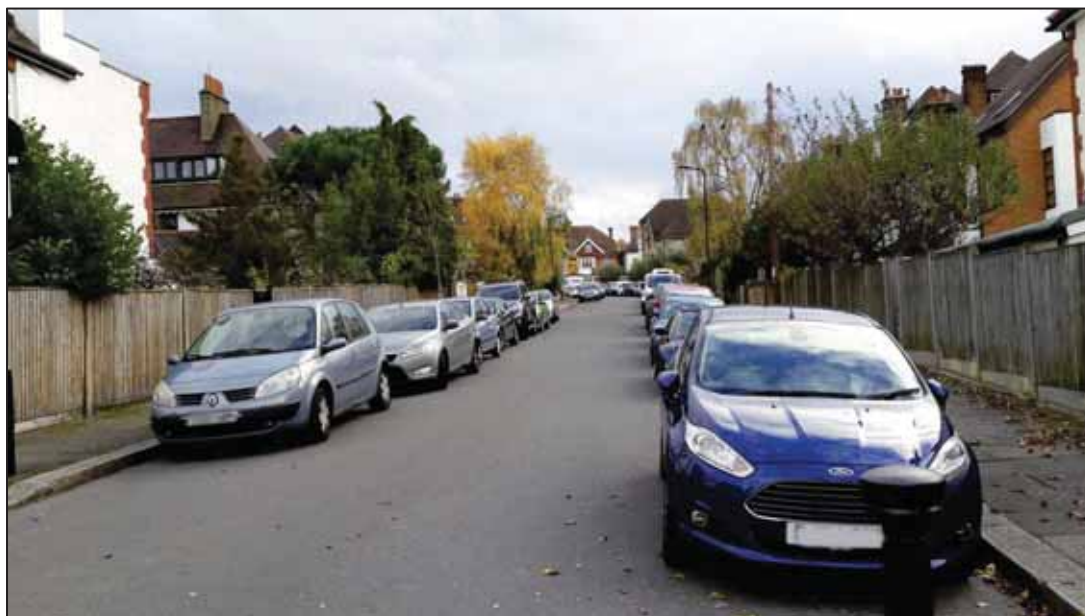
Figure 57. Steep Hill

Steep Hill is a one way through road in a northbound direction, it is approximately 155 metres in length. The road is a residential road consisting mostly of semi-detached housing.