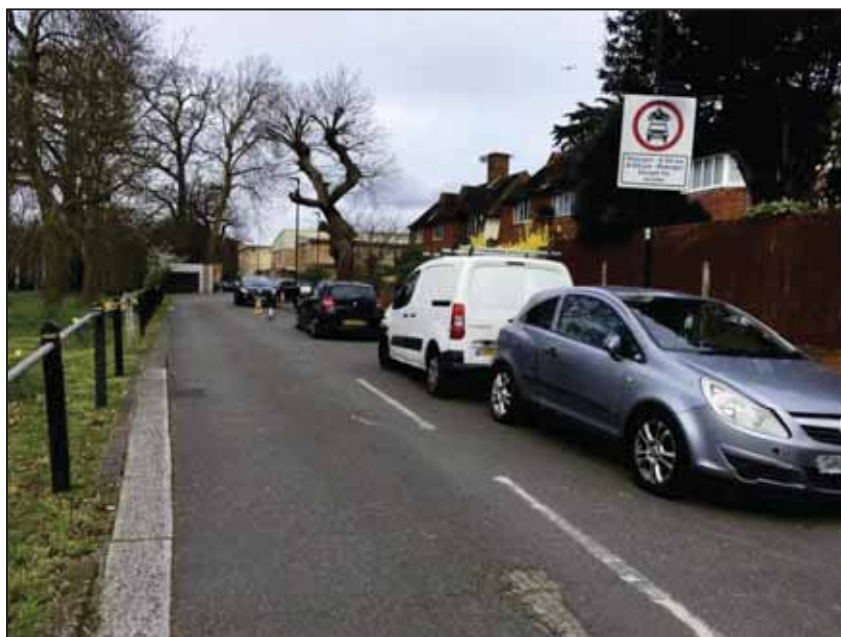
Figure 61. The Spinney

The Spinney is a two way road leading to a dead end, approximately 65 metres in length. Land use in the area is predominantly residential, however Streatham & Clapham High School is nearby.