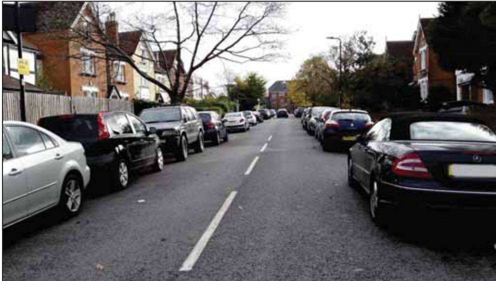
Figure 54. Rutford Road

Rutford Road is a two way through road approximately 130 metres in length. The road is a residential road consisting of a mixture of residential units, however St. Andrew's Catholic Primary School is opposite the junction at the southern end of Rutford Road and the Whittington Centre NHS Healthcare Centre is also on this junction.