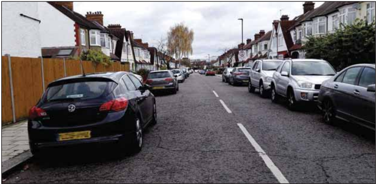
Figure 20. Gracefield Gardens

Gracefield Gardens is a two way through road approximately 505 metres in length. Land use nearby predominantly consists of residential properties, however retail units and a GP surgery / medical centre are present at the western end of Gracefield Gardens surrounding the junction with Streatham High Road.