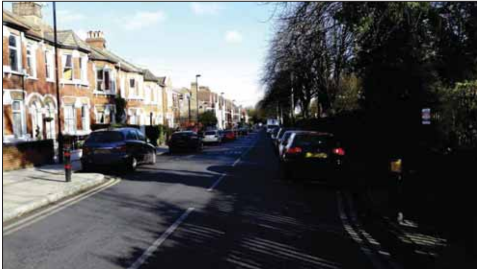
Figure 33. Leigham Vale

Leigham Vale is a two way through road, the section of Leigham Vale that is covered by the survey is approximately 660 metres in length. The section of Leigham Vale in the survey area runs from the where the most northern of the rail bridges crosses Leigham Vale to the junction with Knollys Road to the south. Land use is predominantly residential, with some exceptions such as Hitherfield School Hotel and Dunraven Schools. In addition, there are a small number of retail units near the junction with Knollys Road.