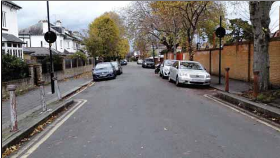
Figure 47. Ockley Road

Ockley Road is a one way through road approximately 310 metres in length. The road is one way in a northbound direction north of Becmead Avenue and one way in a southbound direction south of Becmead Avenue. The northern section of Ockley Road is a residential road, however there is also access to Virgin Active Streatham on the section north of Becmead Avenue. The southern section has a more mixed land use, with residential properties to the west and a Lidl and Royal Mail Delivery Office to the east.