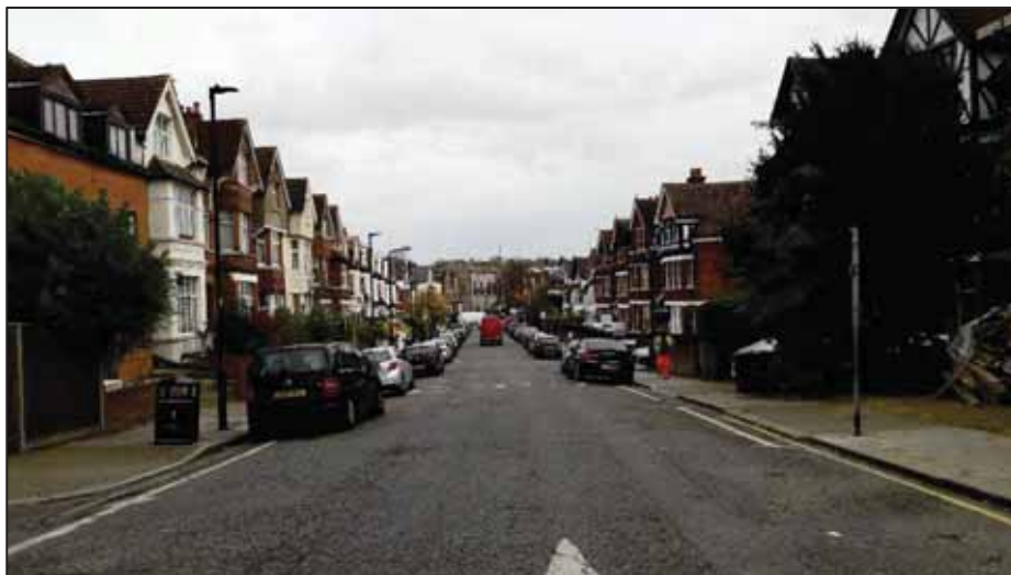
Figure 19. Gleneldon Road

Gleneldon Road is approximately 740 metres in length. Gleneldon Road is one way eastbound from Streatham High Road to the junction with Stanthorpe Road, however after this it is two way. Land use nearby is mainly residential, however retail units are at the western end surrounding the junction with Streatham High Road.