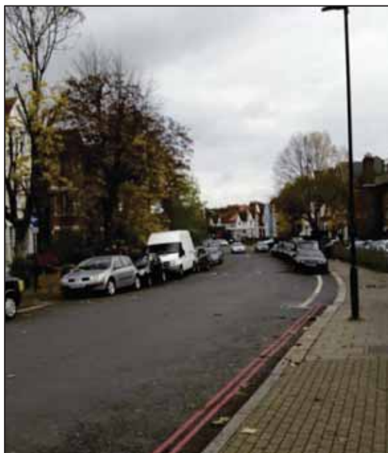
Figure 56. Stanthorpe Road

Stanthorpe Road is approximately 375 metres in length. Stanthorpe Road is a one way street in an eastbound direction. Land use nearby is mainly residential, however retail units are at the western end surrounding the junction with Streatham High Road.