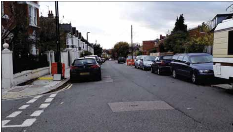
Figure 40. Mount Ephraim Lane

Mount Ephraim Lane is a two way road approximately 475 metres in length. There is a barrier at both the northern and southern end of Mount Ephraim Lane where vehicles are not allowed through, however cyclists are. Land use on Mount Ephraim Lane is entirely residential.