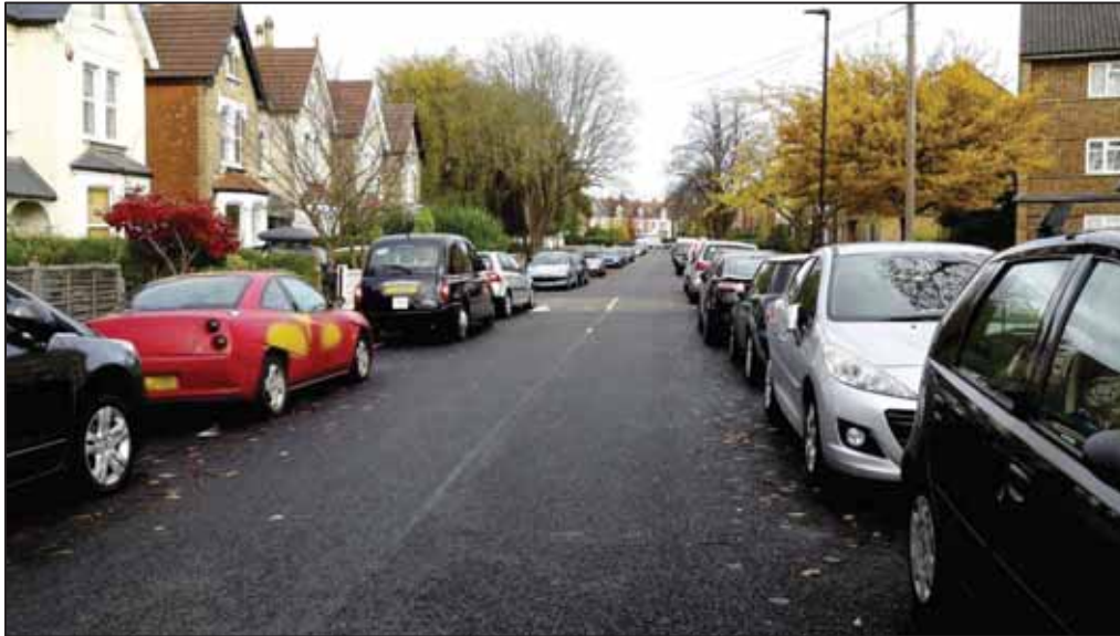
Figure 37. Madeira Road

Madeira Road is a two way road approximately 345 metres in length. Land use on Madeira Road is entirely residential, consisting of a mixture of residential units.