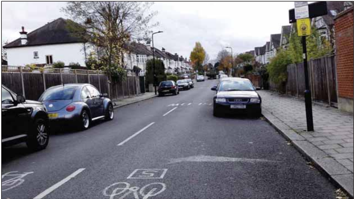
Figure 2. Abbotswood Road

Abbotswood Road is a two way through road approximately 755 metres in length. The road is a predominantly residential road however Streatham and Clapham High School is to the west of, and accessed via, Abbotswood Road.