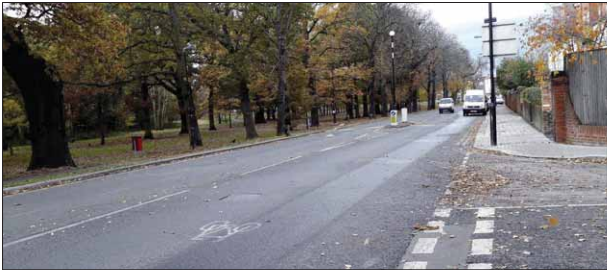
Figure 17. Garrad's Road

Garrad's Road is a two way through road approximately 435 metres in length. Land use nearby is residential to the east of the road, however Tooting Bec Common is to the west. Garrad's Road runs from the junction with Woodfield Avenue to Tooting Bec Road.