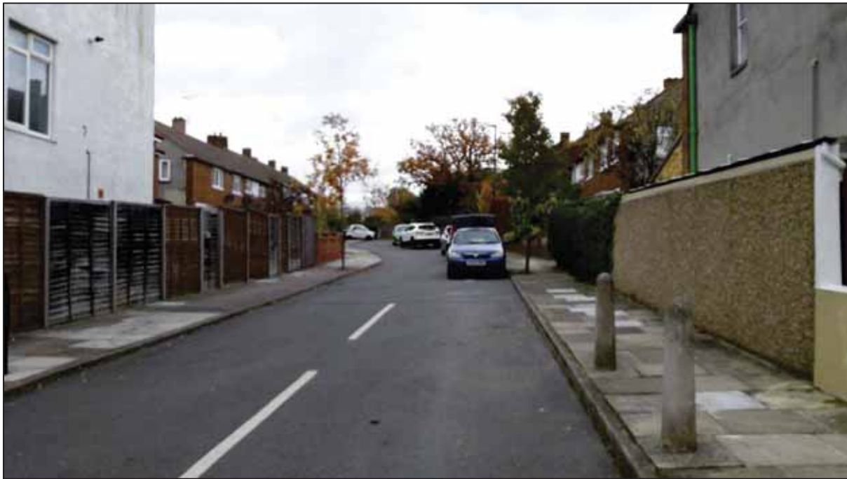
Figure 30. Leigh Orchard Close

Leigh Orchard Close is a two way road approximately 80 metres in length. The road is a residential road consisting of mostly terraced housing.