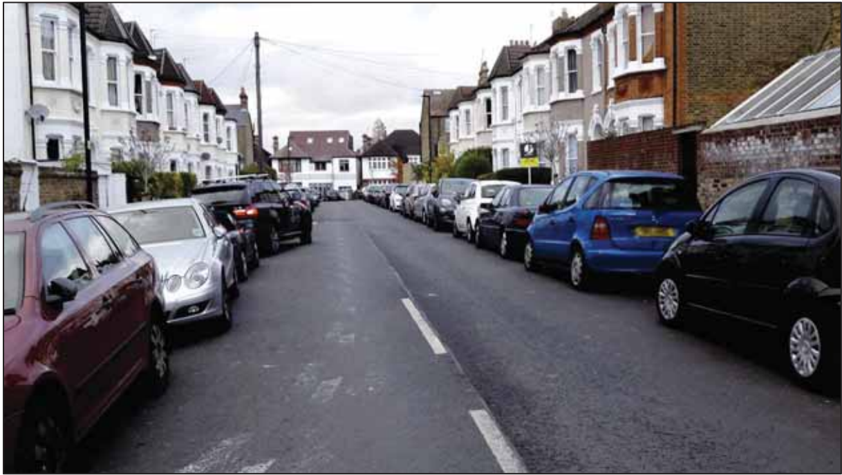
Figure 6. Blakemore Road

Blakemore Road is a two way through road approximately 100 metres in length. The road is a residential road consisting of terraced housing.