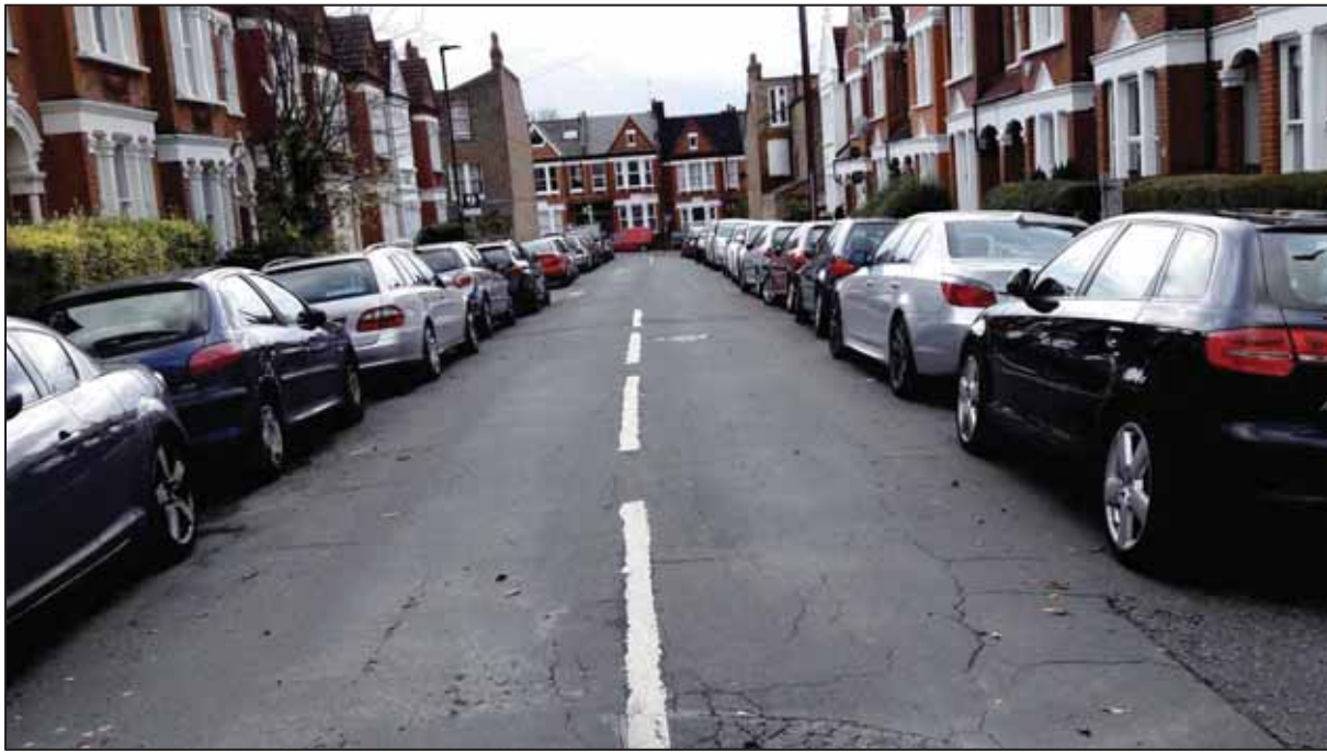
Figure 38. Moorcroft Road

Moorcroft Road is a two way through road approximately 80 metres in length. The road is a residential road consisting of entirely terraced housing, parking is evident on both sides of the road.