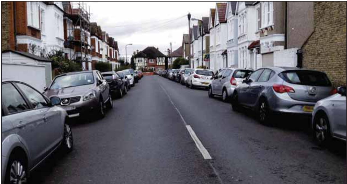
Figure 8. Brancaster Road

Brancaster Road is a two way through road approximately 105 metres in length. The road is a residential road consisting of terraced housing.