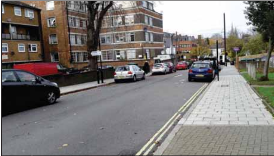
Figure 26. Hopton Road

Hopton Road is approximately 825 metres in length. Hopton Road is mostly a two way road apart from the one way north east bound section between the junction with Polworth Road and the junction with Madiera Road and Rutford Road. Land use nearby is mainly residential, consisting of semi-detached houses and blocks of flats, however retail units are at the western end surrounding the junction with Streatham High Road, including a large Tesco Extra store opposite the junction. In this western section there is also a large office block.