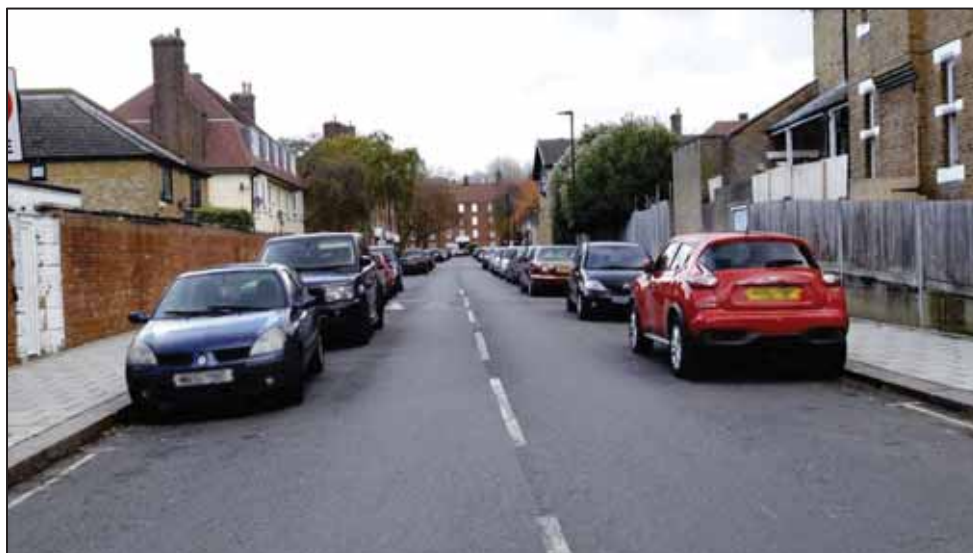
Figure 43. Mountearl Gardens

Mountearl Gardens is a two way road approximately 350 metres in length. Land use on Mountearl Gardens is predominantly residential, consisting mainly blocks of flats in an estate. In addition Streatham Ambulance station is at the eastern end of Mountearl Gardens.