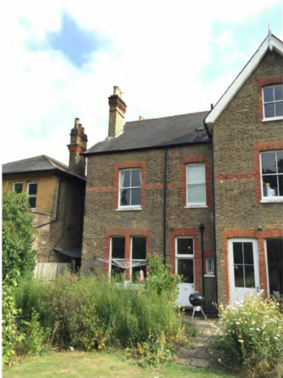
North Elevation (Left)