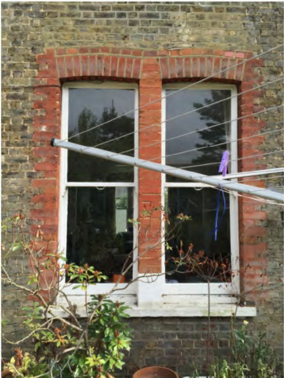
Existing Window Example