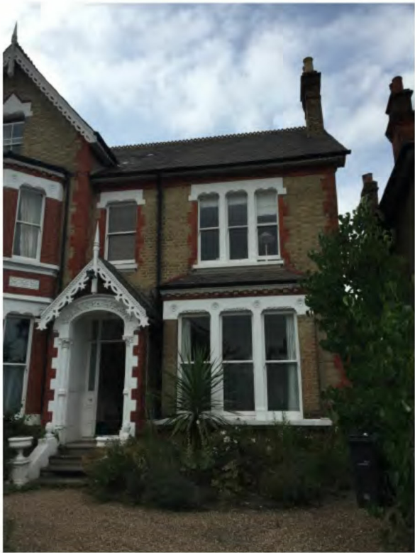
South Elevation (Right)