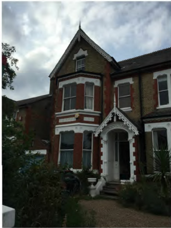
South Elevation (Left)