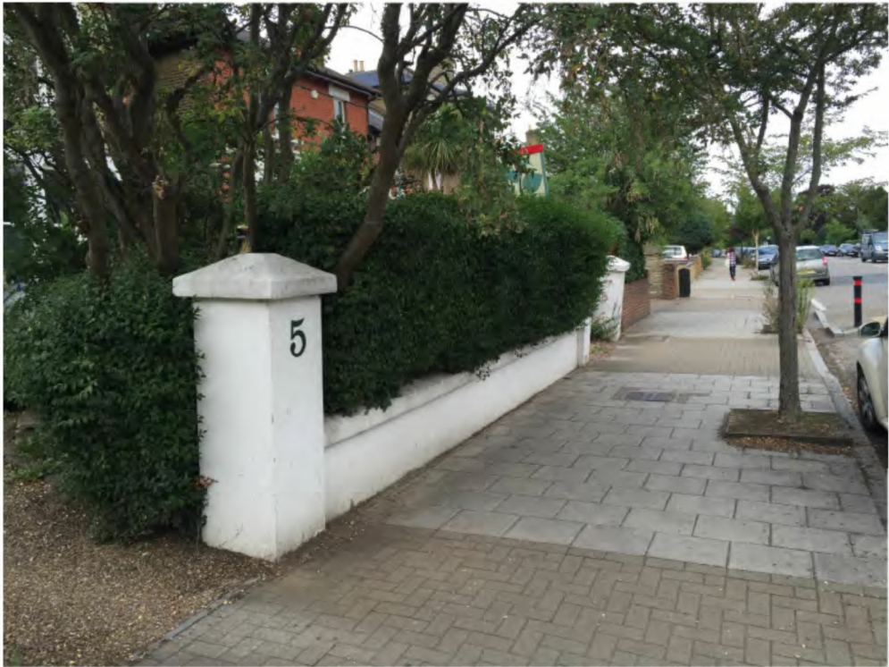
Public Footpath and Front garden Boundary