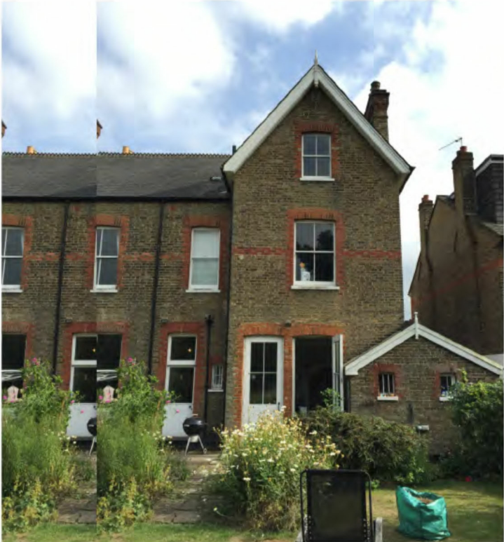
North Elevation (Right)