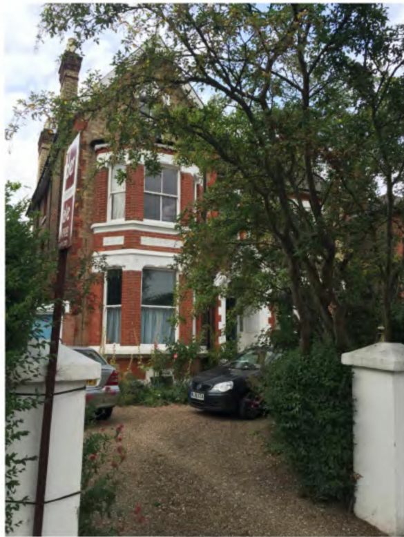
Access to property