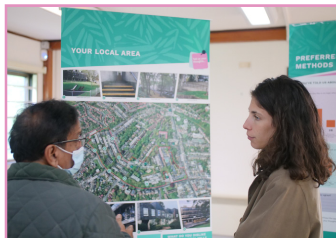
A Central Hill resident and PRP officer discussing the Meet the Team boards