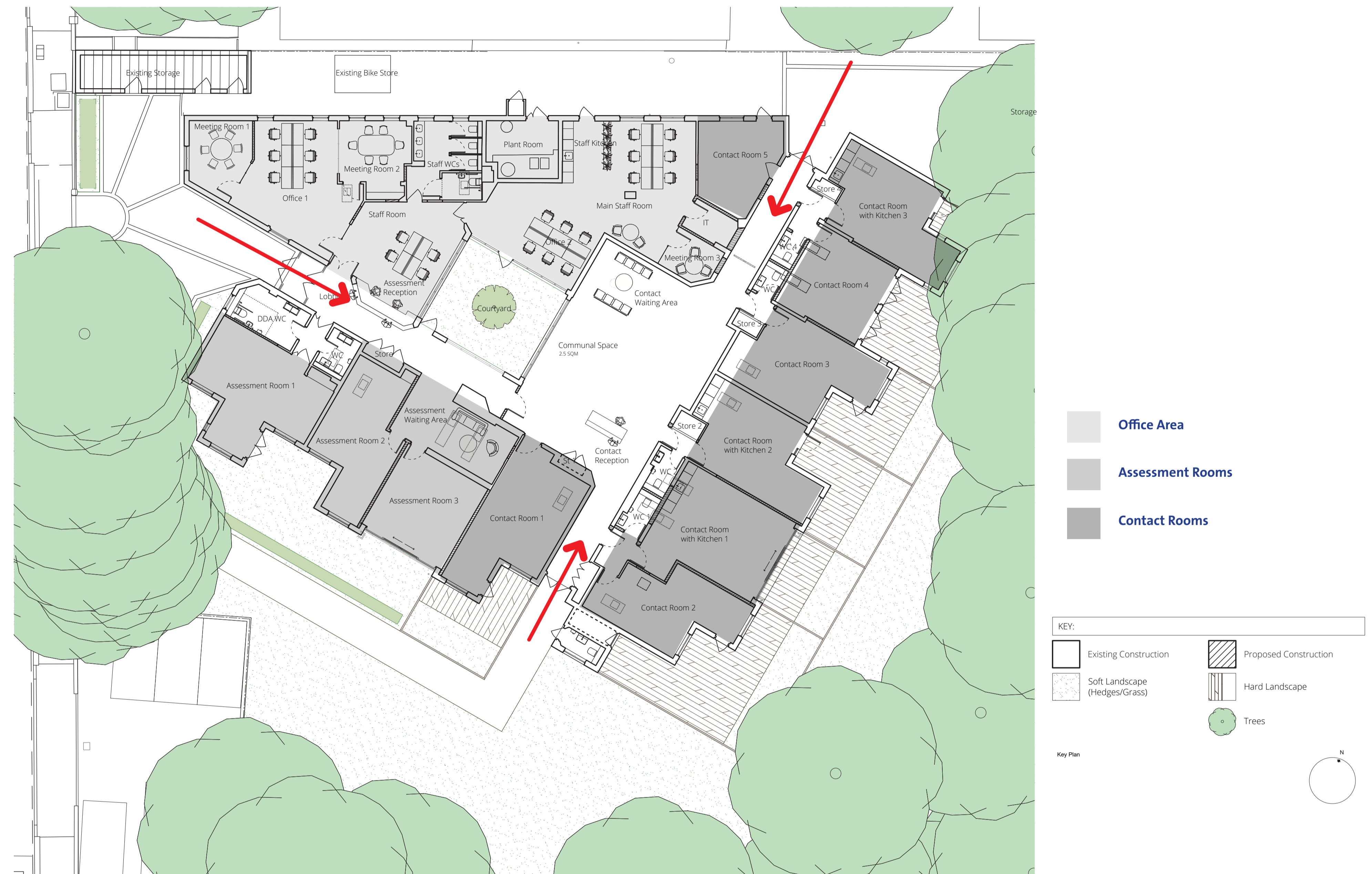
Proposed Ground Floor Plan with red annotation showing entrance points