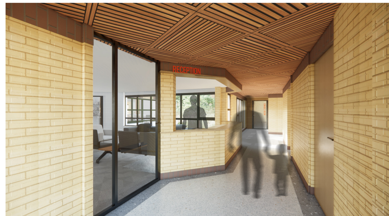
3D view showing reception at main entrance