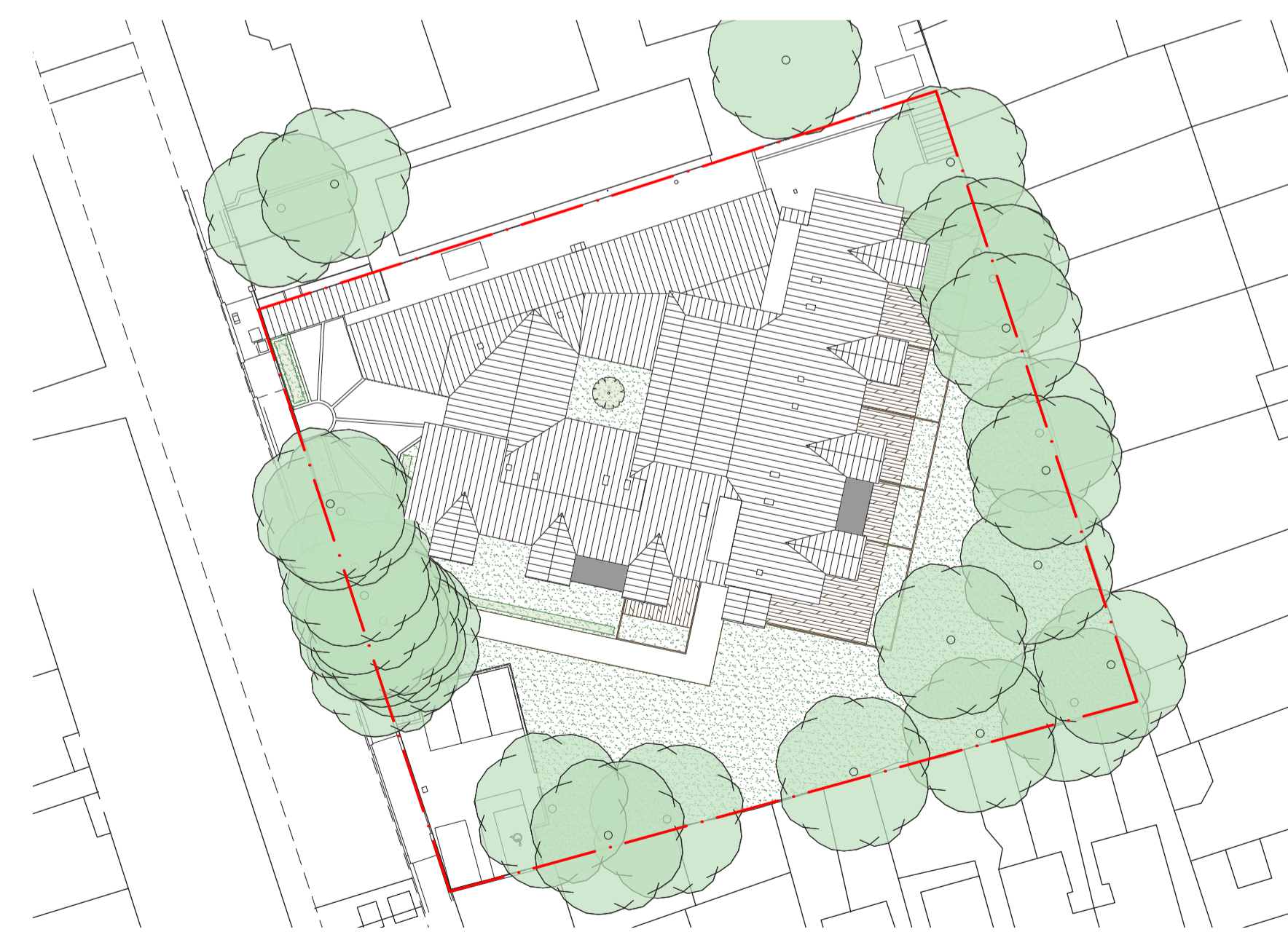
Proposed site plan of overall scheme