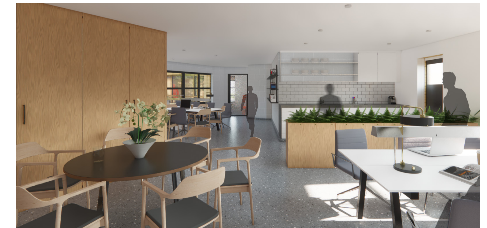
3D view showing new main office space