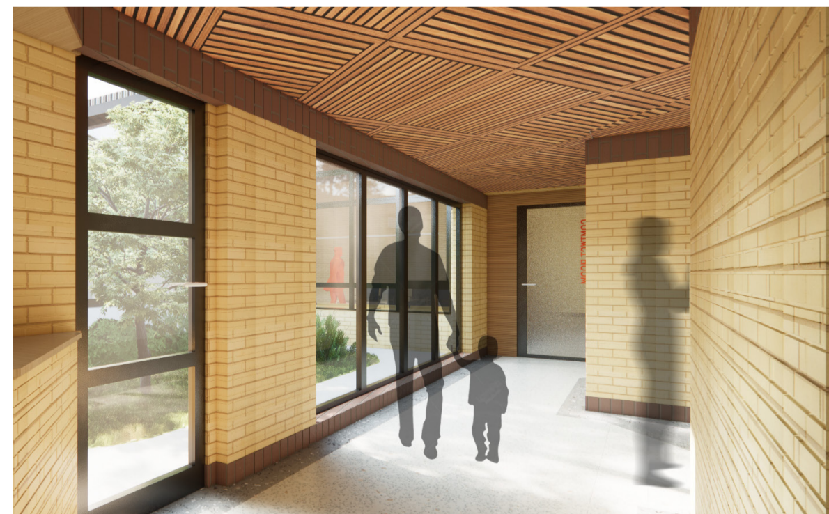
3D view showing corridor leading to multi-use space & waiting room