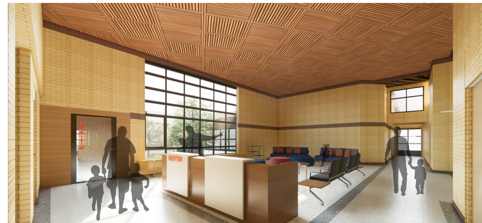
3D view showing the multi-use & waiting room