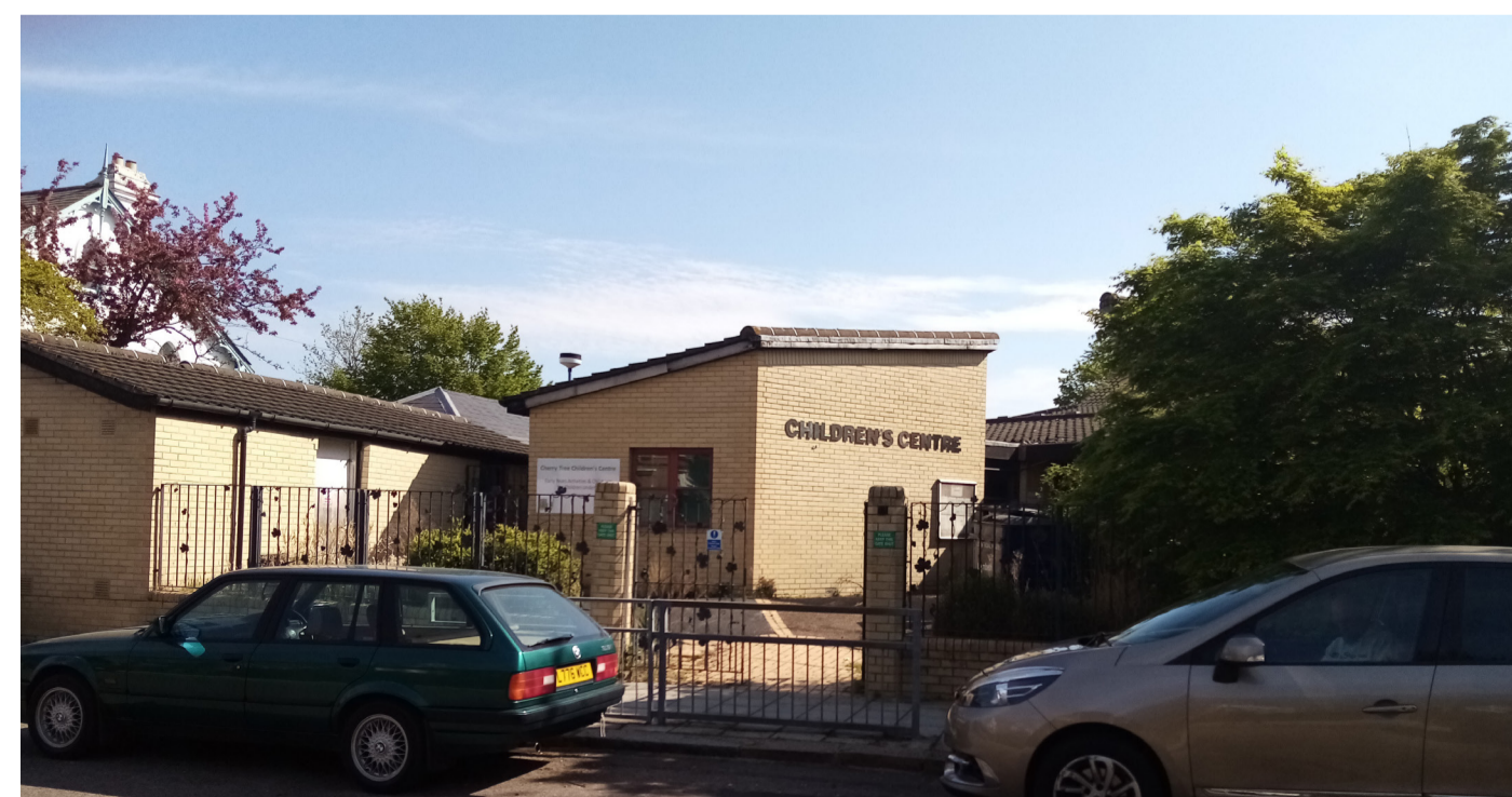
Street View of main entrance