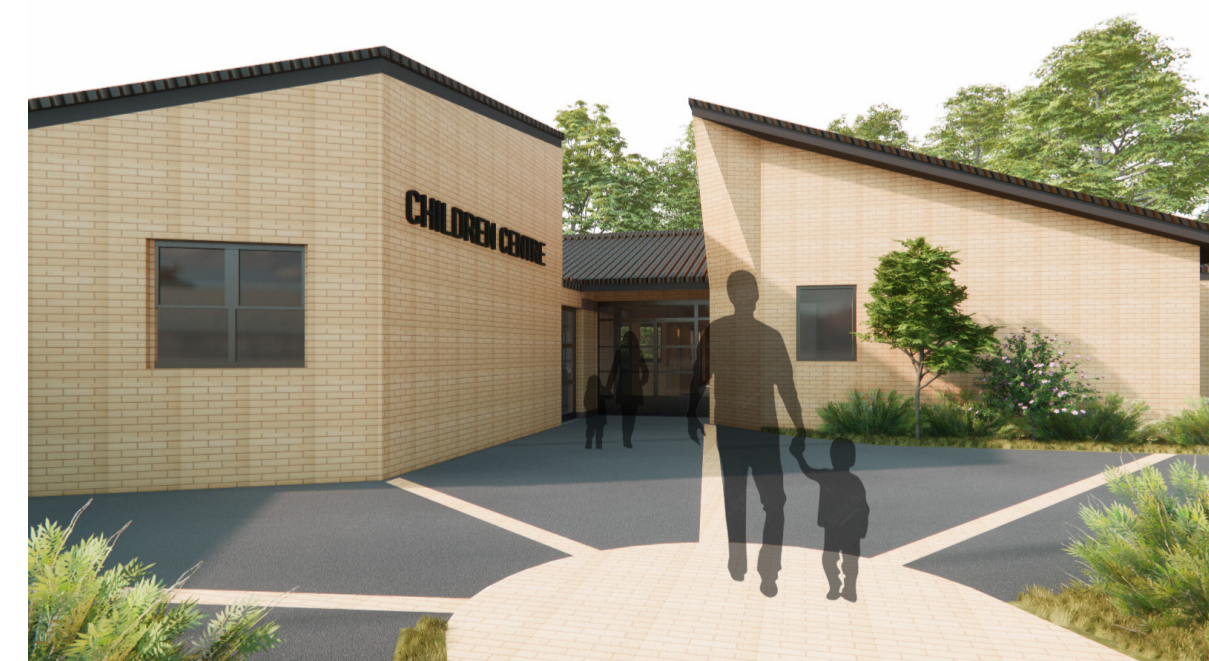
Improved landscaping and access