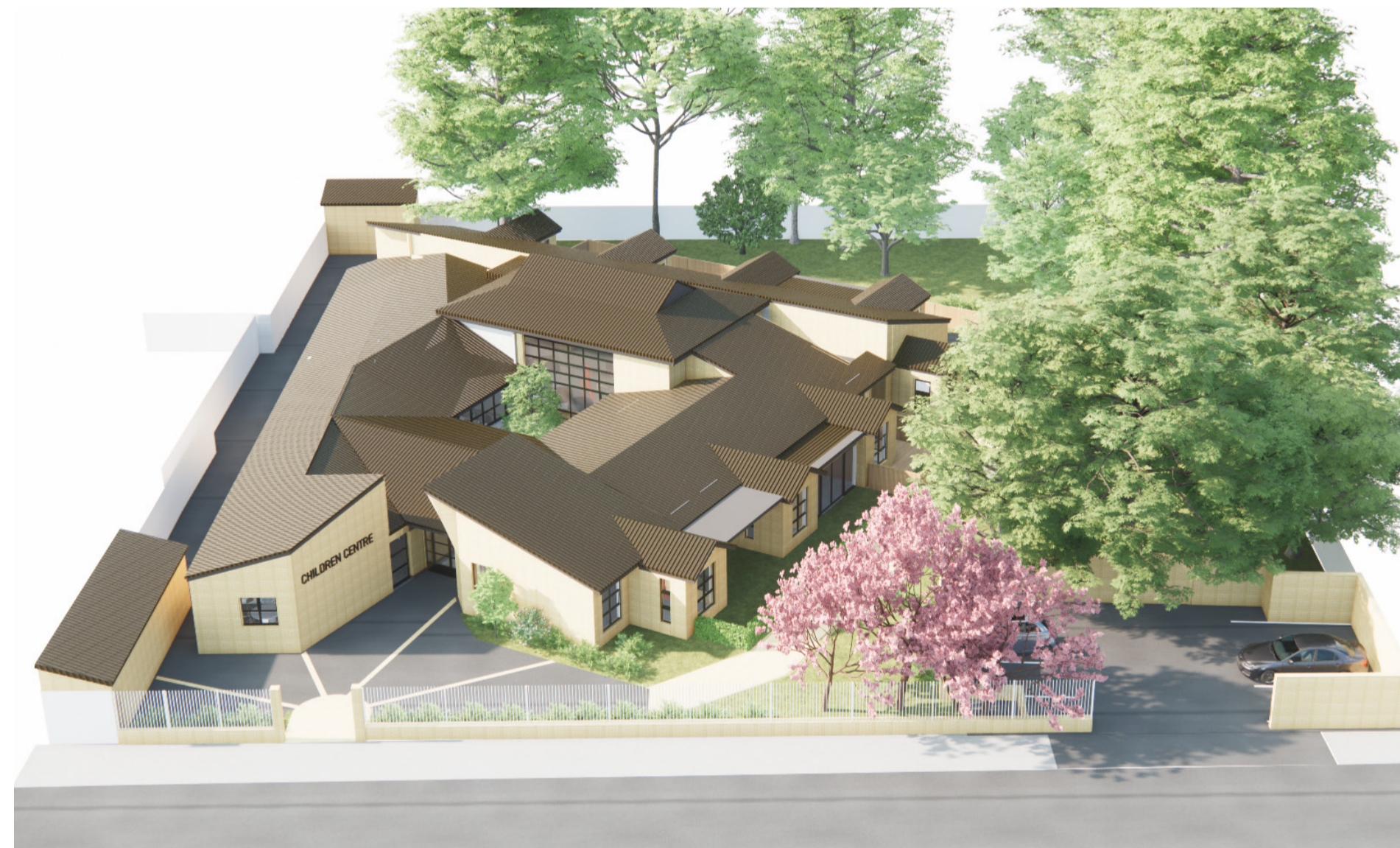
3D overlooking the entire site

The single-storey building is no longer used as a nursery and is currently looked after by live-in guardians. This feasibility examines the potential to locate 2 services within the building, with flexibility to provide accommodation for supplementary services.