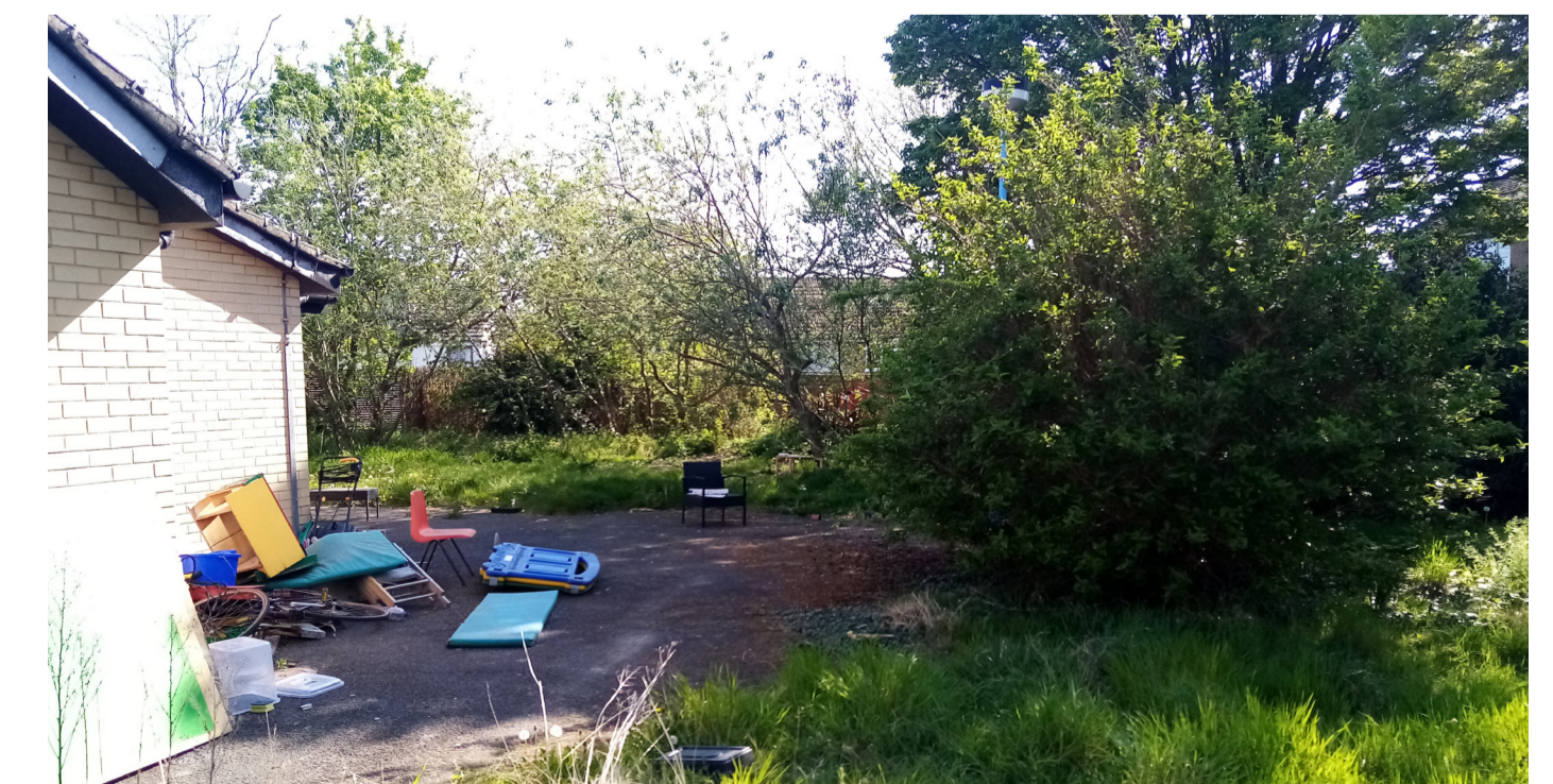
Neglected outdoor area