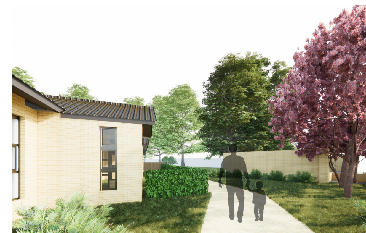
New landscaping and access to contact room reception