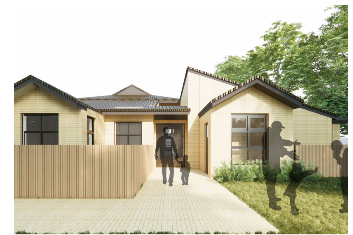
New landscaping and access to contact room reception