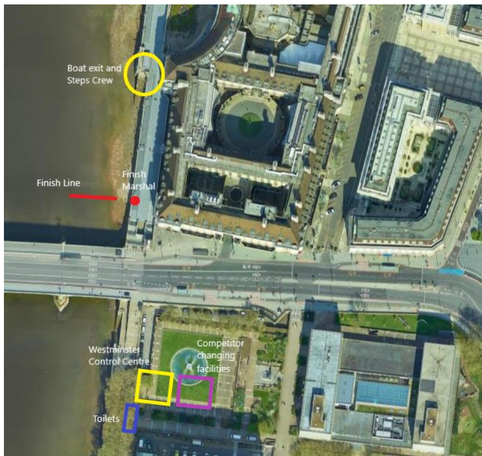
Westminster site map