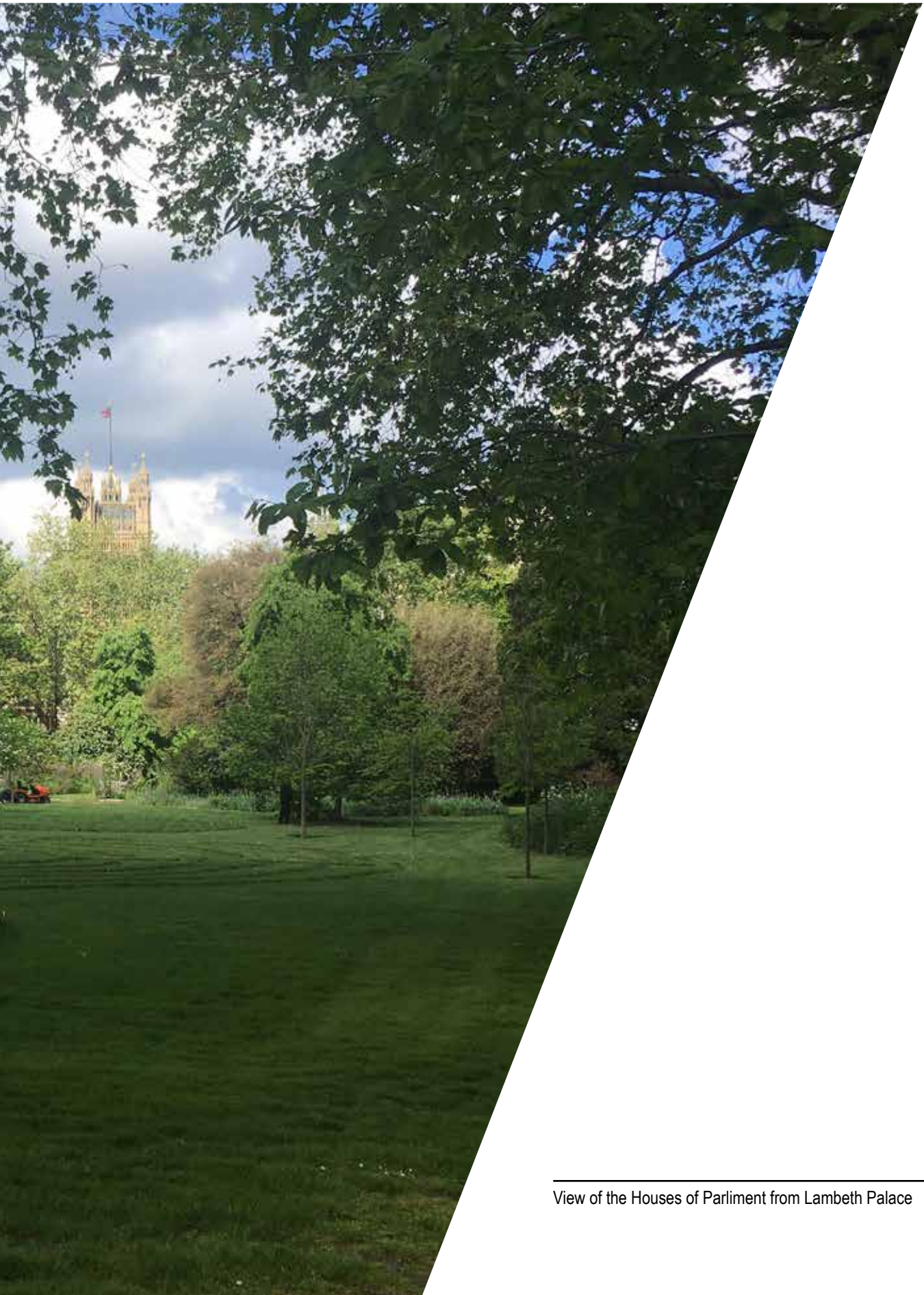
View of the Houses of Parliament from Lambeth Palace