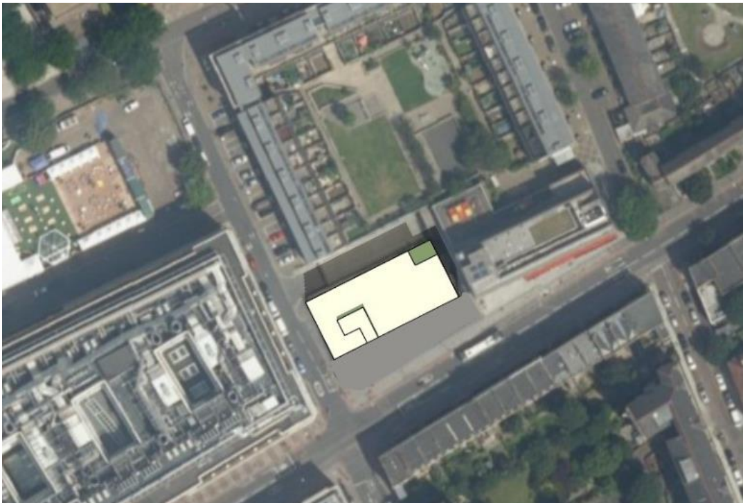
Figure 10 – Indicative Approach footprint overlaid upon an aerial view