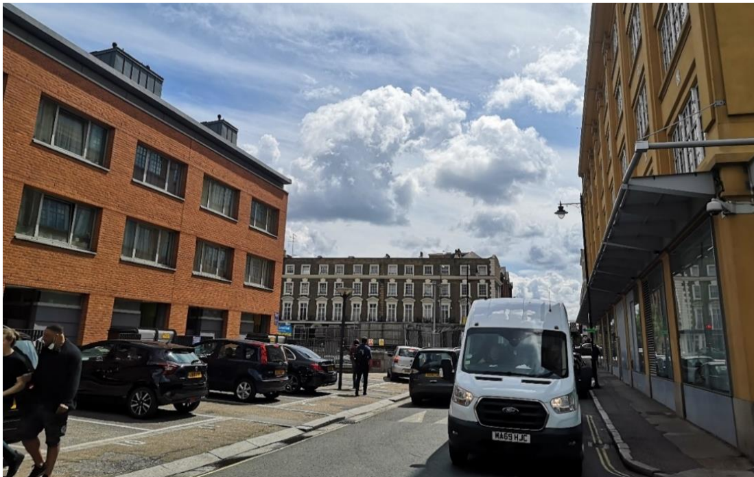
Figure 5 - Looking south from Cornwall Road / Doon Street junction towards the site.