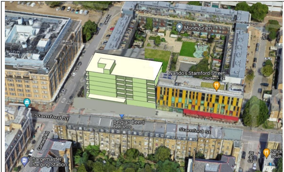
Figure 11 - Indicative Approach 3D model in context. This is illustrative and not to scale.