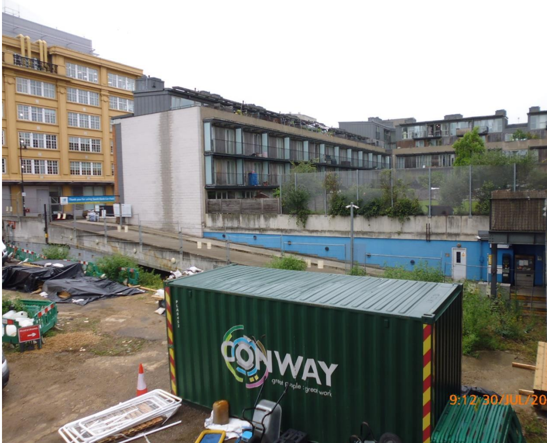
Figure 9 - Seen from Stamford Street this view shows the interior of the block of housing on Cornwall Road which faces towards the site and the car park access ramp.