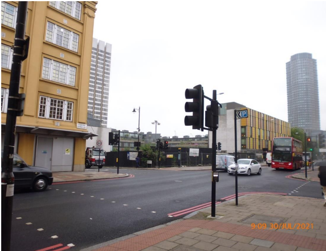
Figure 4 - Looking west from corner of Coin St and Stamford St towards the site.