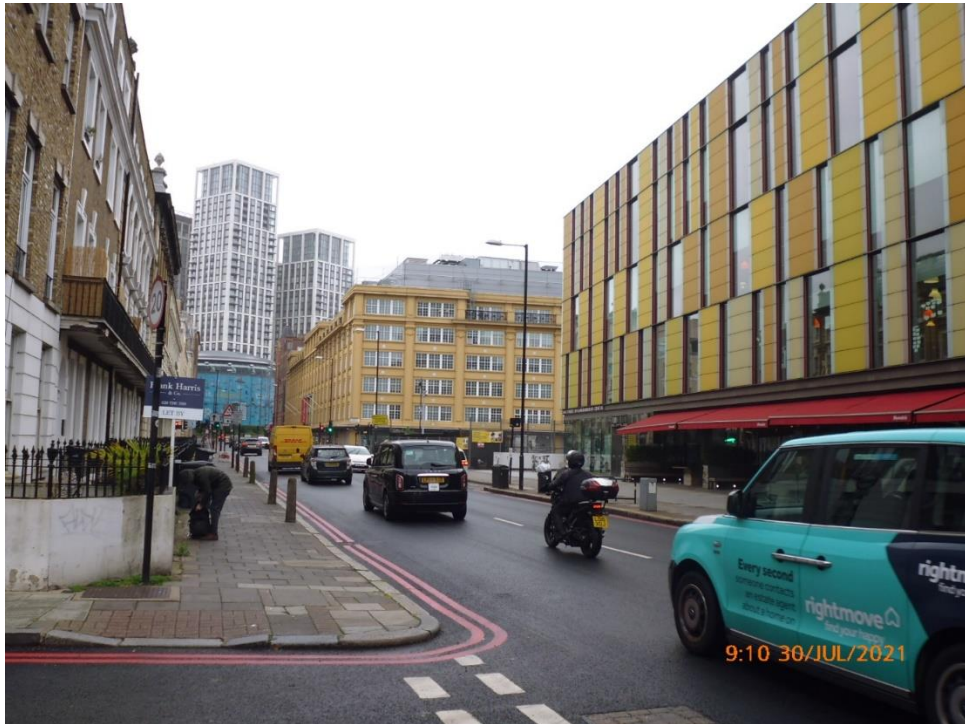
Figure 2 - Looking West along Stamford Street towards site

2.2 The photographs in this section show the site and its context.