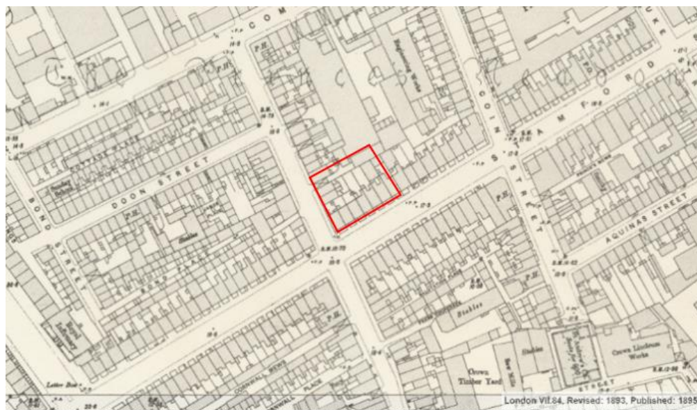
Figure 6 - 1890s OS map showing the whole northern side of Stamford Street lined with Georgian terraced houses from the time when Stamford Street was laid out in the first decades of the 19 th Century.