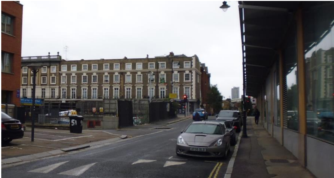
Figure 8 - Seen from Cornwall Road, the car park access ramp is on the left.