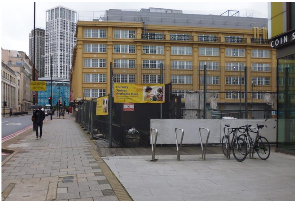
Figure 3 – Current site frontage to Stamford Street as viewed from East