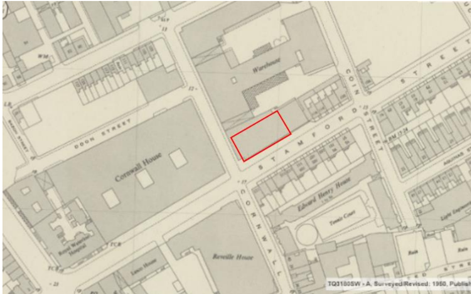
Figure 7 - 1950s OS map showing the previous warehouse on the site. The local gap sites are the result of enemy action during the Second World War.