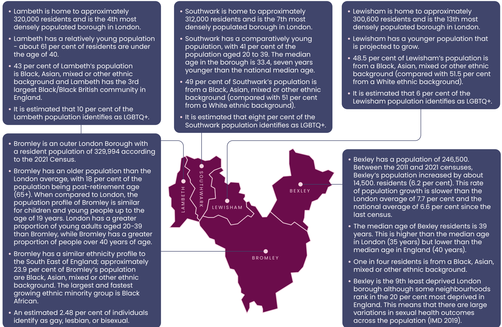
Figure 1: All data is taken from the 2021 Census.