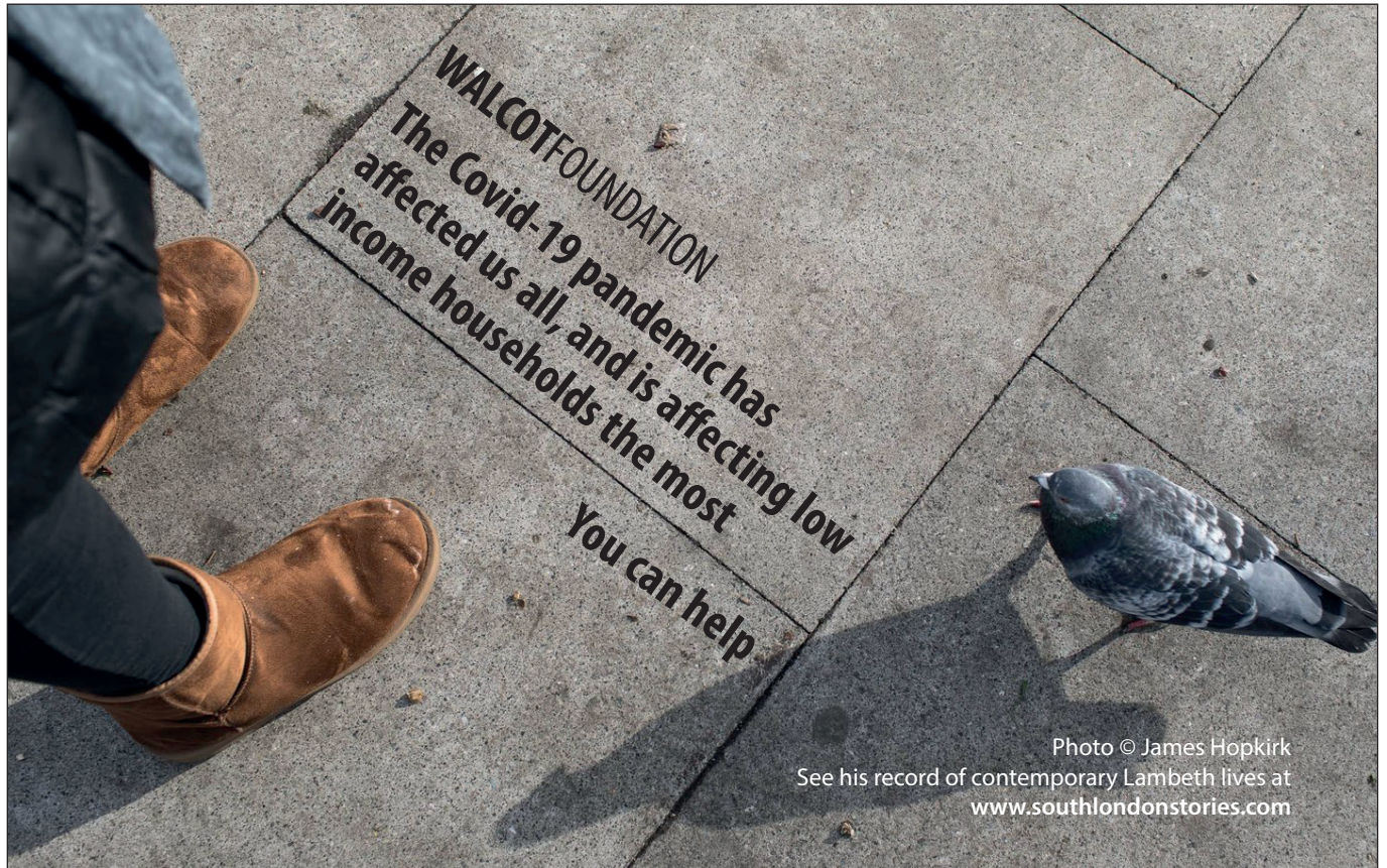
See his record of contemporary Lambeth lives at www.southlondonstories.com