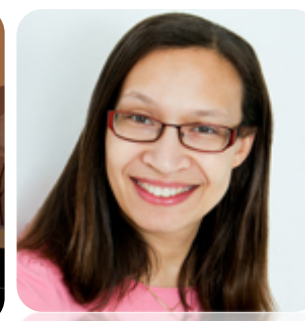
Amanda Hind Primary & Secondary Schools