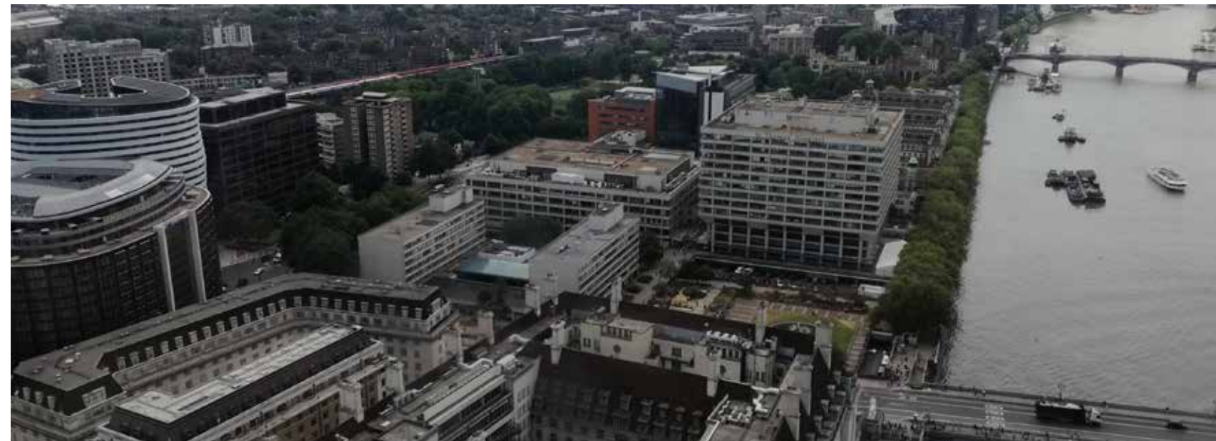
View: The roofscapes of Waterloo including County Hall