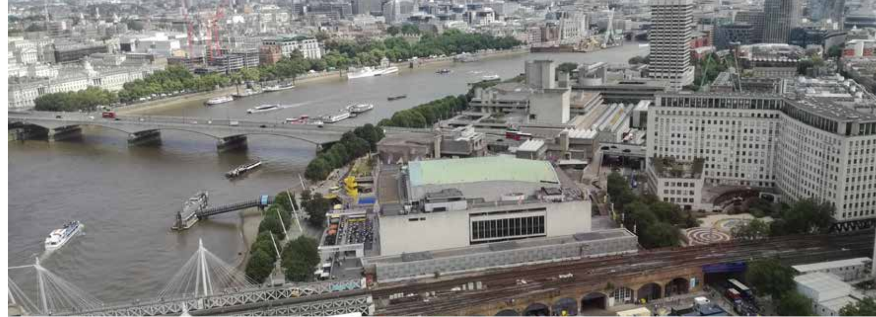
View: Panoramic view looking north over the South Bank