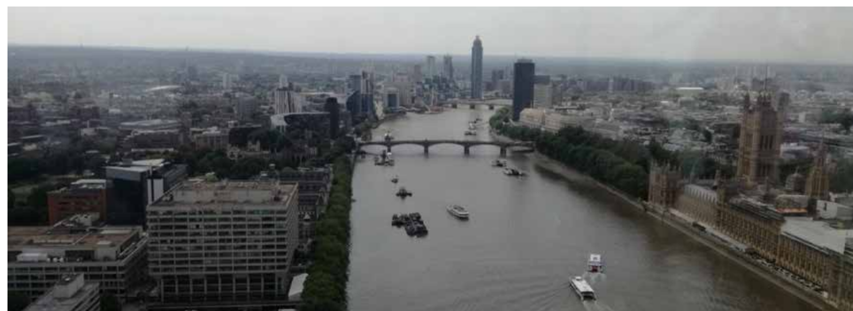
View: Panoramic view looking south over the roofscapes of Waterloo and north Lambeth