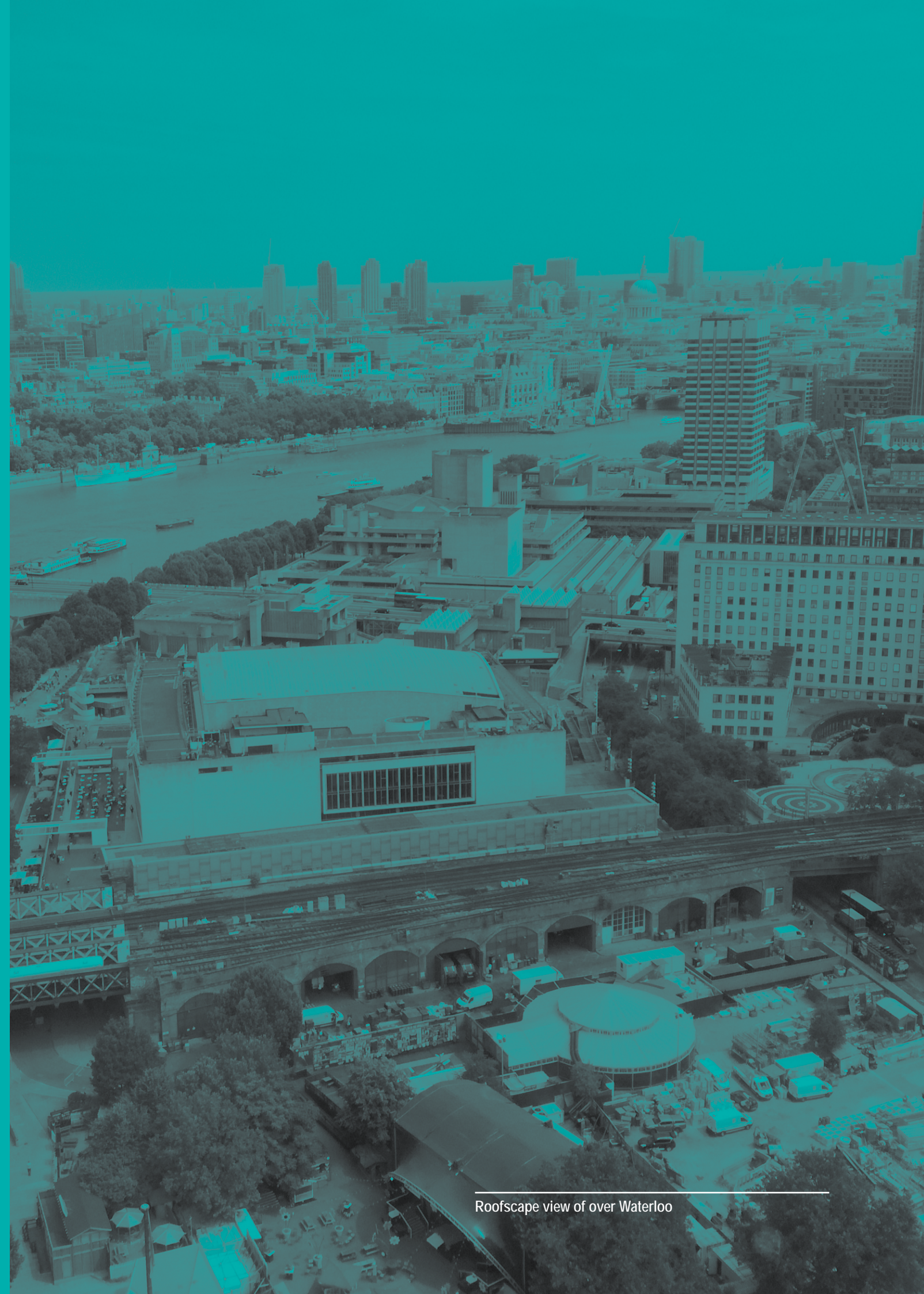
Roofscape view of over Waterloo