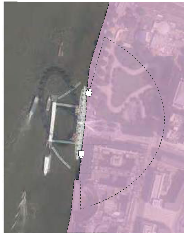
Viewing Location: London Eye passenger capsule