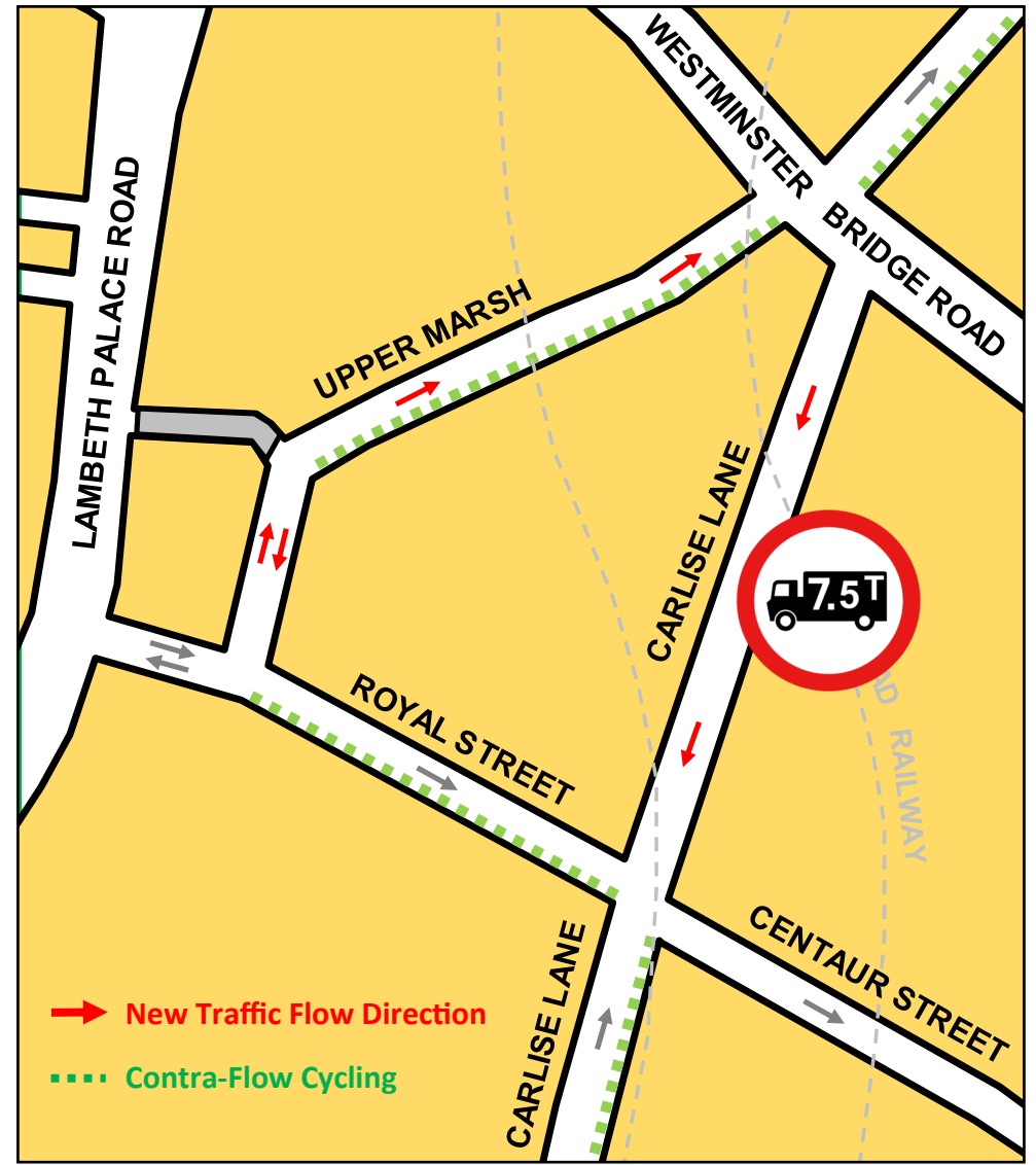
New Traffic System (from Late March 2018)